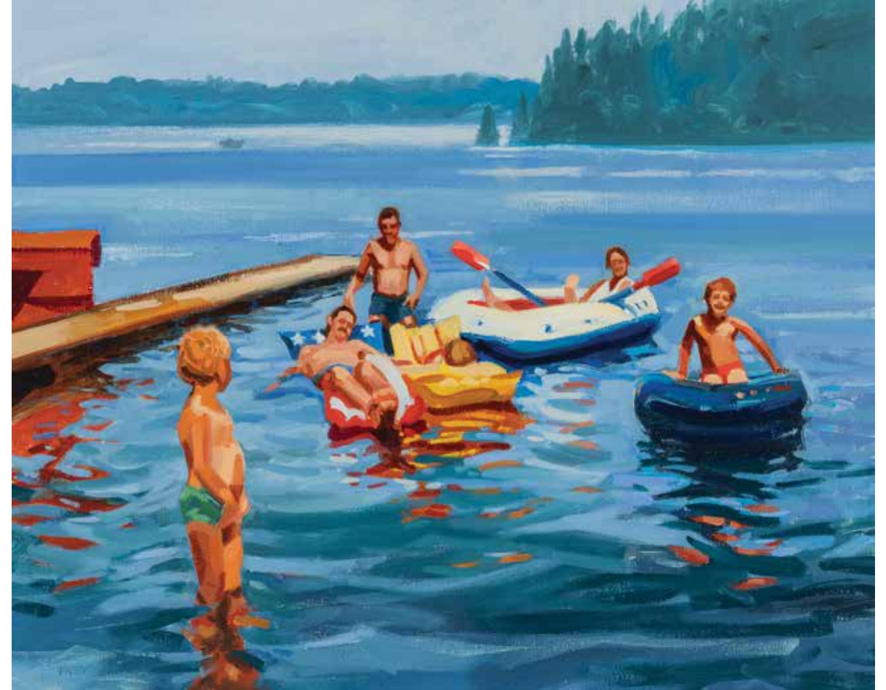
When We Were Kids , 2026, oil on linen, 24 x 30 inches

From Matisse, Frey also derives an interest in interiors, which we can see in My Room at Camp and From the Kitchen (p. 11). Being a Maine painter, of course, views through windows, as in both of these, and Inside/Outside (p. 1), also recall Lois Dodd. From Hodgkin's proclivity for