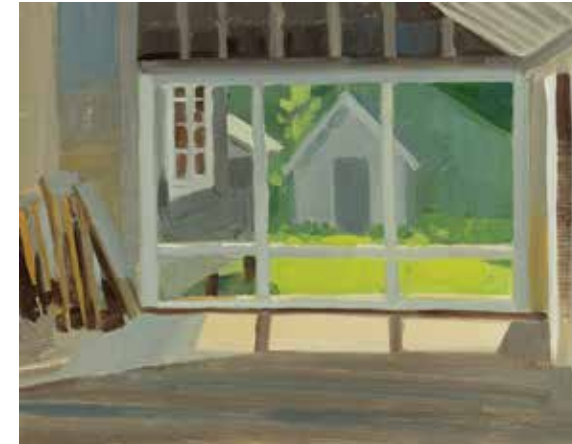
Inside/Outside (Study) , 2026, oil on linen panel, 11 x 14 inches