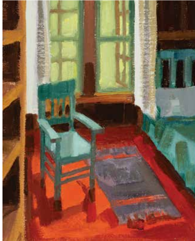
My Room At Camp , 2026, oil on panel, 10 x 8 inches

history have used diagonals, rectangles, and proportional divisions to create harmonious, balanced artworks. Bouleau studied the underlying structure of many successful artworks, and determined their visual power was achieved by using a harmonic grid to divide up a rectangular surface (a canvas, say). By placing elements at the intersections of these lines, the artist creates tension, energy and visual allure.