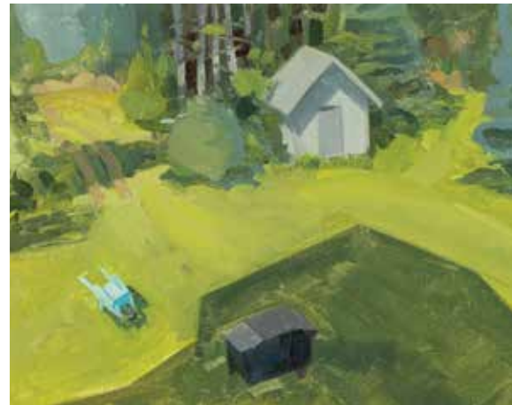
Barrow, Shed and Shadow (Study) , 2026, oil on linen panel, 12 x 16 inches