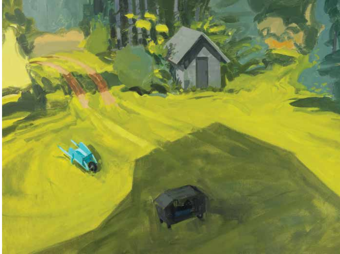
Barrow, Shed and Shadow , 2026, oil on linen, 30 x 40 inches