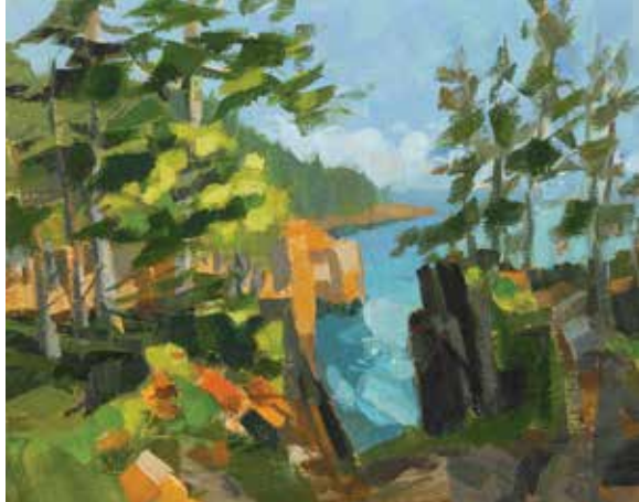
Afternoon Ravens Nest , 2026 , oil on panel, 8 x 10 inches