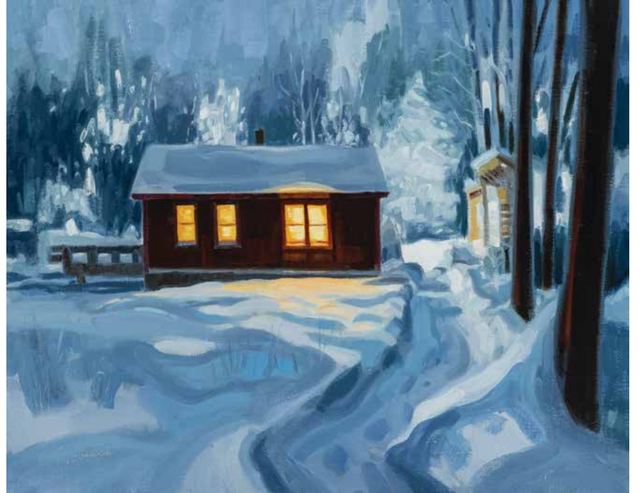
Winter Storm, Warm Lights , 2026, oil on linen, 24 x 30 inches