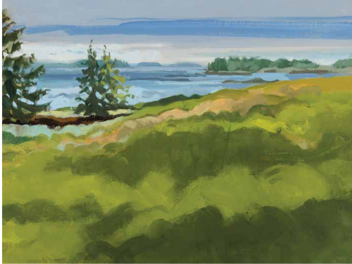
Coastal Rhythms, 2026, oil on linen, 18 x 24 inches