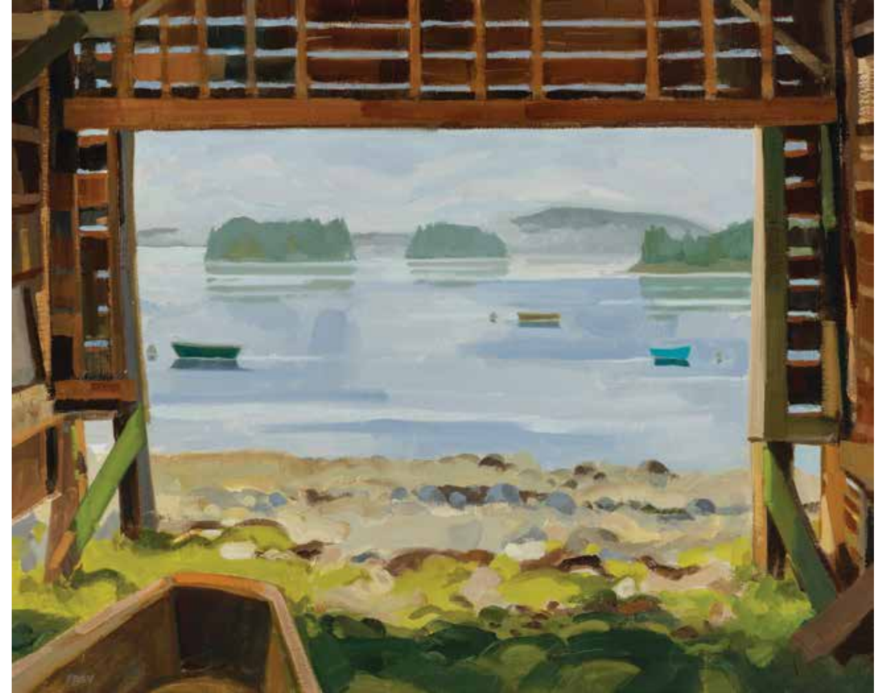
Boathouse Light , 2026, oil on linen, 24 x 30 inches