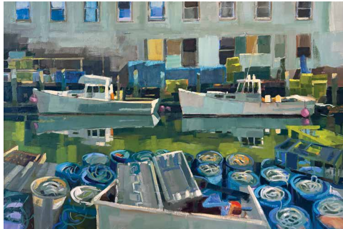
Wharf Colors , 2026, oil on linen, 40 x 60 inches

Frey, a Buddhist since the early 1990s, also perceives light at a level that goes beyond actual physical phenomenon. “There is a metaphor in Buddhist thought about