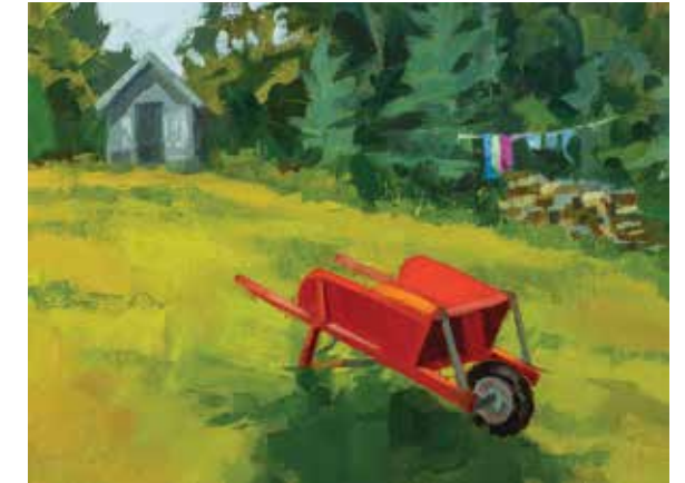
Red Wheelbarrow, 2026, oil on linen panel, 12 x 16 inches

Clothesline (Study) and Red Wheelbarrow also embody the theory of harmonic armature that Frey gleaned from Charles Bouleau’s The Painter’s Secret Geometry . Rather than rely on intuition alone, master artists throughout