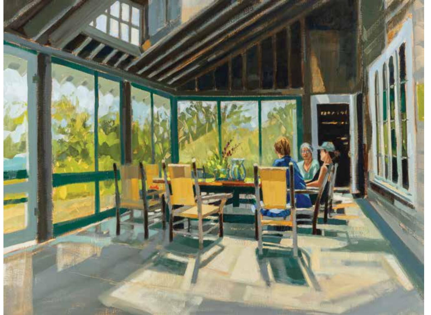
Conversation On The Porch , 2026, oil on linen, 30 x 40 inches