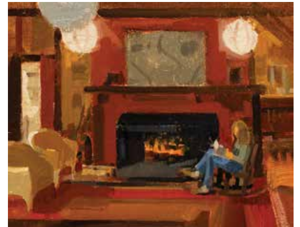
Reading , 2026, oil on linen panel, 8 x 10 inches