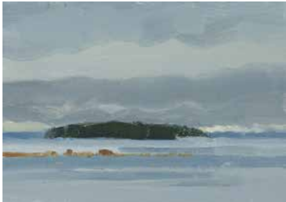
Layers and Light , 2026, oil on linen panel, 5 x 7 inches

light (of wisdom or clarity) as eliminating the darkness of ignorance,” he explains. “When there is darkness, you can’t see, and when there is light, it illuminates things you don’t normally see. But I don’t want to be overt about it. I want to suggest the essence of something without overstating it.”