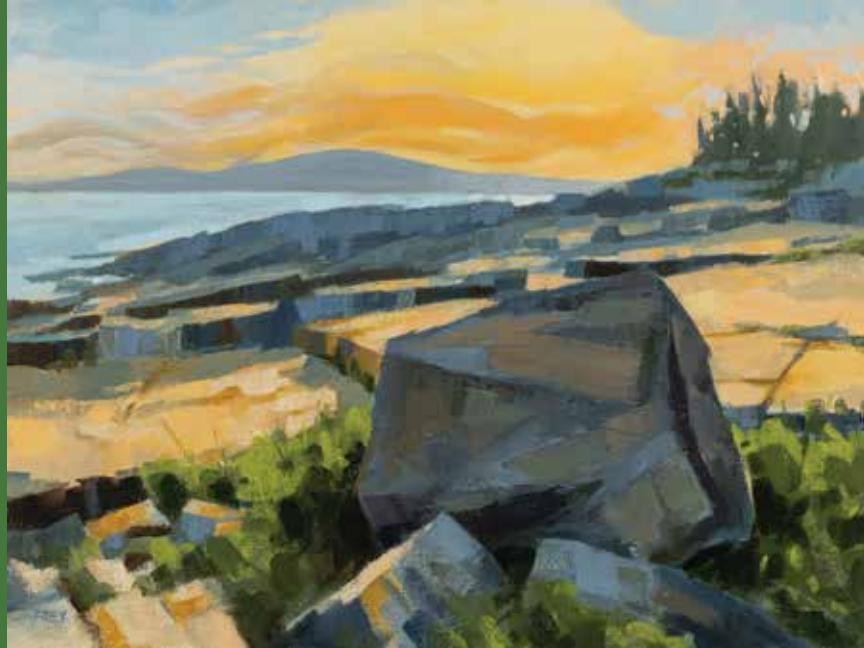
Cool and Warm, 2026, oil on linen, 12 x 16 inches