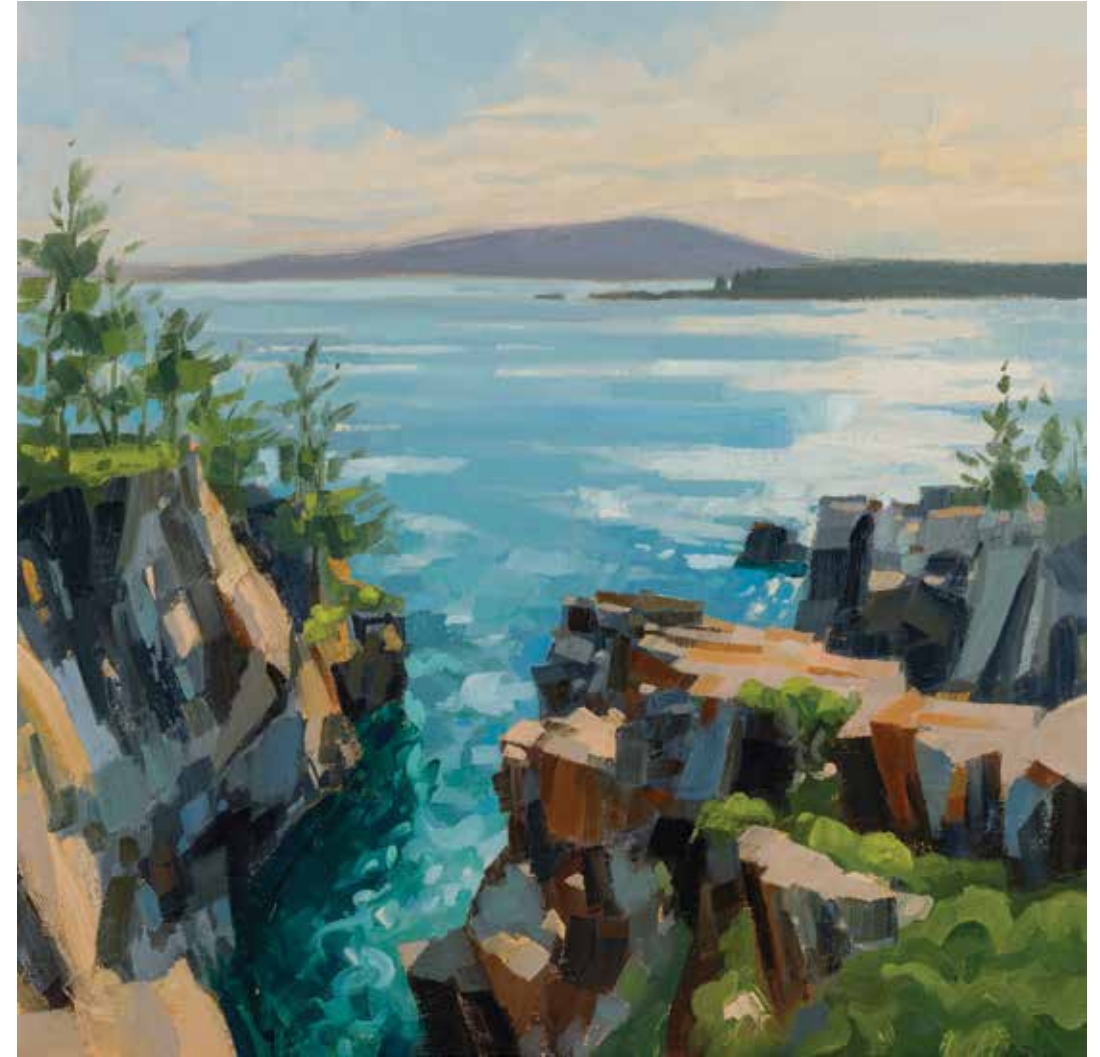
The Sparkle of Ravens Nest, 2026, oil on linen, 20 x 20 inches