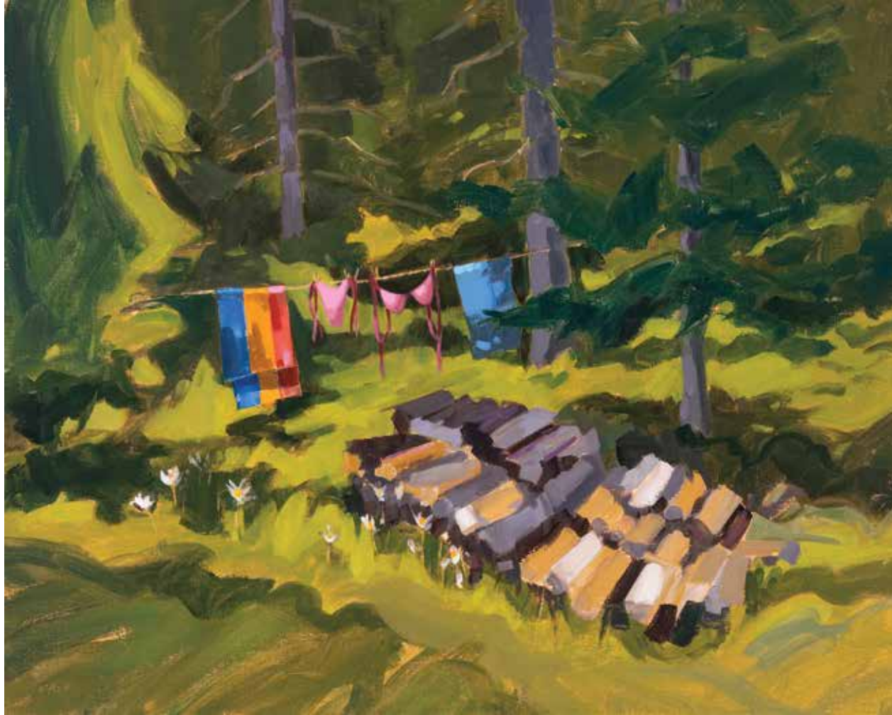
Clothesline, 2026, oil on linen, 24 x 30 inches

detail intimating they were perceived in the act of being jostled by coastal winds.