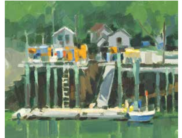
Bunker's Harbor , 2026, oil on linen panel, 8 x 10 inches