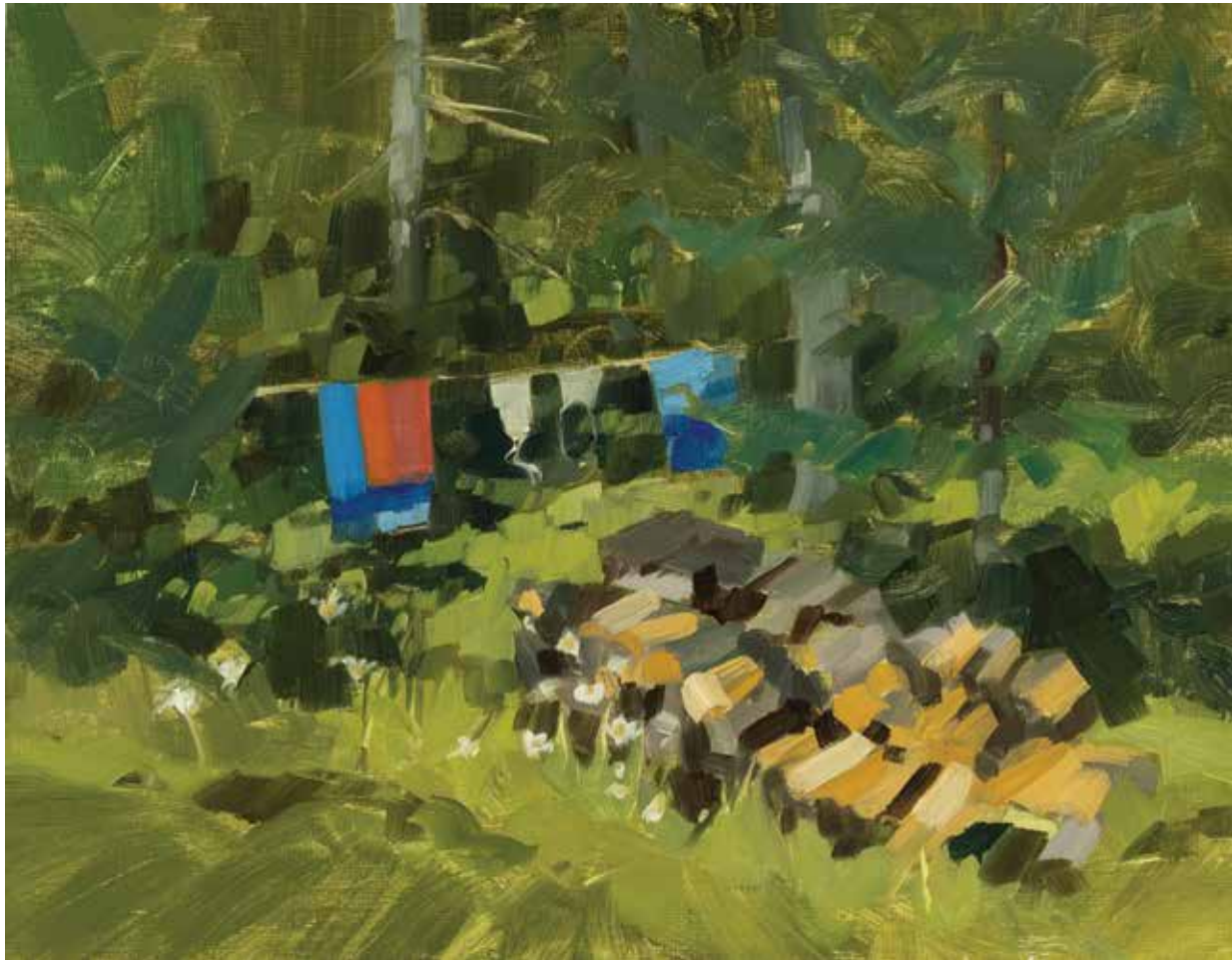
Clothesline (Study) , 2026, oil on linen panel, 12 x 16 inches