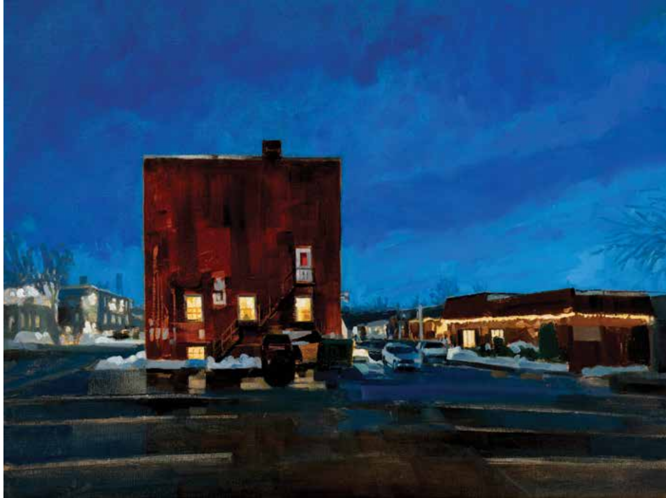
Twilight , 2026, oil on linen, 30 x 40 inches