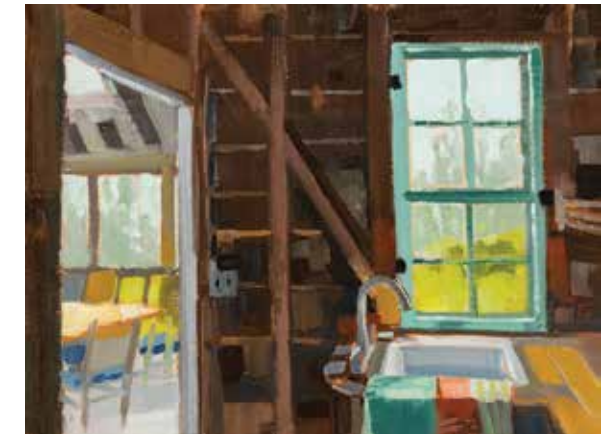
From the Kitchen, 2026, oil on linen panel, 12 x 16 inches