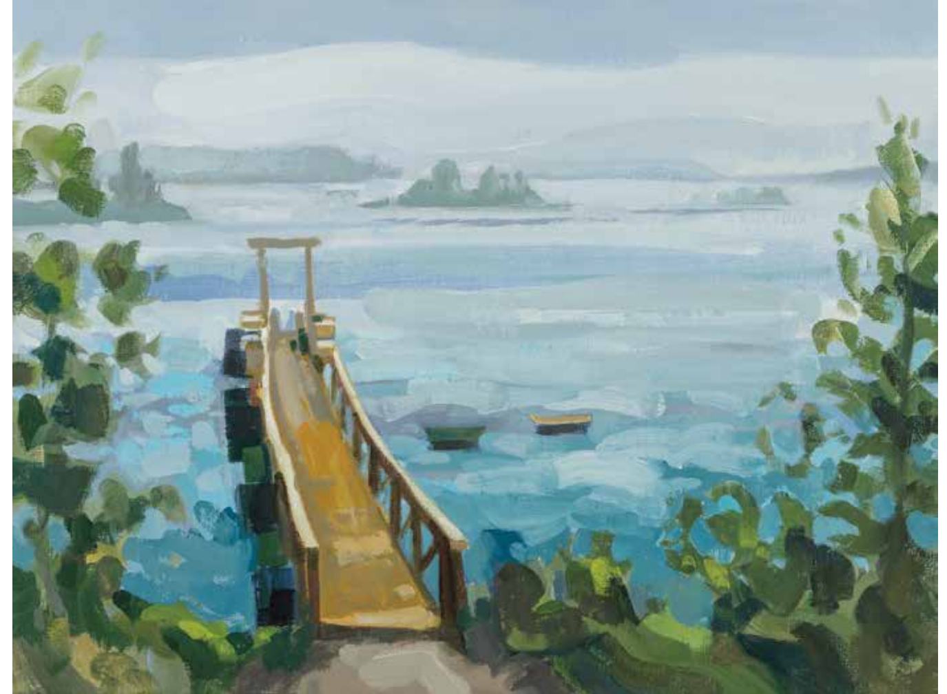
Pier, Patterns and Fog , 2026, oil on linen, 18 x 24 inches

Frey’s oil-on-panel Afternoon, Raven’s Nest is a good example. To those who know the Schoodic Peninsula in Acadia National Park, the scene is instantly recognizable as this dramatic cliffside spot. Yet nothing about this painter’s interpretation is static. Light dances off granite rock faces and blue water—themselves no more than patches of mottled colors—and it illuminates pine trees in some areas but not others, indicating a certain temporary slant of the sun’s rays. The trees themselves look angular and unfocused, the absence of specificity and