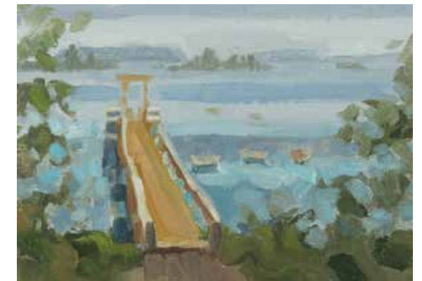
Pier and Patterns (Study) , 2026, oil on panel, 5 x 7 inches

BFA (Painting) Cum Laude, Syracuse University, NY 1990 Columbus College of Art and Design, Columbus, OH 1986–1988