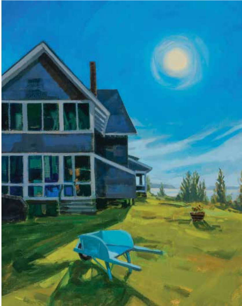
Island Life , 2026, oil on linen, 30 x 24 inches