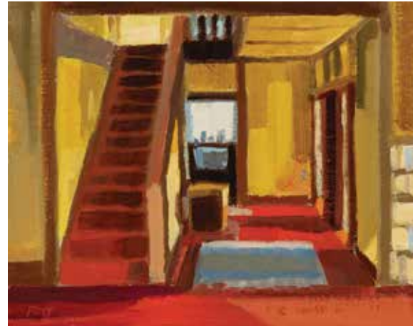
Red and Gold , 2026, oil on linen panel, 8 x 10 inches