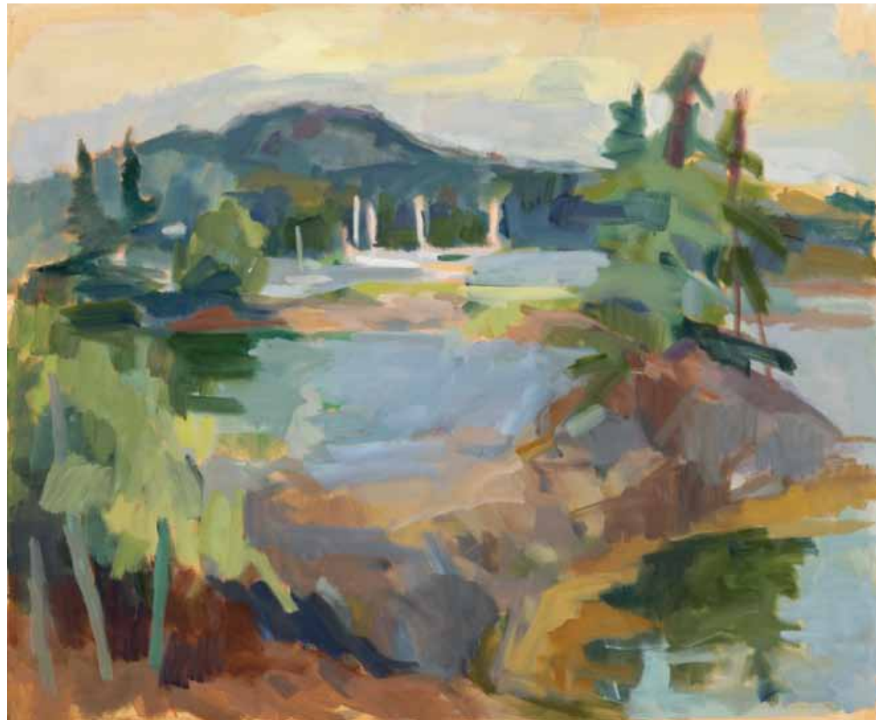
Blue Hill , 2017, oil on canvas, 30 x 36 inches