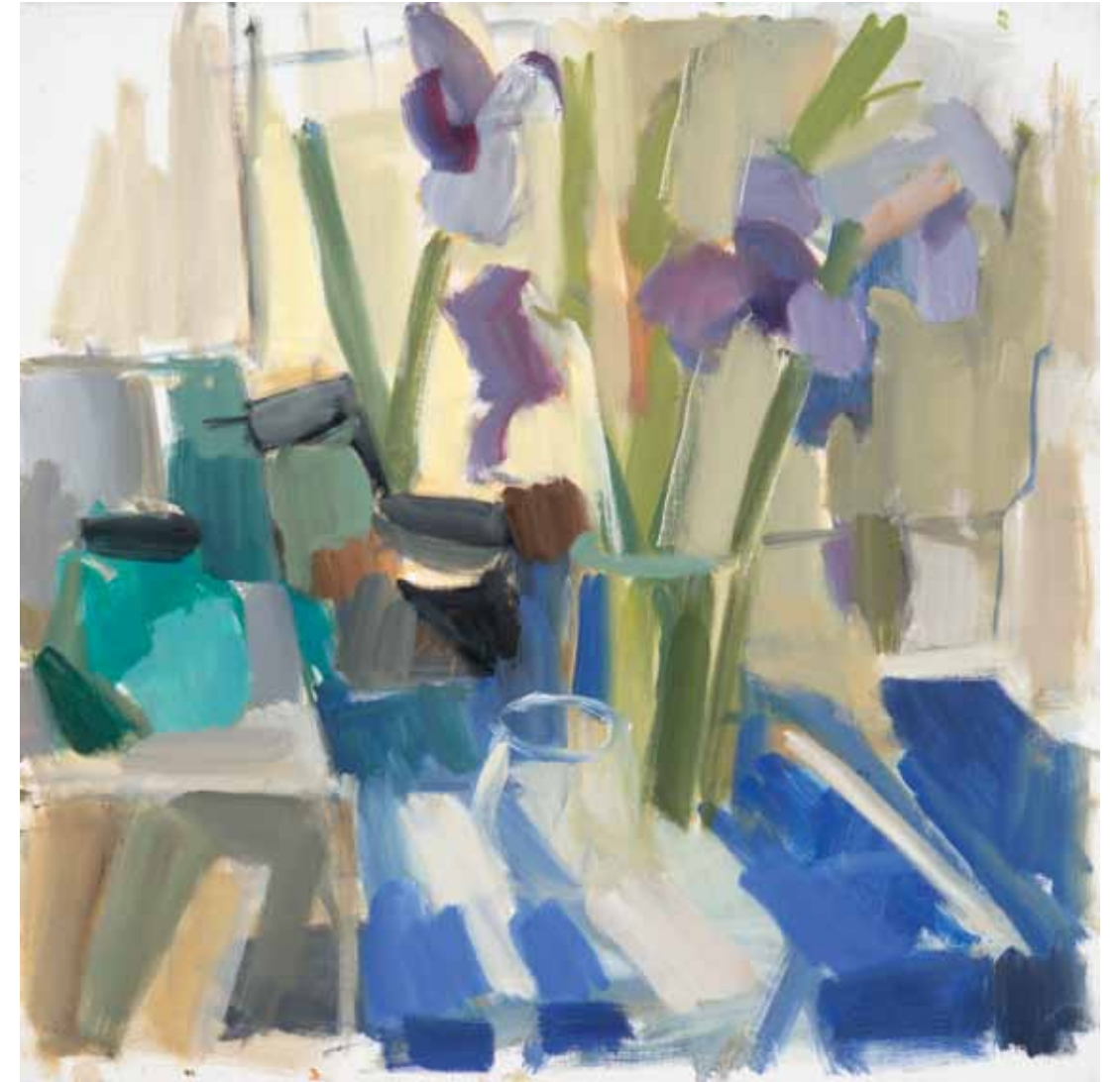
Small Iris Study , 2017, oil on canvas, 20 x 20 inches