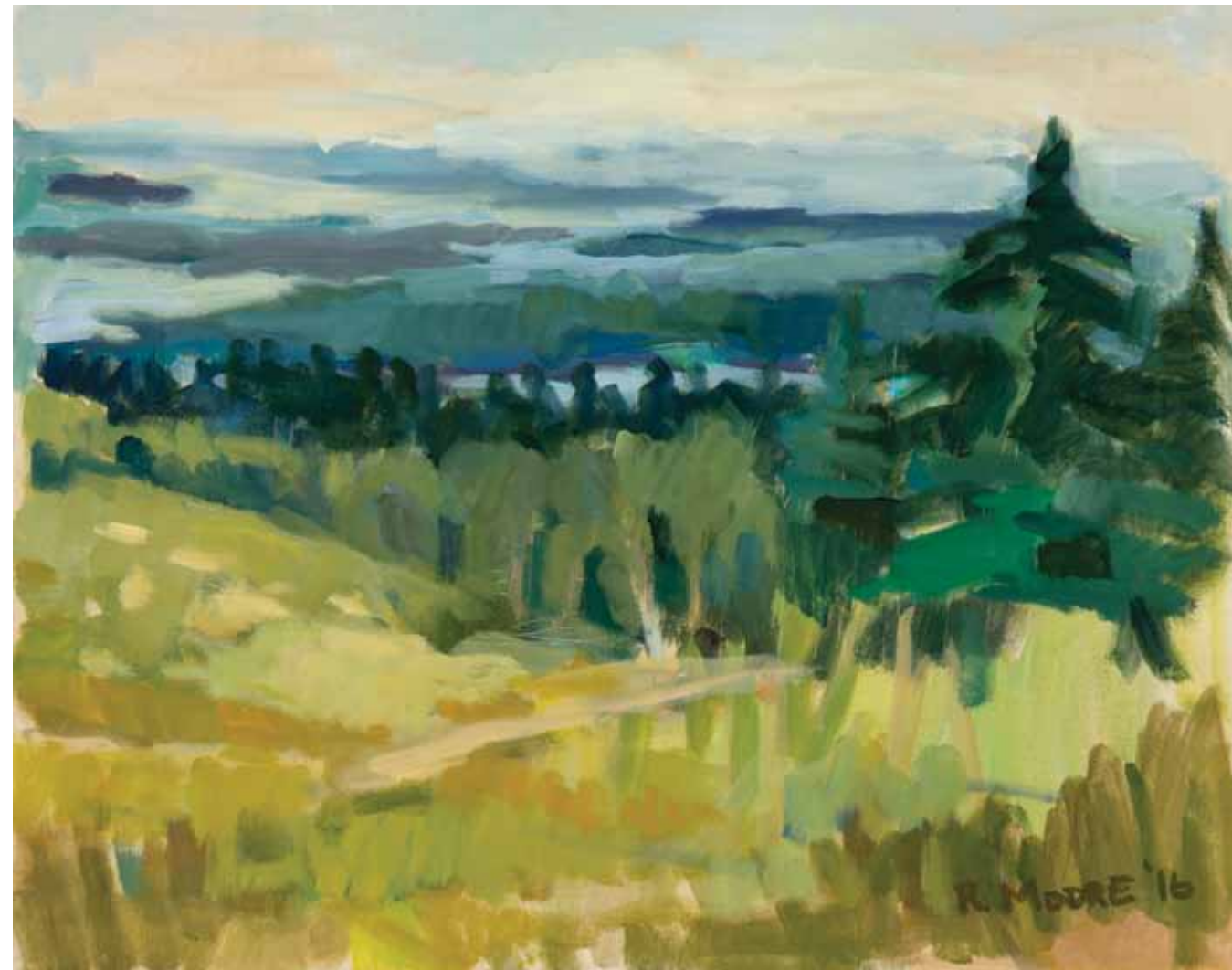
Beyond the View , 2016, oil on canvas, 24 x 30 inches