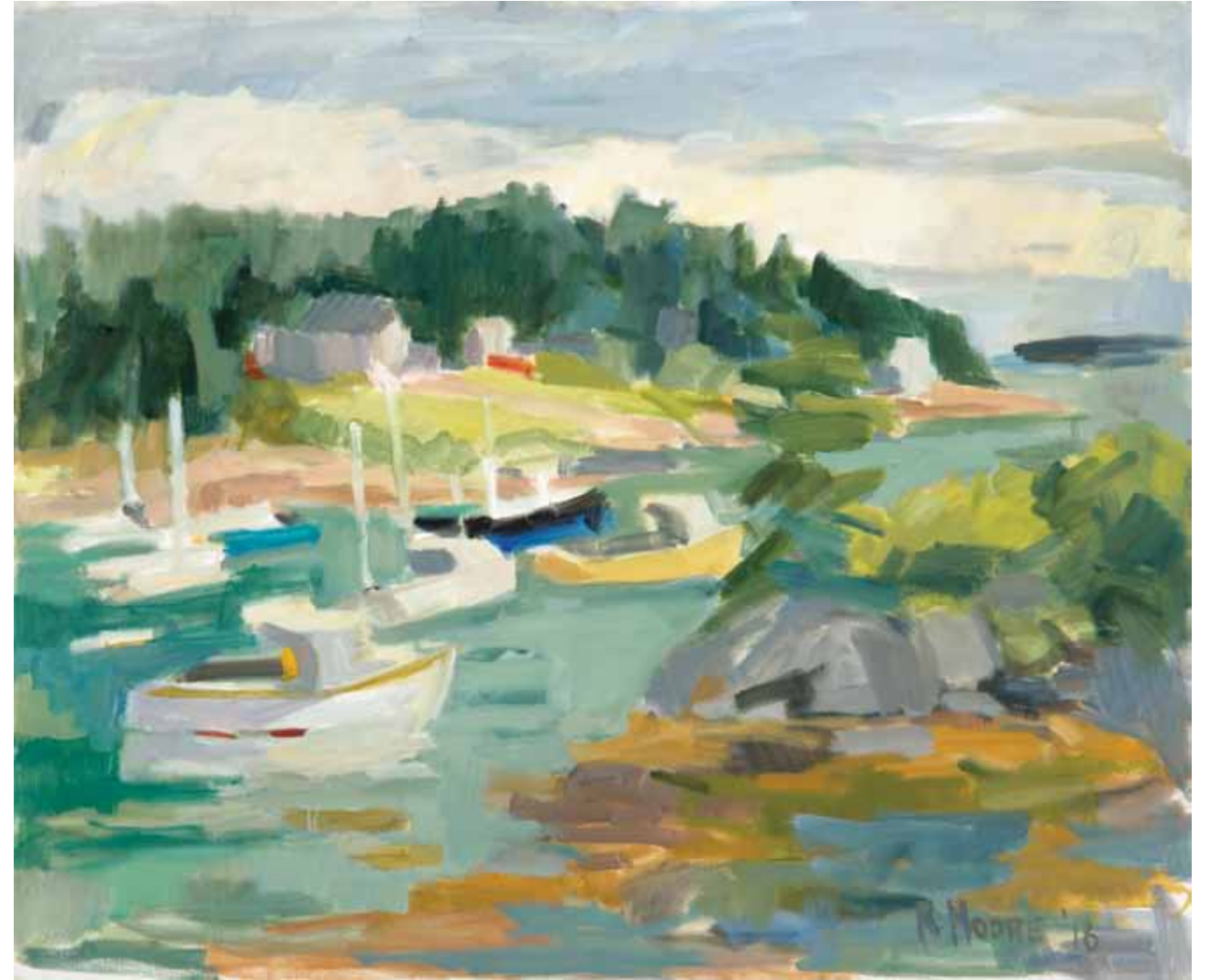
Boats in Corea, 2016, oil on canvas, 30 x 36 inches

Her boats are alive on their moorings, often pointed seaward. The water is a wonderful array of reflections. Light reigns, even on cloudy downeast days. — Carl Little