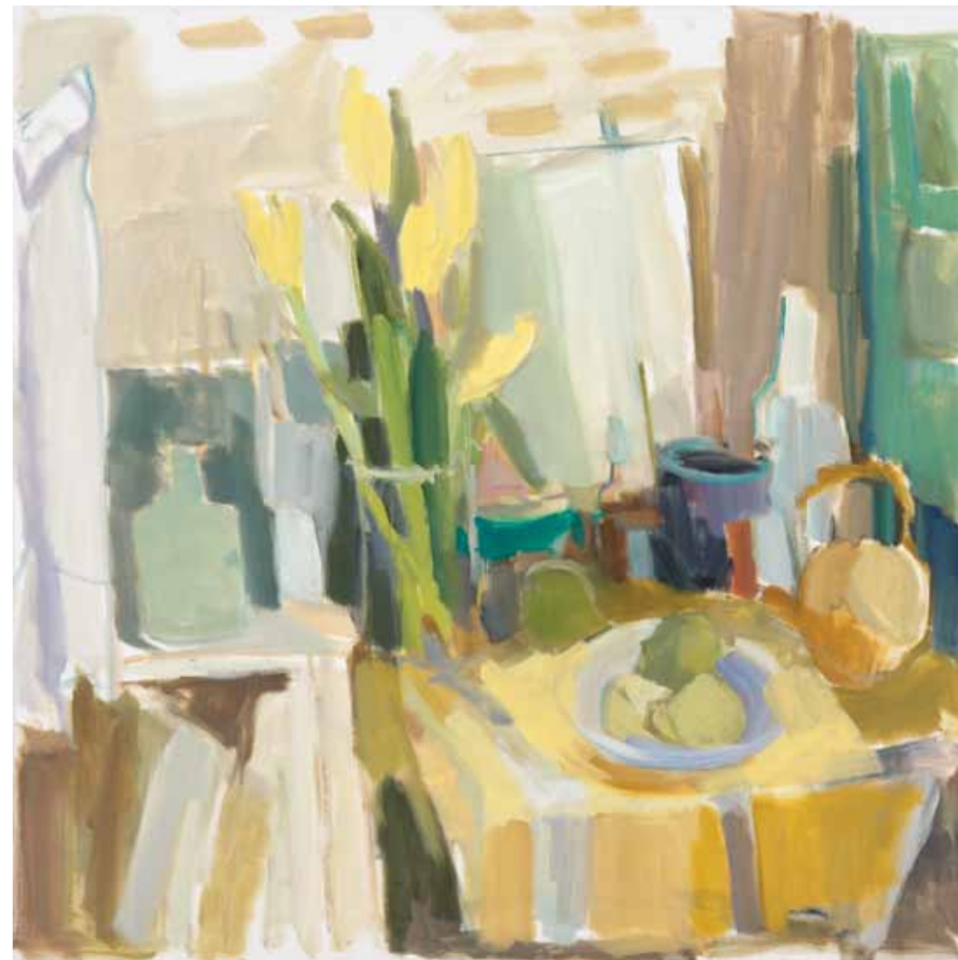
Corner with Yellow Flowers, 2017, oil on paper, 32 x 32 inches