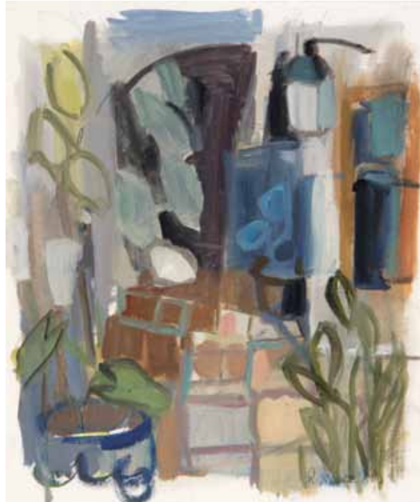
The Courtyard , 2017, oil on paper, 18 x 15 inches

A Rosie Moore painting invites the viewer to look, to question one's perception of reality, and to enjoy the glorious shapes and colors that are often overlooked in the hustle and bustle of modern life.