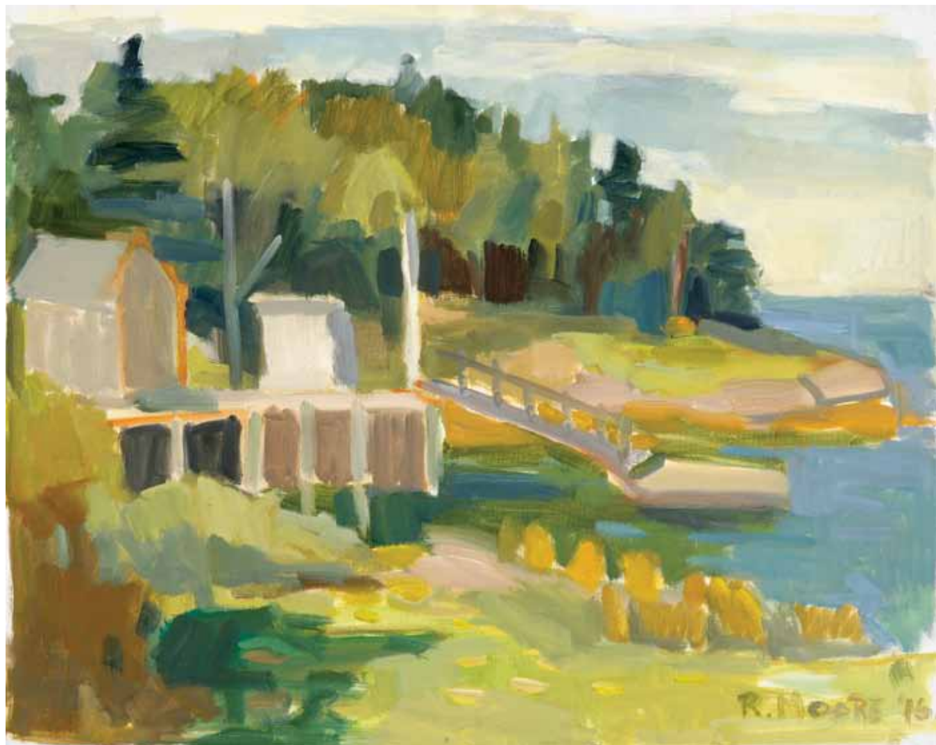
Quiet Cove , 2016, oil on canvas, 24 x 30 inches