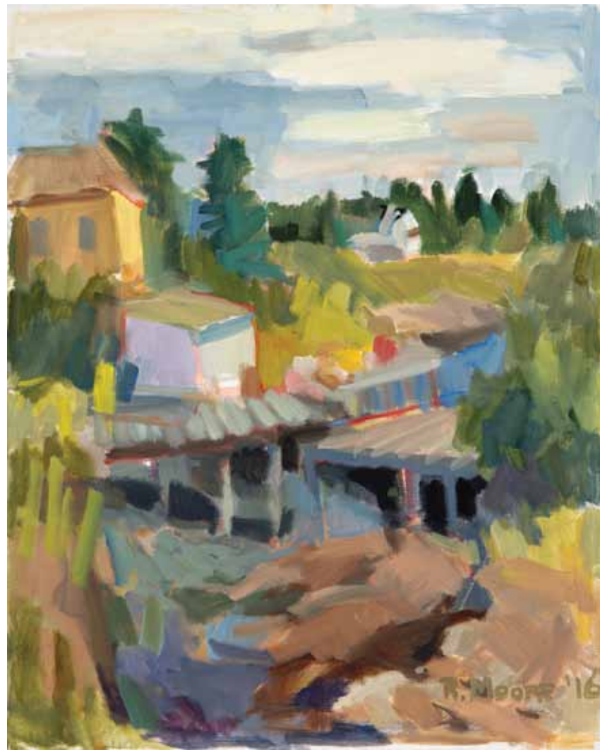
Up the Creek, Corea, 2016, oil on canvas, 30 x 24 inches