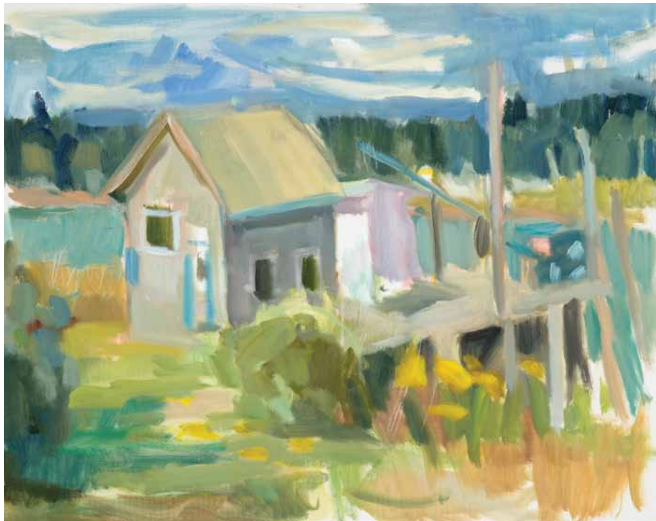
Lobster Shack on the Dock, 2016, oil on canvas, 24 x 30 inches