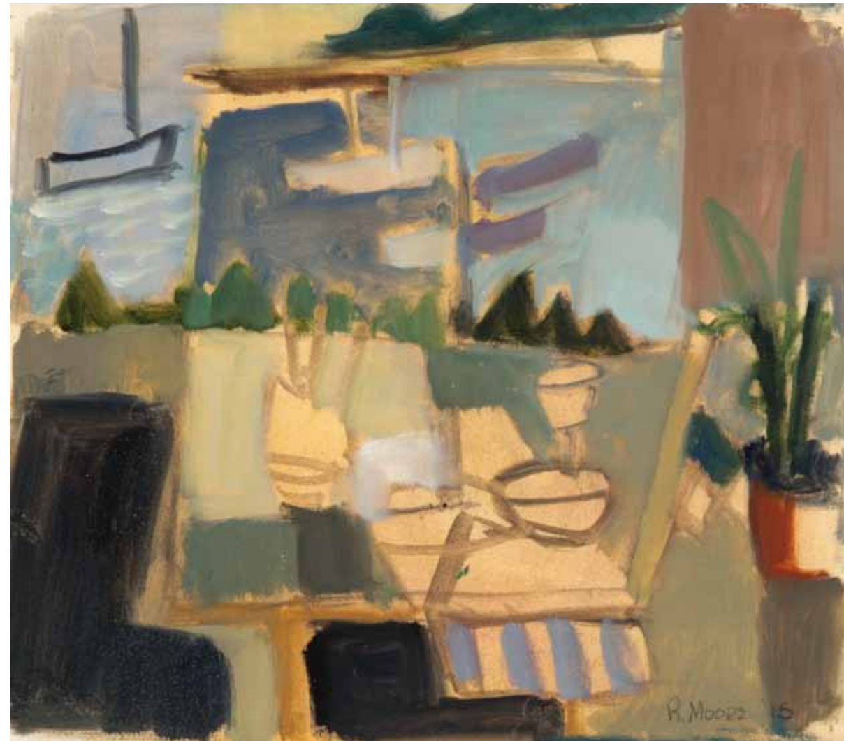
Cubist View , 2015, oil on paper, 15 x 16.5 inches