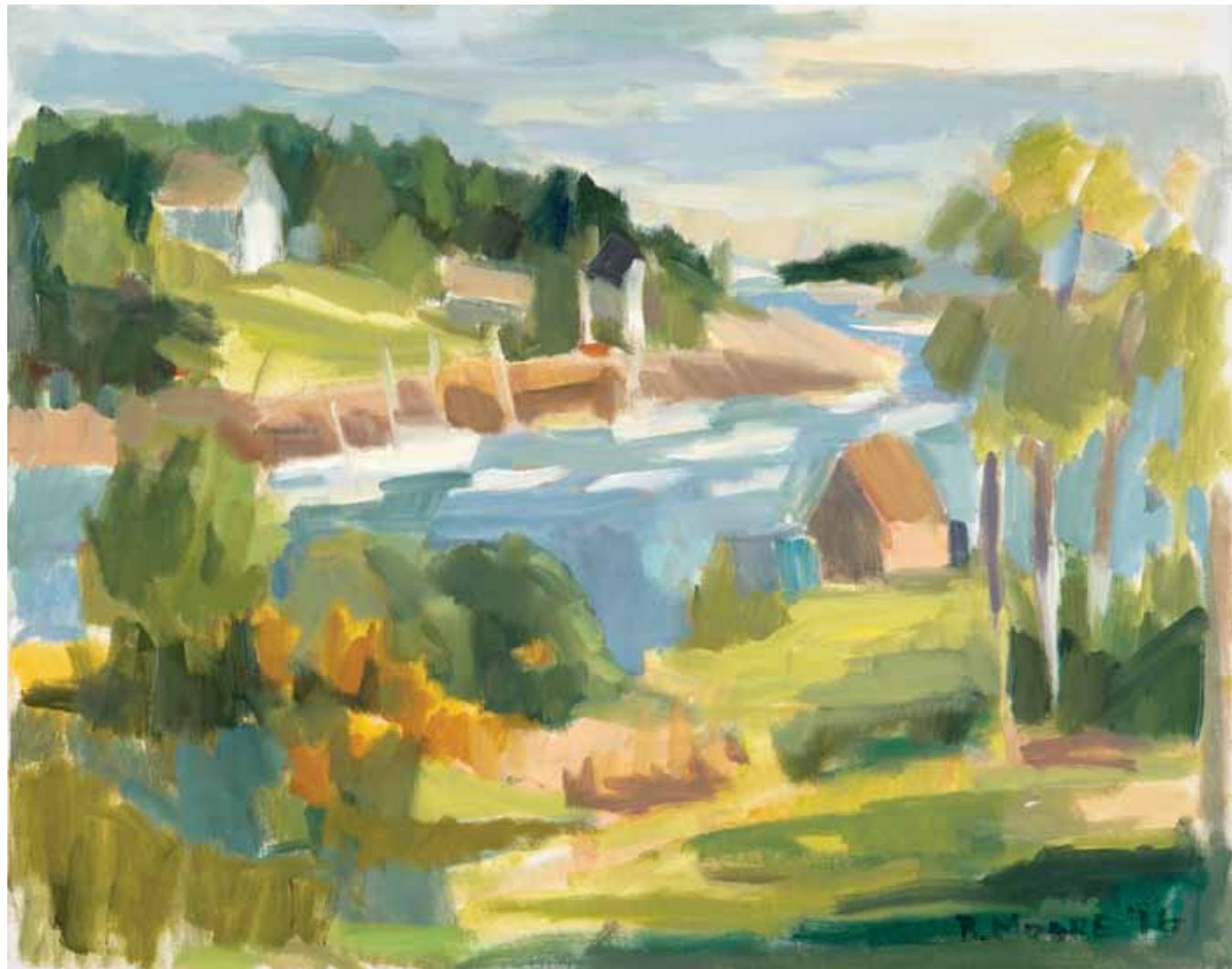
Across Water , 2016, oil on canvas, 24 x 30 inches