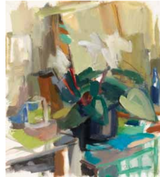
White Calendula , 2016, oil on paper, 17 x 15.5 inches