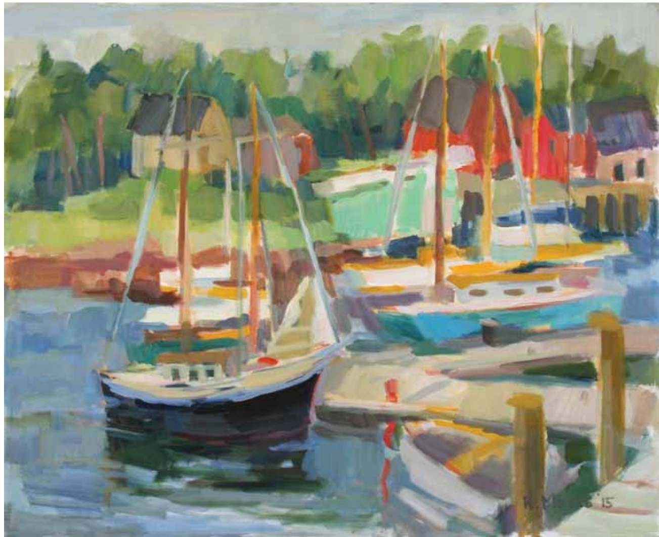
Black Beauty II , 2015, oil on canvas, 30 x 36 inches