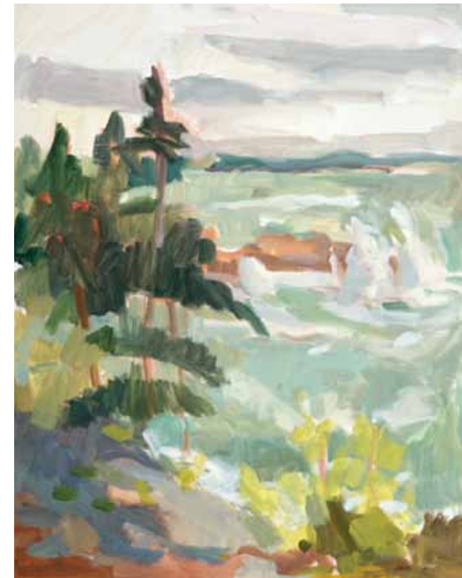
Acadia Greens , 2016, oil on canvas, 30 x 24 inches