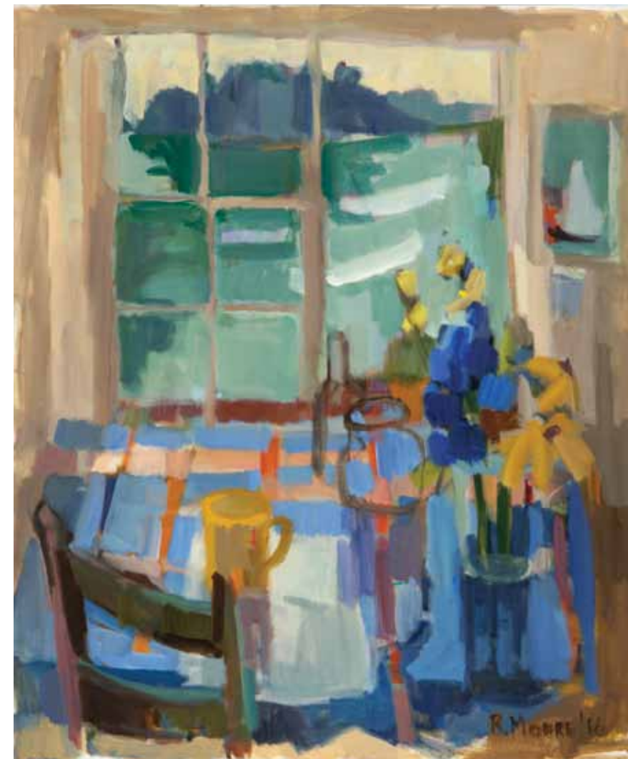
Summer Window, 2016, oil on canvas, 36 x 30 inches