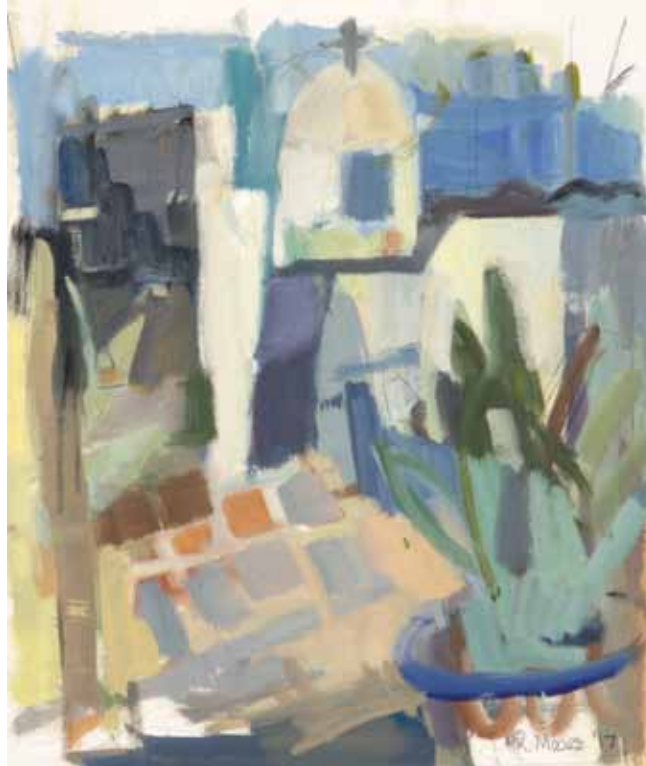
Mexican Moment , 2017, oil on paper, 18 x 15 inches