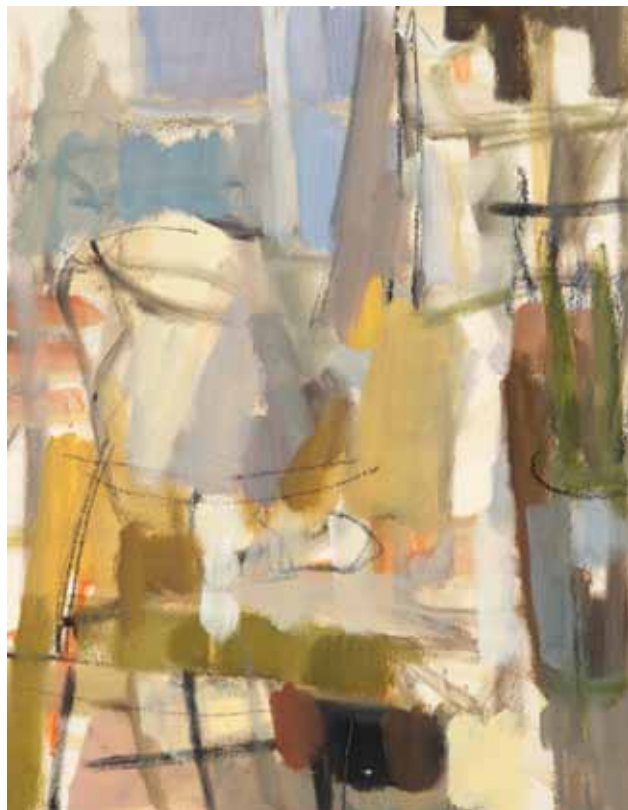
Whisper , 2016, oil on paper, 12 x 16.5 inches