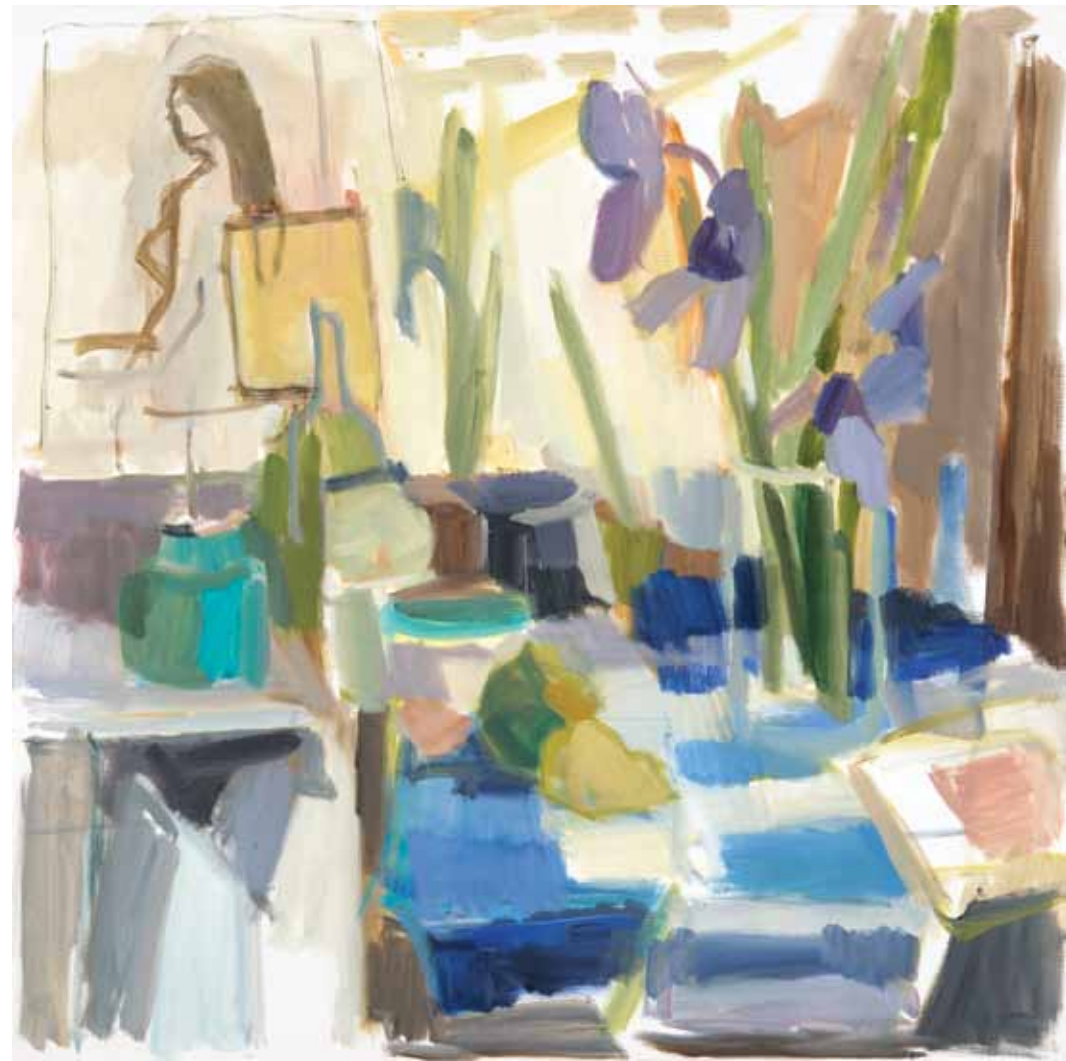
Still Life with Iris , 2017, oil on canvas, 30 x 30 inches