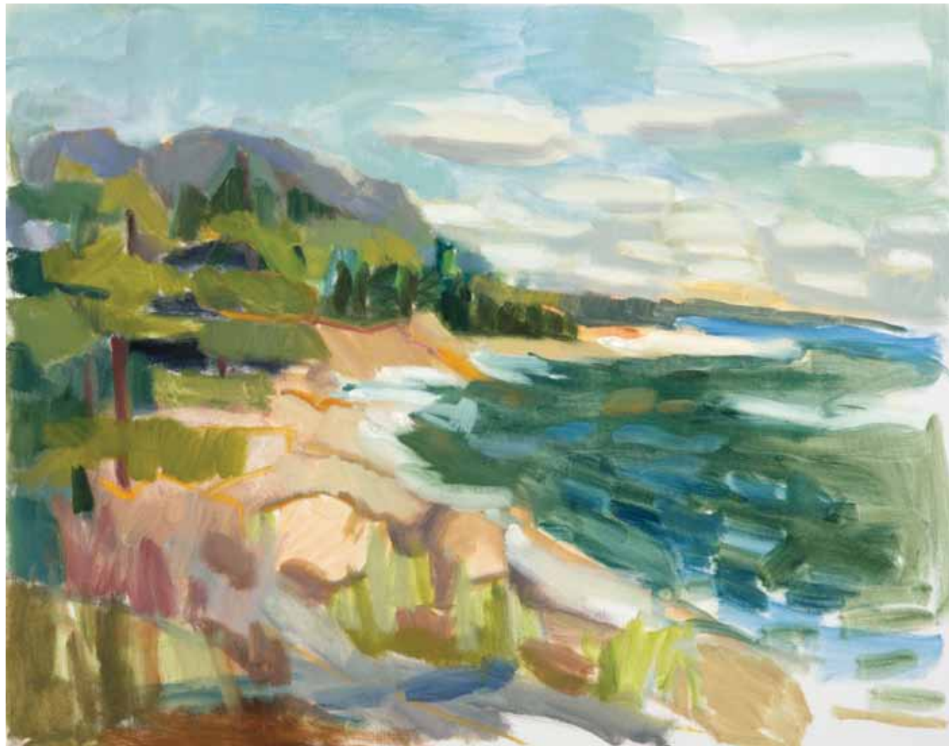
Acadia , 2016, oil on canvas, 24 x 30 inches