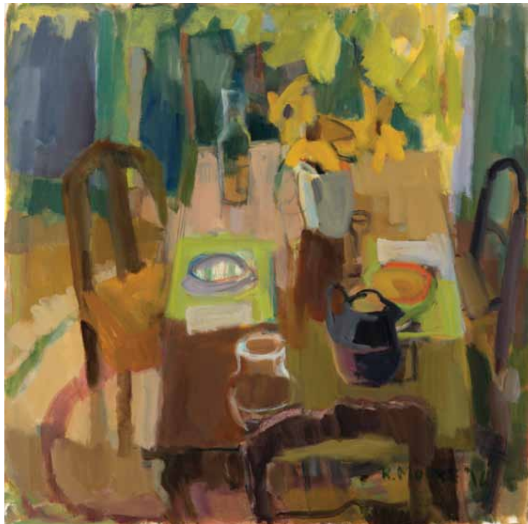
Summer Porch Table, 2016, oil on canvas, 30 x 30 inches