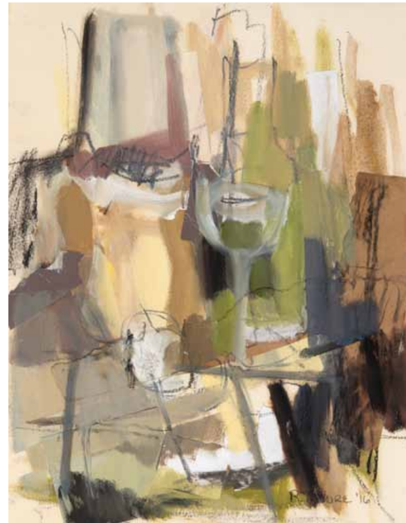
Assemblage , 2016, oil on paper, 15 x 12 inches