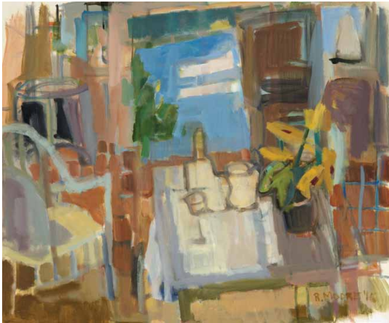
Transition , 2016, oil on canvas, 30 x 36 inches