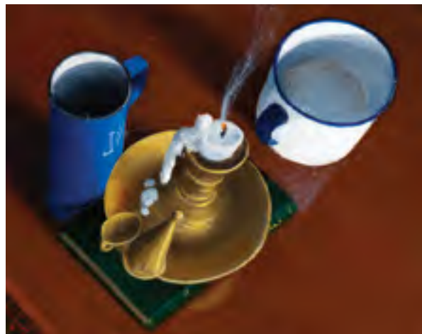
Old Things oil on panel 8 x 10 inches