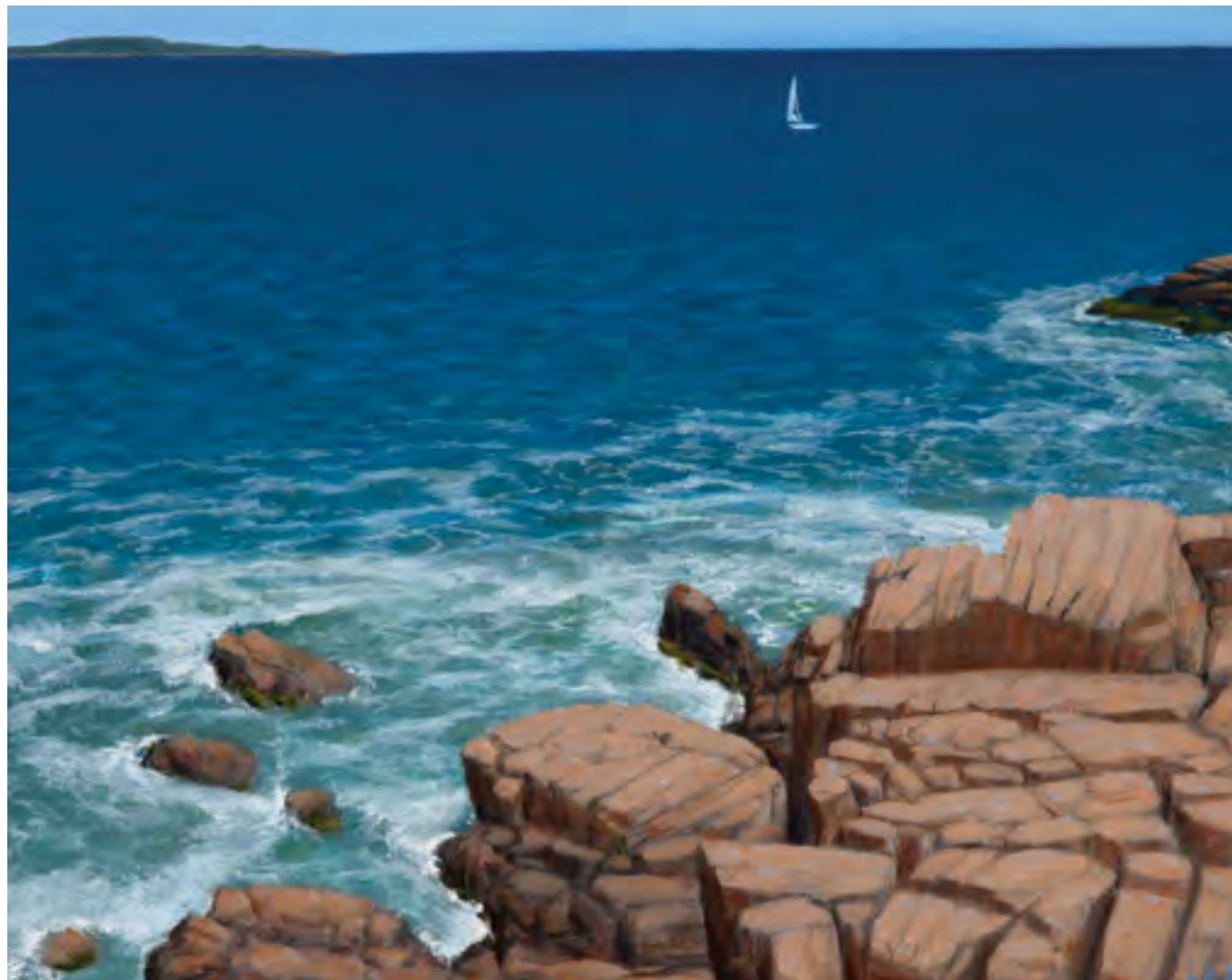
Schoodic from Acadia , oil on canvas, 16 x 20 inches BACK COVER Somesville Landing, detail , oil on canvas, 18 x 36 inches