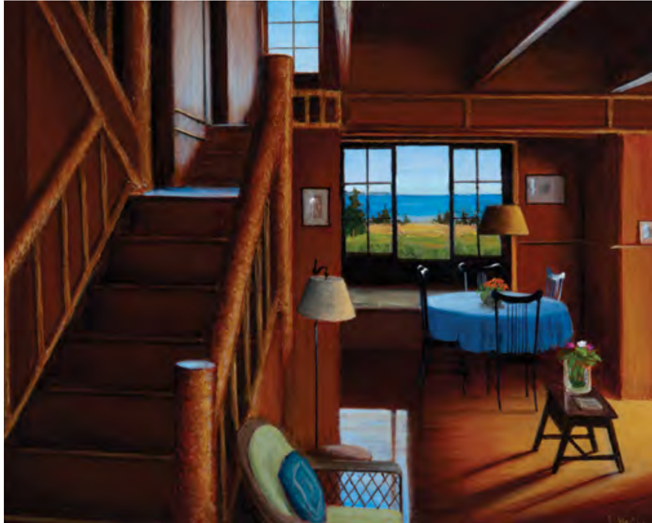
OPPOSITE A Cozy Cottage oil on canvas 13 x 16 inches