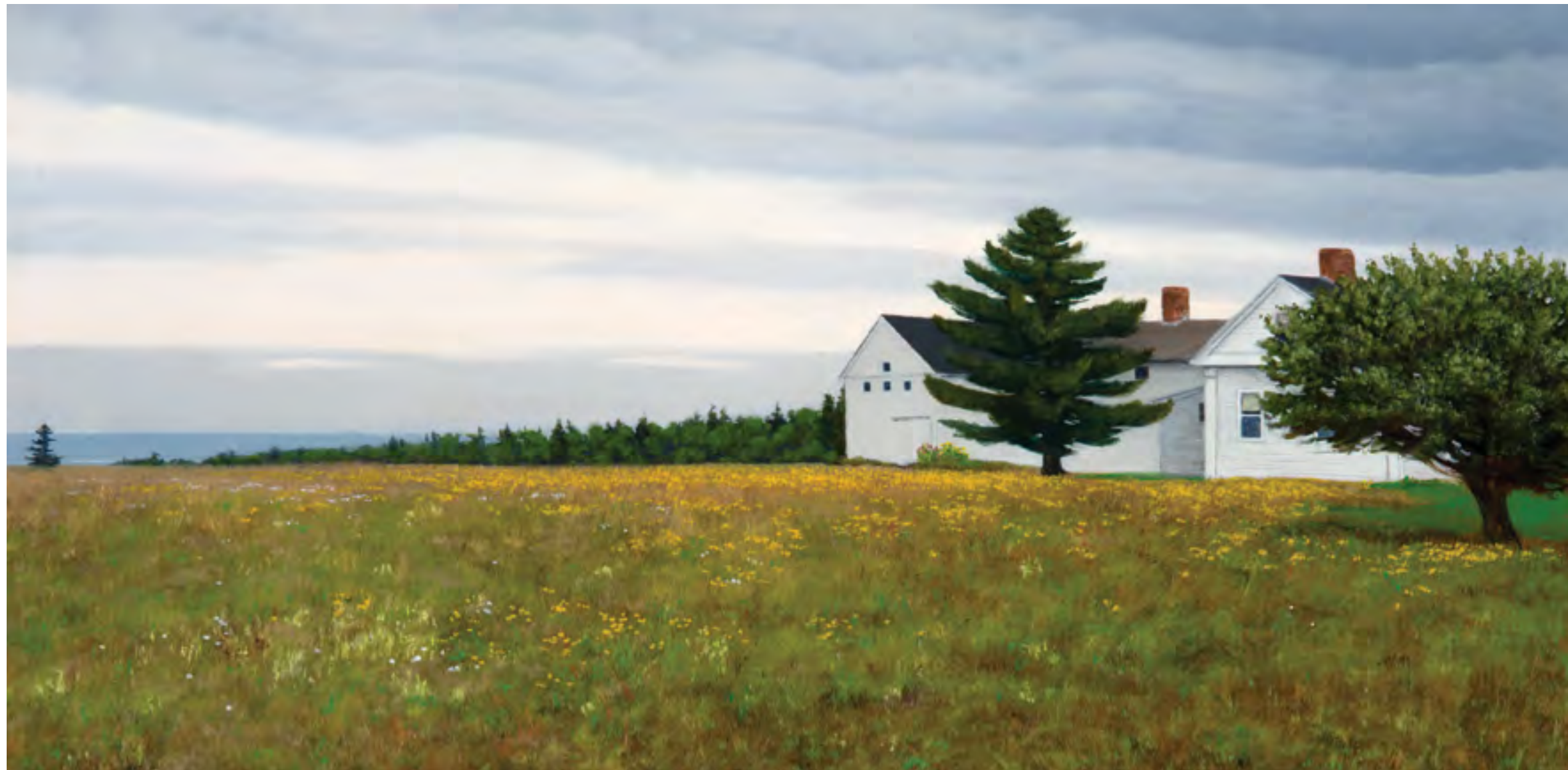
Saltwater Farm oil on canvas 20 x 40 inches