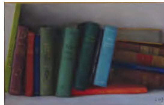
Old Books , oil on canvas, 9 x 14 inches