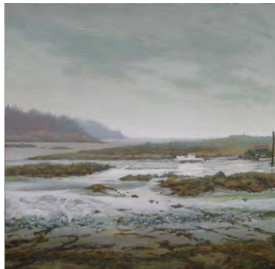
Lowest Tide, 2013, oil on panel, 10.5 x 9.5 inches

There were paintings everywhere, propped up against furniture, hanging all over the walls. Inviting crits was a common practice my father encouraged. The only books to read were big art books, so I grew up learning about art history. The studio was in the house, and it was a very special and totally different place exclusive to my father. We respected the "art zone," but we were always welcomed when we wanted to create also.