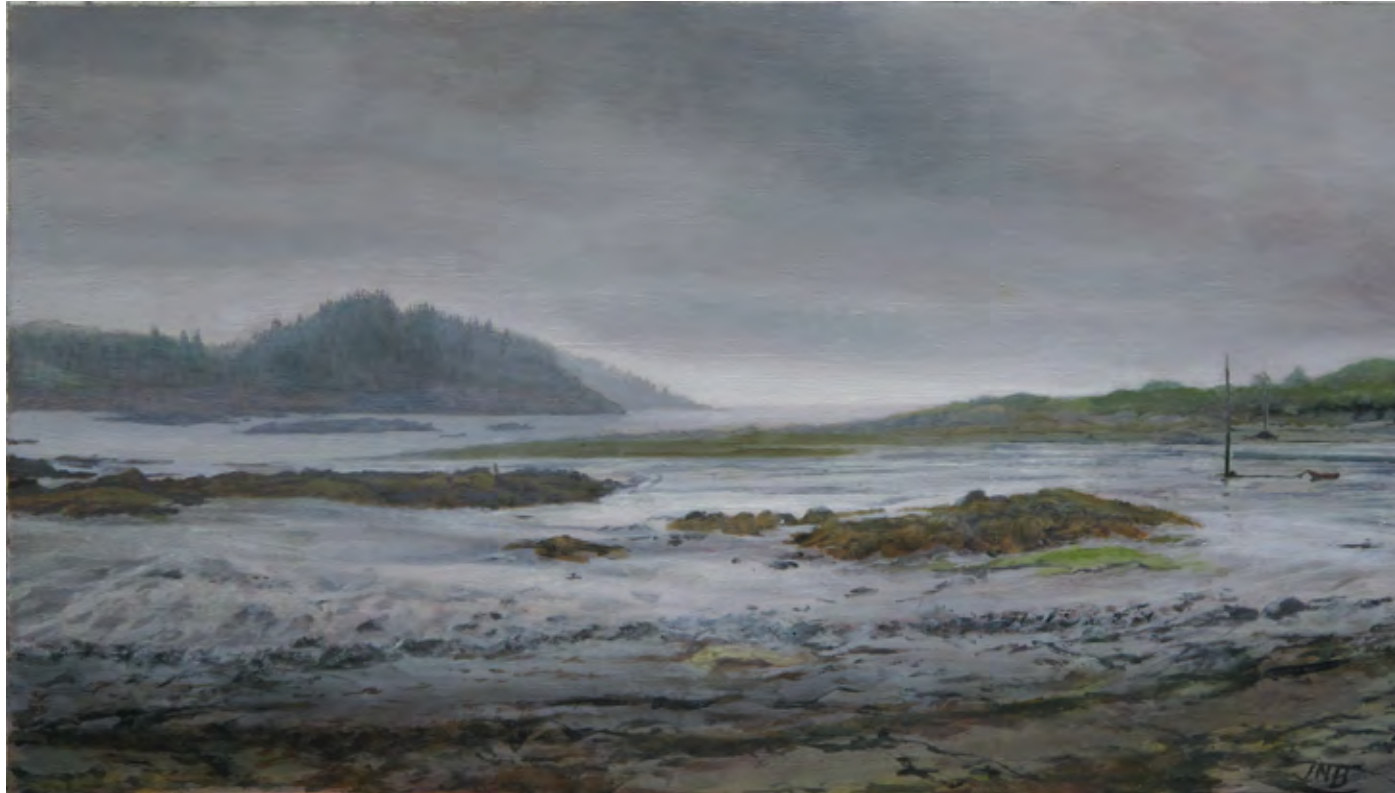
Downeast Low Tide , 2013, oil on panel, 10 x 18 inches