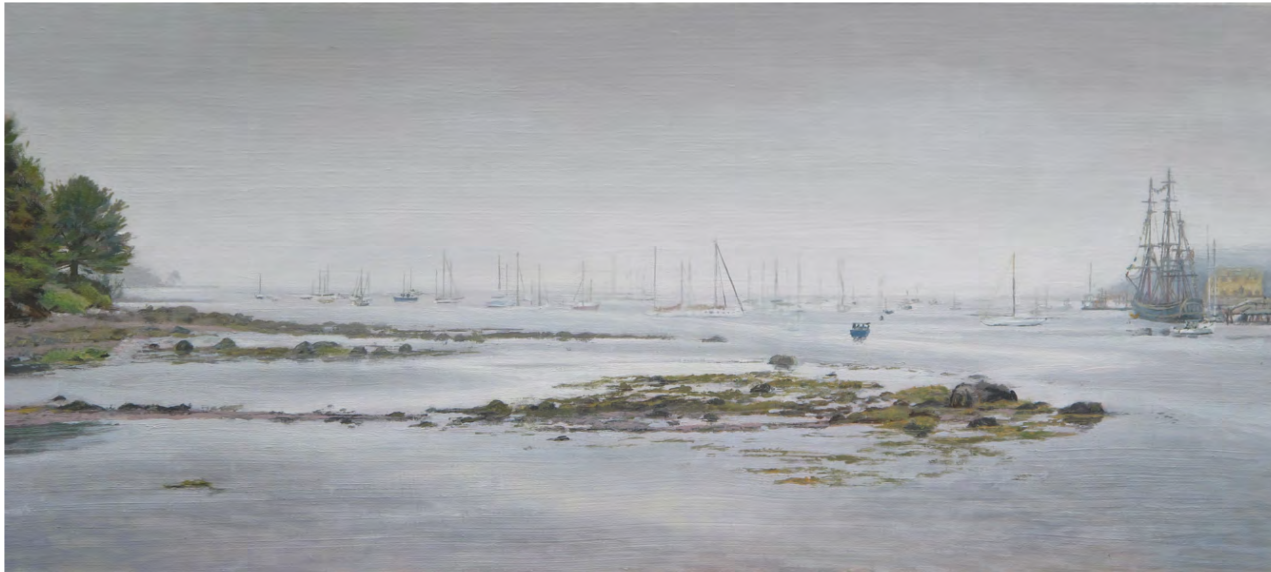
Fog Bound Bay 2013 oil on panel 8.5 x 19 inches