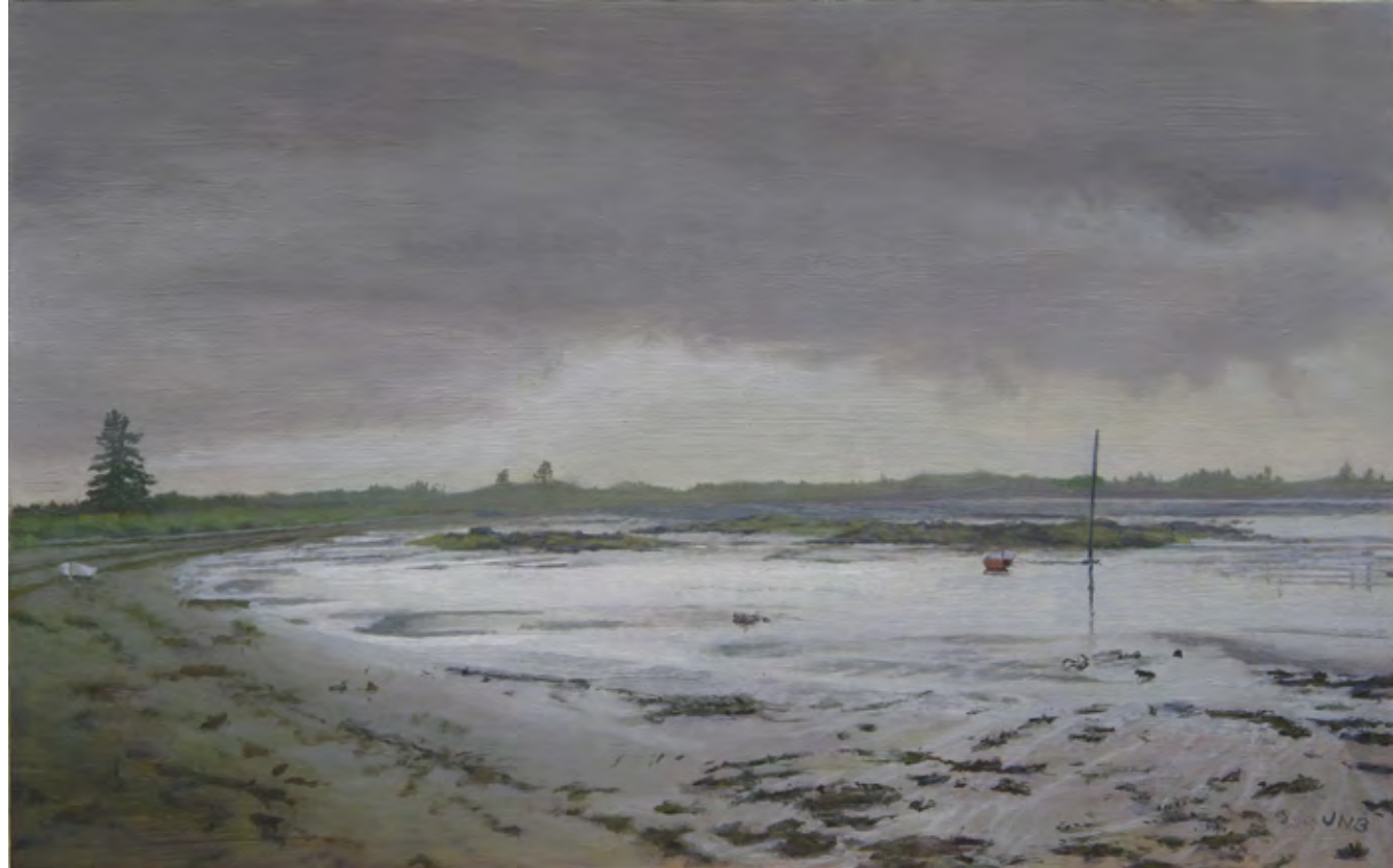
Downeast Dusk , 2013, oil on panel, 10 x 16 inches