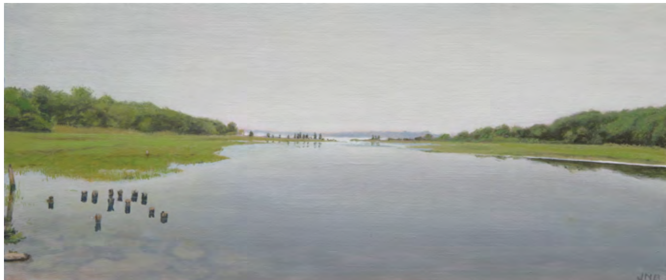
Still Marsh , 2013, oil on panel, 6 x 15 inches