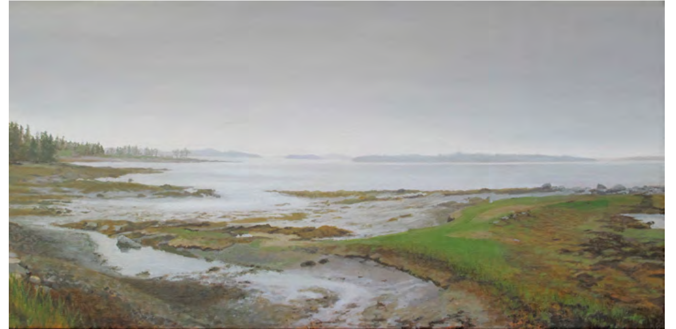
Mt. Desert Bay , 2012, oil on canvas, 16 x 32 inches