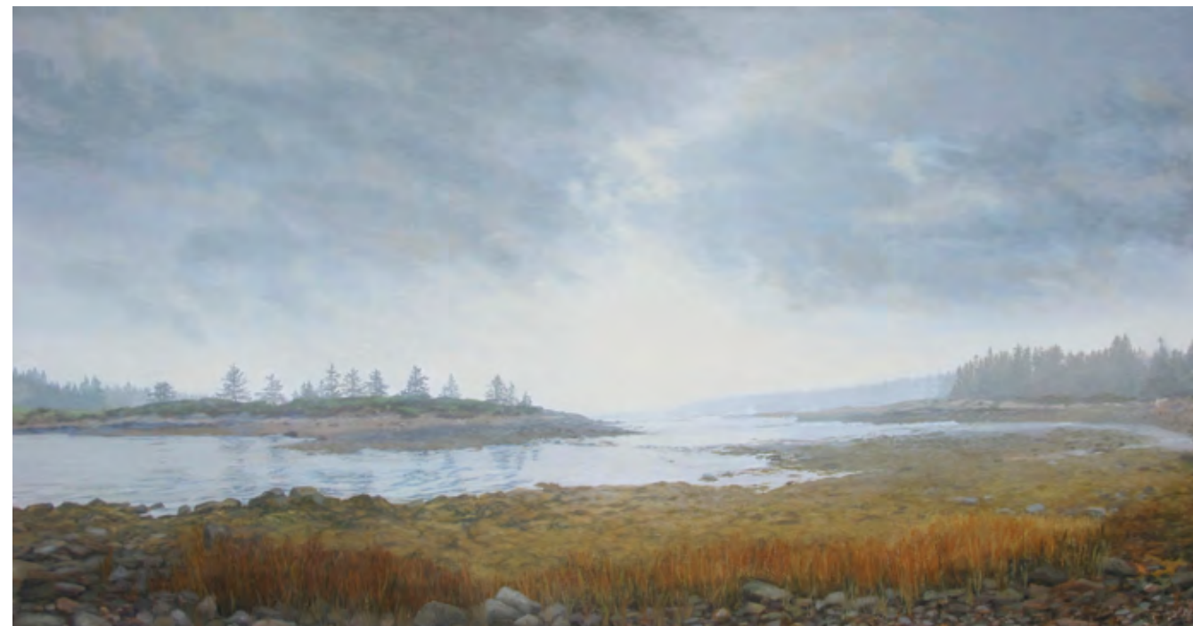
Schoodic Autumn , 2012, oil on canvas, 24 x 45 inches