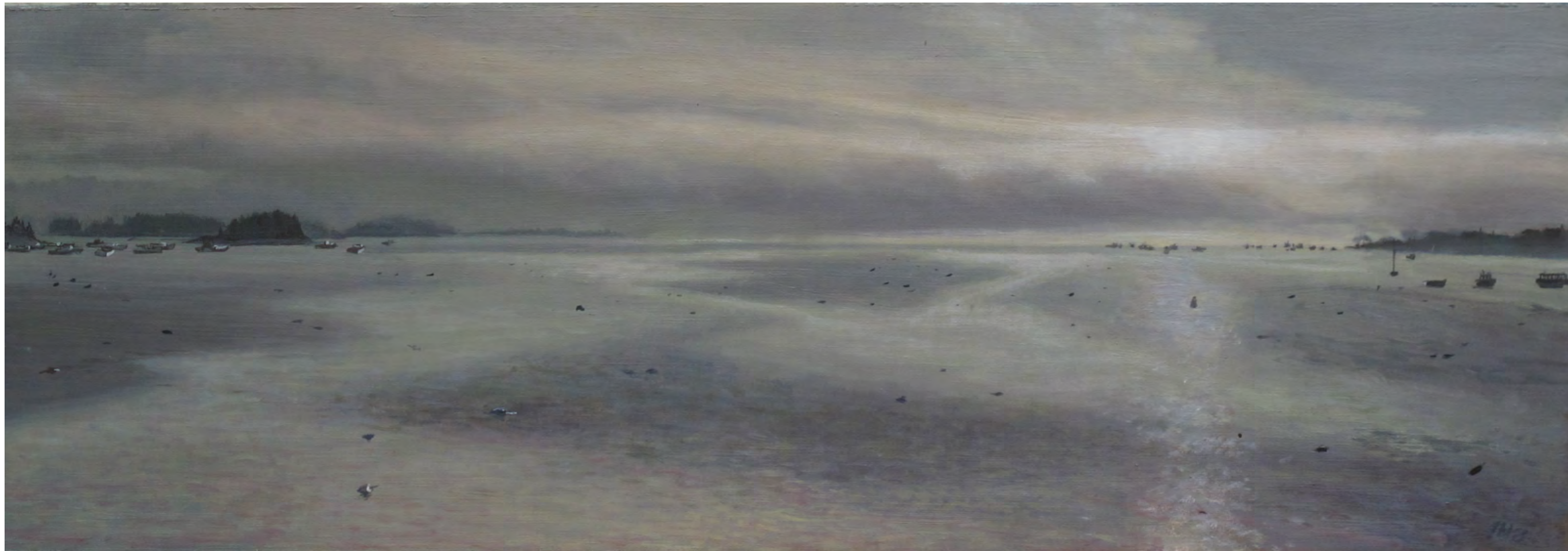
Downeast Bay , 2013, oil on panel, 8 x 22.5 inches