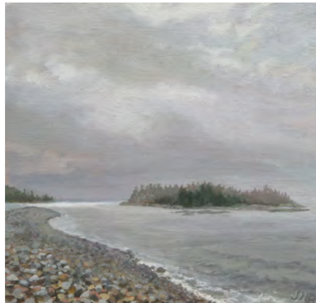
Schoodic Note 2013 oil on panel 6.5 x 7 inches