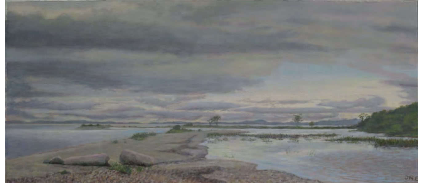
Estuary , 2013, oil on panel, 10 x 22.5 inches