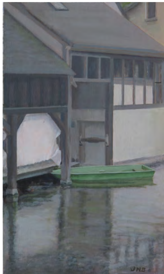
Chartes, 2013, oil on panel, 12 x 7 inches