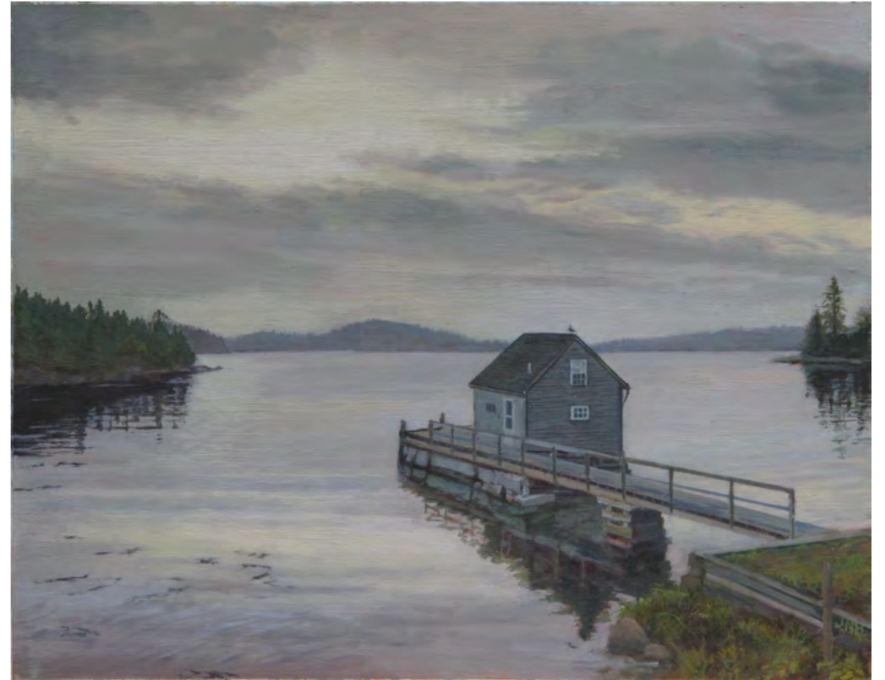
Boathouse , 2013, oil on panel, 10.5 x 12.5 inches