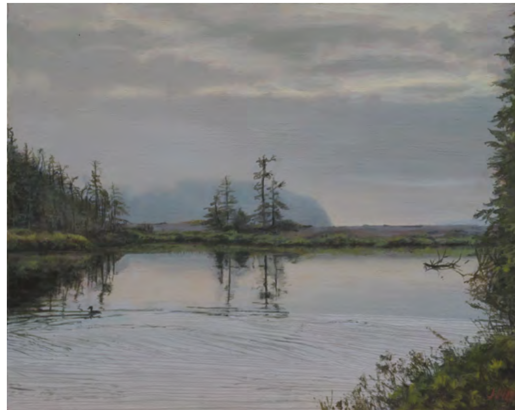
Early Morning , 2013, oil on panel, 5 x 11 inches