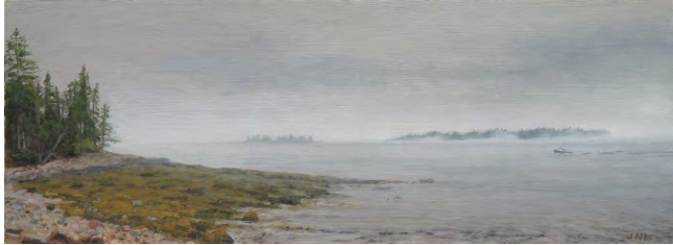
Return III , 2013, oil on panel, 6 x 16 inches