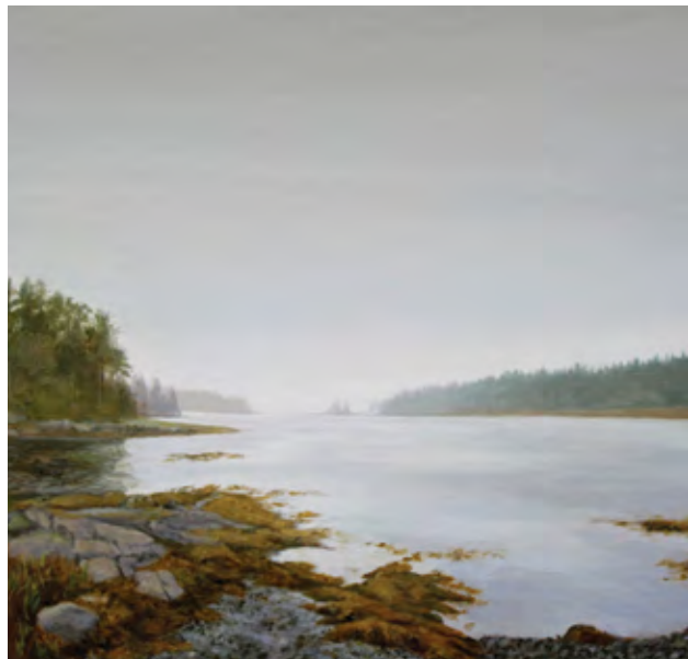
Downeast Coast 2012 oil on panel 12.5 x 14 inches