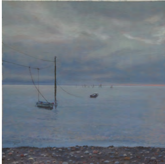
Sunrise, 2013, oil on panel, 10 x 10 inches