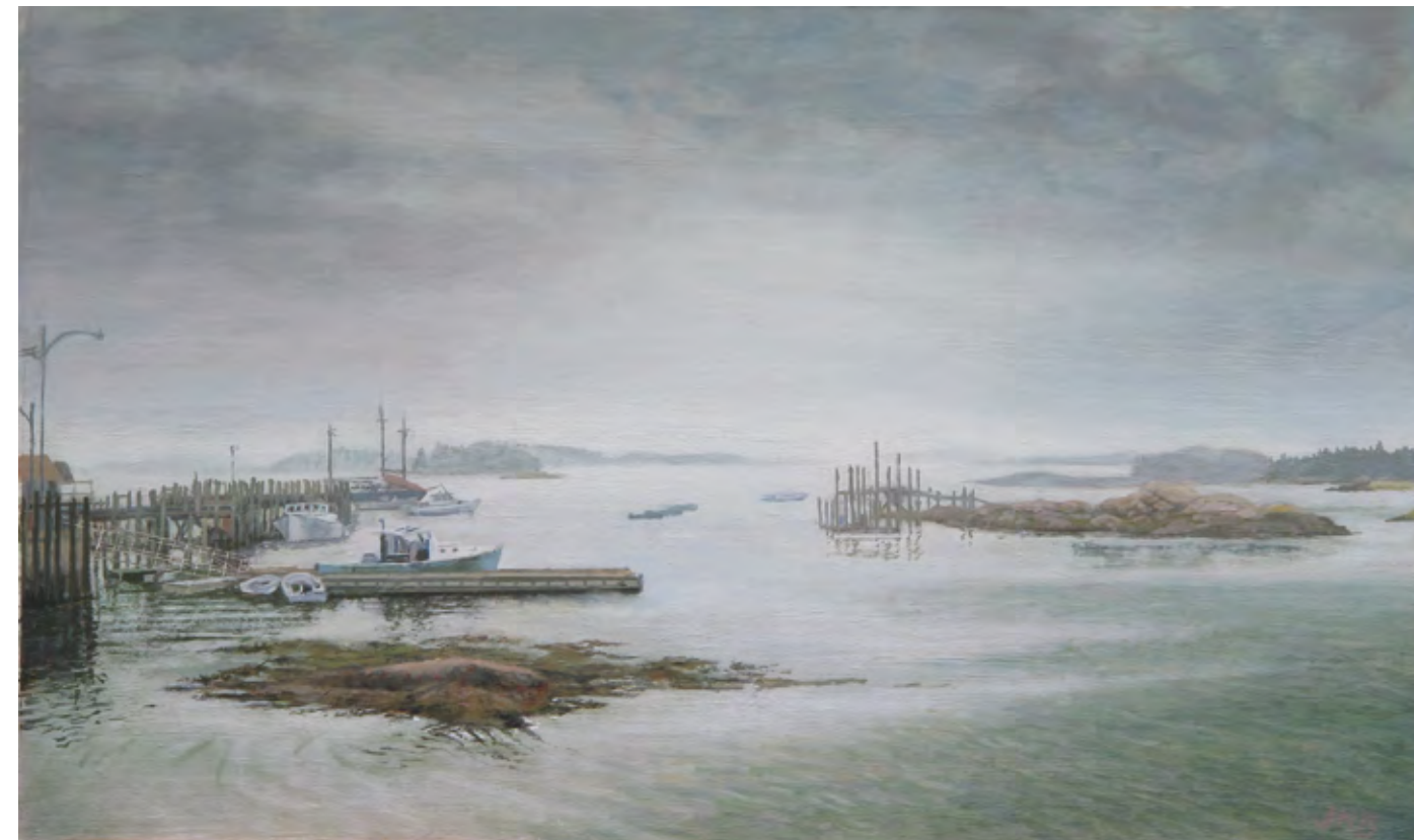
Deer Isle Harbor, 2013, oil on panel, 10.5 x 17 inches