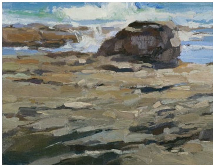
Surf Rock oil on linen 11 x 14 inches 2011