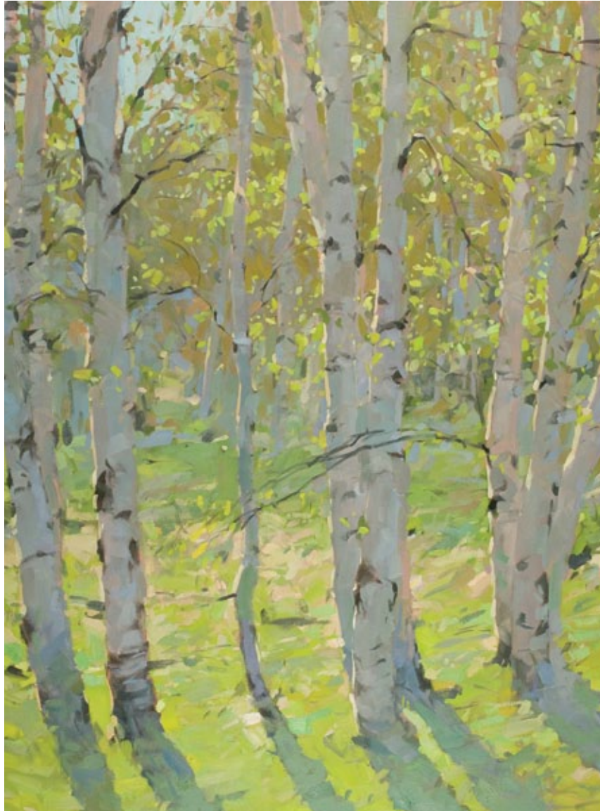
A Fence of Birches oil on canvas 40 x 30 inches 2011