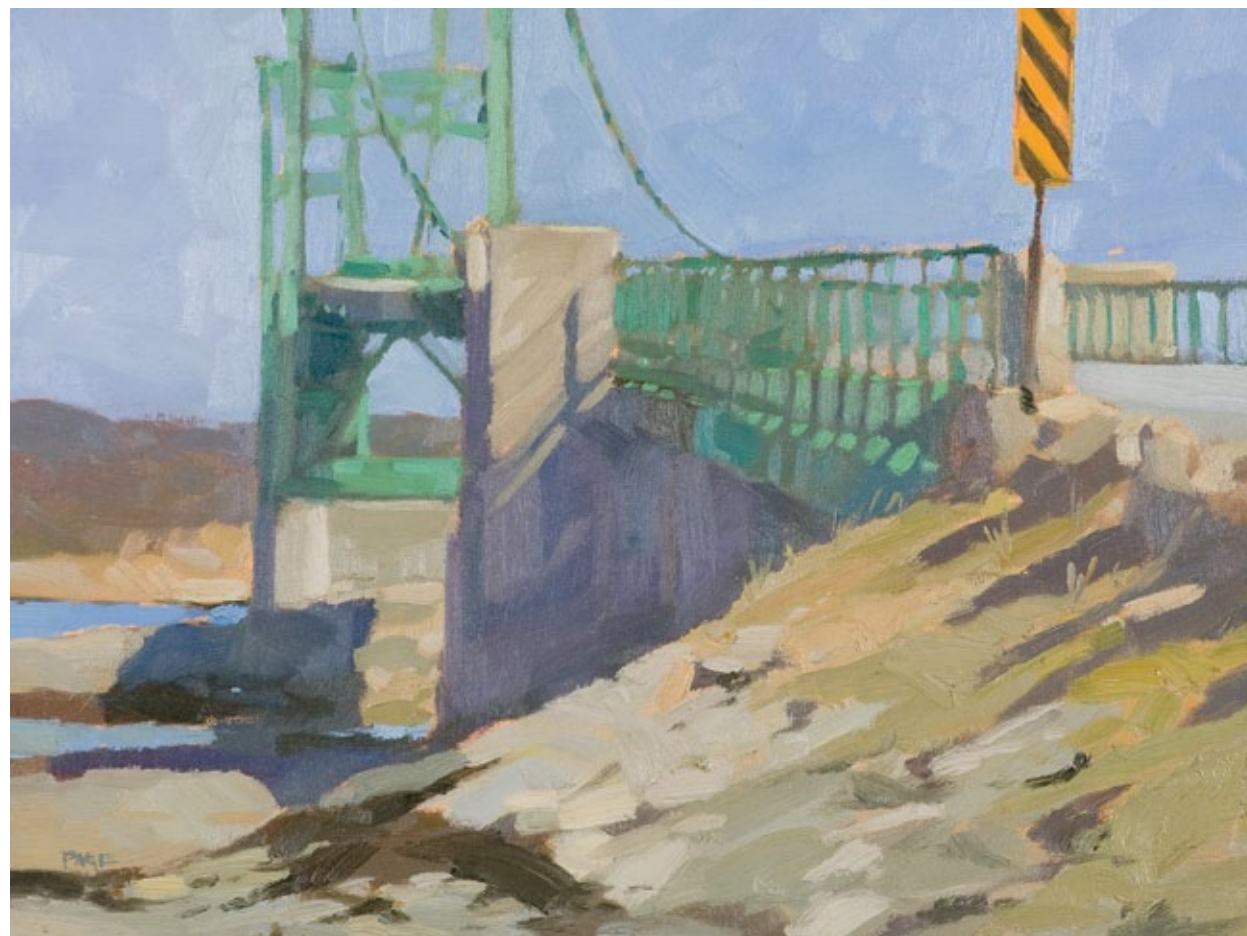
Bridge to Deer Isle , oil on canvas, 12 x 16 inches, 2011