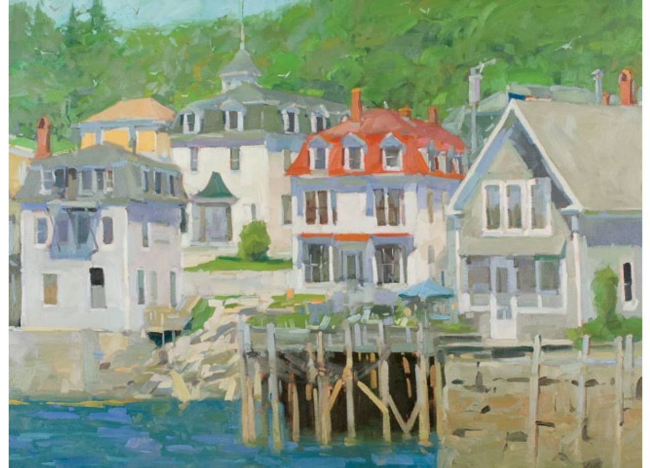
Waterfront Windows , oil on canvas, 30 x 40 inches, 2011