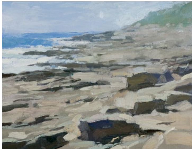
Ocean's Edge oil on linen 11 x 14 inches 2011