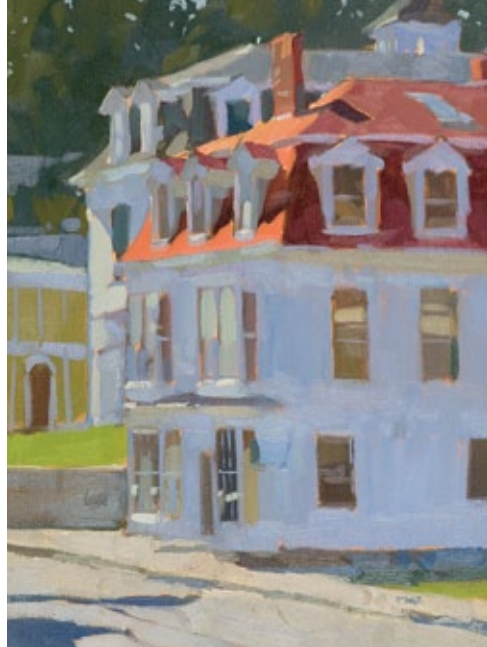
Stonington Mansards , oil on canvas, 16 x 12 inches, 2011

It is easy to look at a Colin Page painting with an assumption that its freshness results from just another joyous day in the life of an artist. You might even picture Colin singing or whistling at his easel. But often what seems to be a painter's most spontaneous work hides layers of struggle. These hidden layers can be actual paint: applied, removed, re-applied and tested again to attain the best balance of warm-cool, thick-thin, large-small, bright-neutral, reworked in pursuit of an intuitive sense that the artist "got it just right." These efforts can also reflect other choices: selecting a day with the right light and weather and a location with an interesting subject, the right amount of shade, and an absence of glare; having at hand the right kinds of brushes and paints, enough insect spray and sun screen; adjusting layers of clothes as the day progresses; and allocating time before the light changes to accomplish what the artist set out to do. Yes, there are days when a canvas almost seems to paint itself, but usually, sustained focus and effort out-weigh ease and comfort. Colin only makes it look easy.