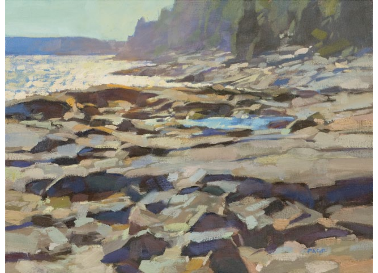
Schoodic Rocks , oil on canvas, 12 x 16 inches, 2011

It is easy to look at a Colin Page painting with an assumption that its freshness results from just another joyous day in the life of an artist. You might even picture Colin singing or whistling at his easel. But often what seems to be a painter's most spontaneous work hides layers of struggle. These hidden layers can be actual paint: applied, removed, re-applied and tested again to attain the best balance of warm-cool, thick-thin, large-small, bright-neutral, reworked in pursuit of an intuitive sense that the artist "got it just right." These efforts can also reflect other choices: selecting a day with the right light and weather and a location with an interesting subject, the right amount of shade, and an absence of glare; having at hand the right kinds of brushes and paints, enough insect spray and sun screen; adjusting layers of clothes as the day progresses; and allocating time before the light changes to accomplish what the artist set out to do. Yes, there are days when a canvas almost seems to paint itself, but usually, sustained focus and effort out-weigh ease and comfort. Colin only makes it look easy.