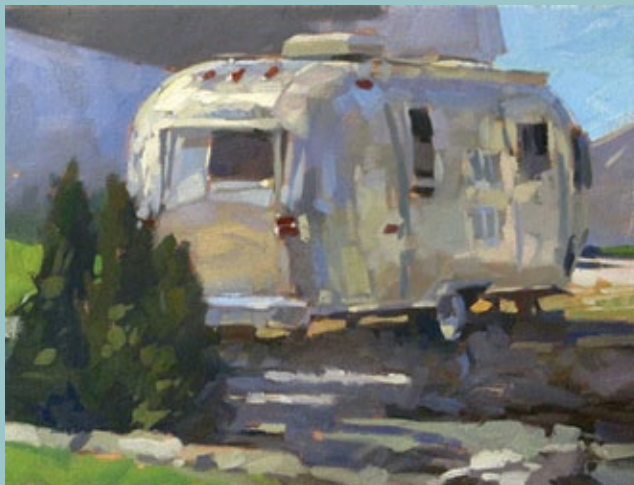
Airstream , oil on canvas, 12 x 16 inches, 2011