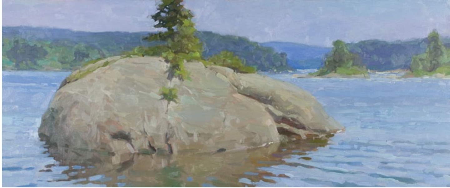
Swim Rock , oil on canvas, 20 x 48 inches, 2011