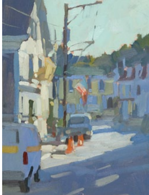
Arrival of Evening , oil on canvas, 16 x 12 inches, 2011

Colin makes art directly from his perceptions and intelligent forethought. He can land paint with confidence, such as nailing the weight of a rock, the sparkle of water, the glow of light on a building. He articulately “speaks” the painter’s language of color and form to convey what he sees, and adapts to a wide range of geography and subject with nimble agility. But he is much more than facile. Increasingly, Colin’s paintings are planned, improvised, layered, nuanced, and sometimes, deliberately restrained. Red may seem especially hot, or blue especially pulsing, but the foil for their glow develops from the complexity of his neutral grays and ochers that makes the full chroma of his colors come alive. He refreshingly takes contrived heaviness out of painting, but not the substance and solidity translated from the world around him.