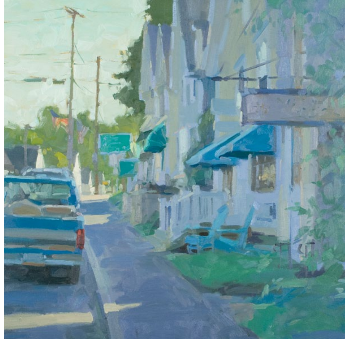
Blue Hill's Blue Shadows oil on canvas 24 x 24 inches 2011