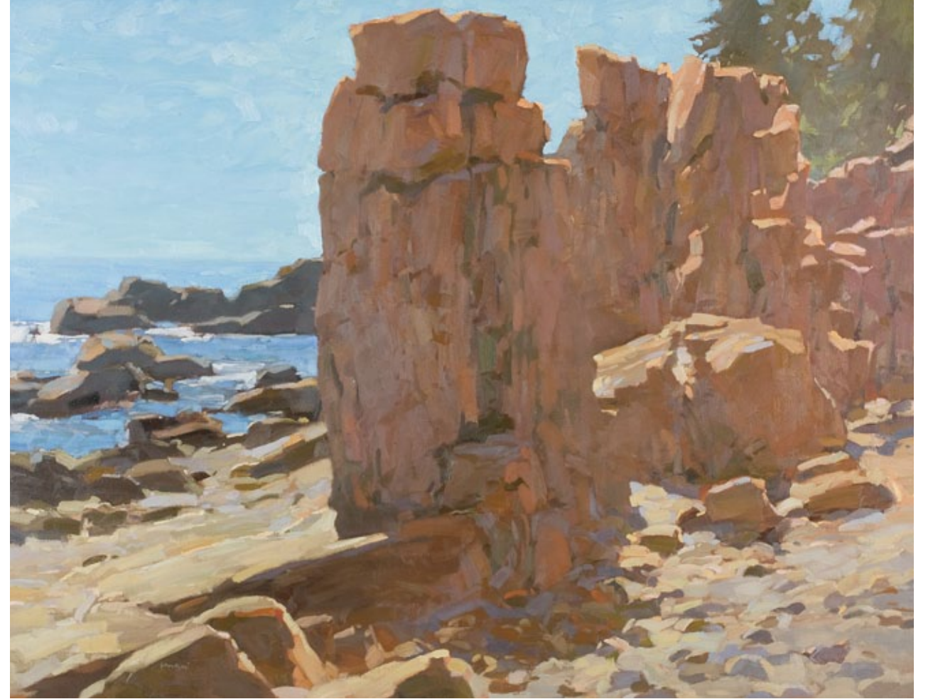
Acadia's Rocks , oil on canvas, 28 x 36 inches, 2011