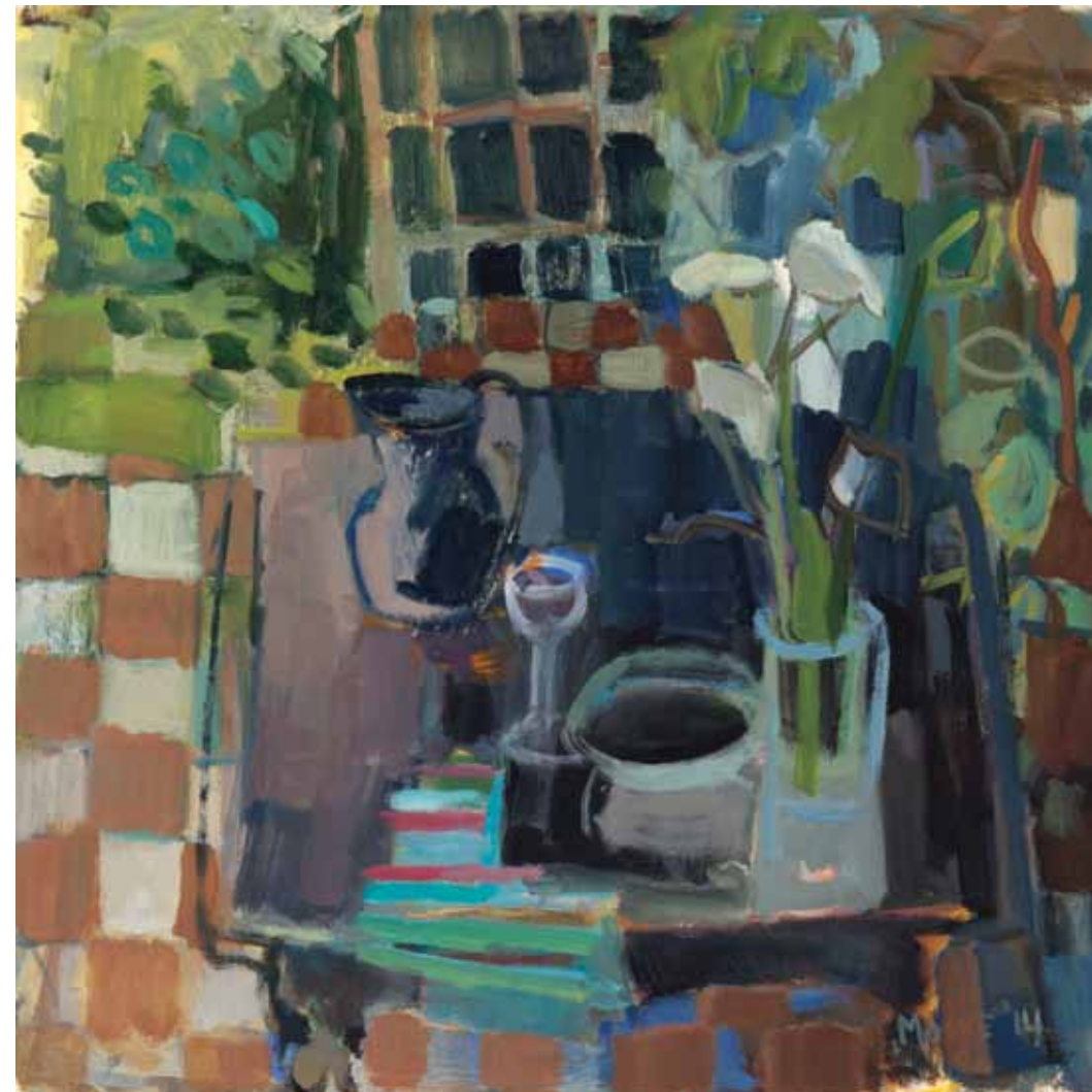
La Mesa Negra , oil on paper, 29 x 29 inches