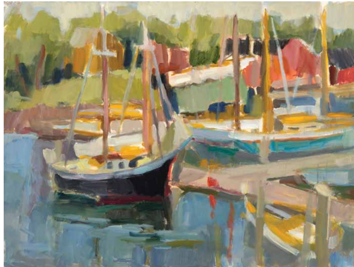
Black Beauty , oil on paper, 22 x 30 inches