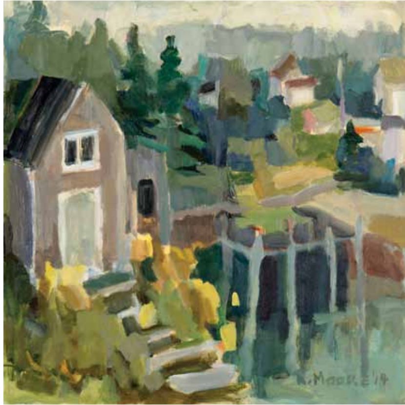
Quiet , oil on board, 20 x 20 inches