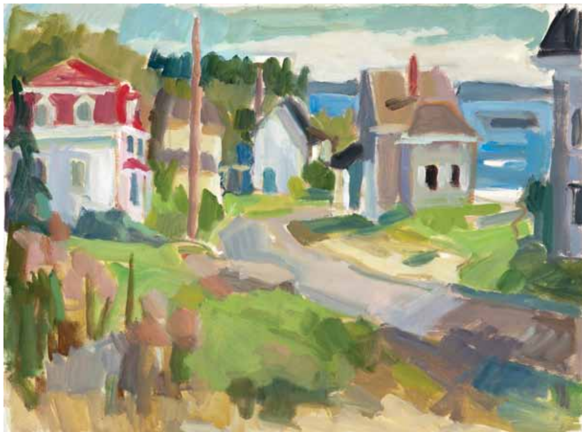
Bend in the Road , oil on paper, 22 x 30 inches