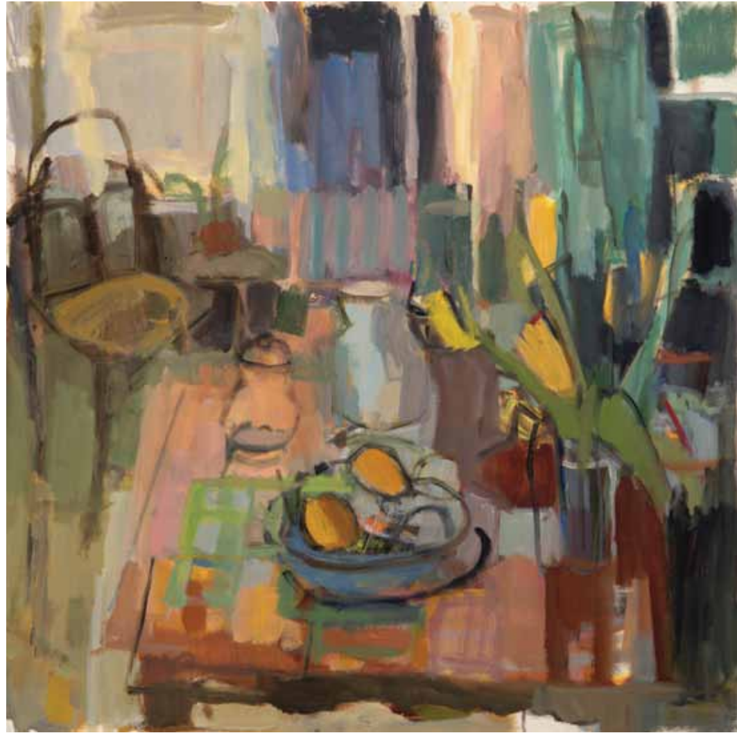
Pink Interior , oil on paper, 29 x 29 inches