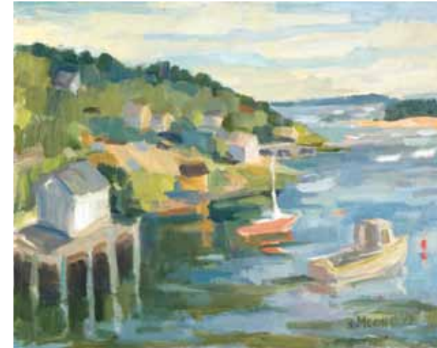
View with Red Boat , oil on canvas, 30 x 24 inches