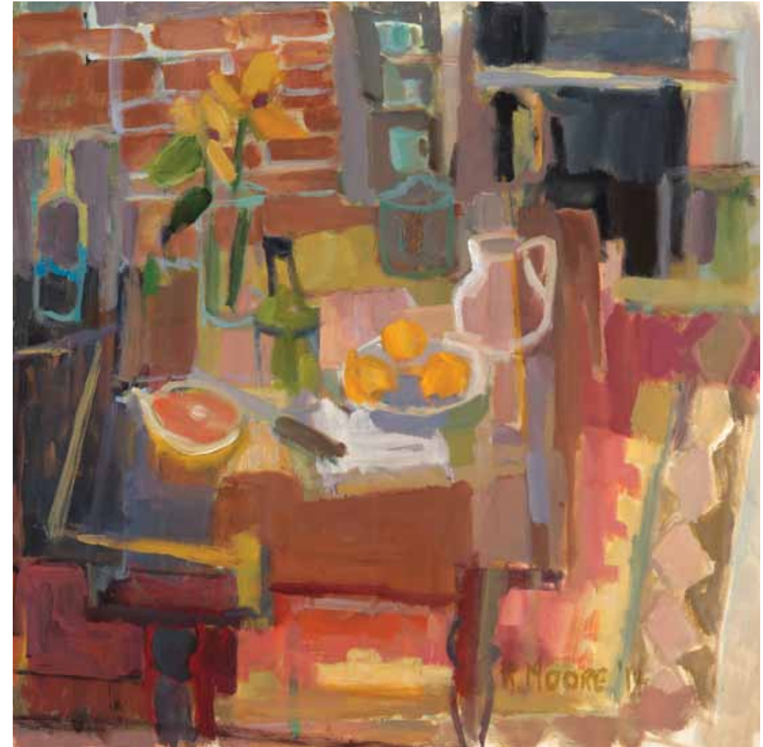
Cubist Kitchen Table , oil on paper, 29 x 29 inches

Inspired by her time spent in Maine and Mexico, Moore's vibrant colors sing to us, engendering even