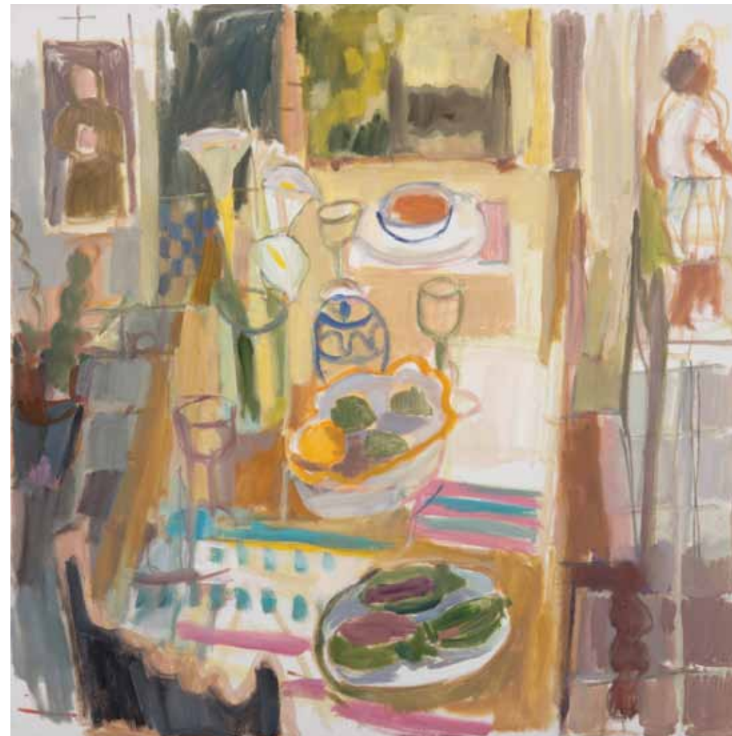
La Comida , oil on canvas, 31 x 31 inches