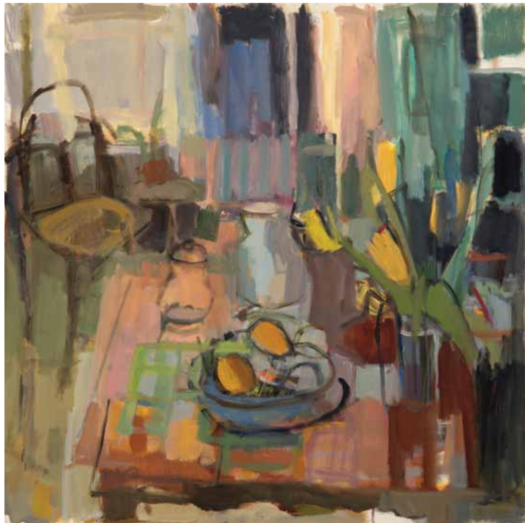
Pink Interior , oil on paper, 29 x 29 inches