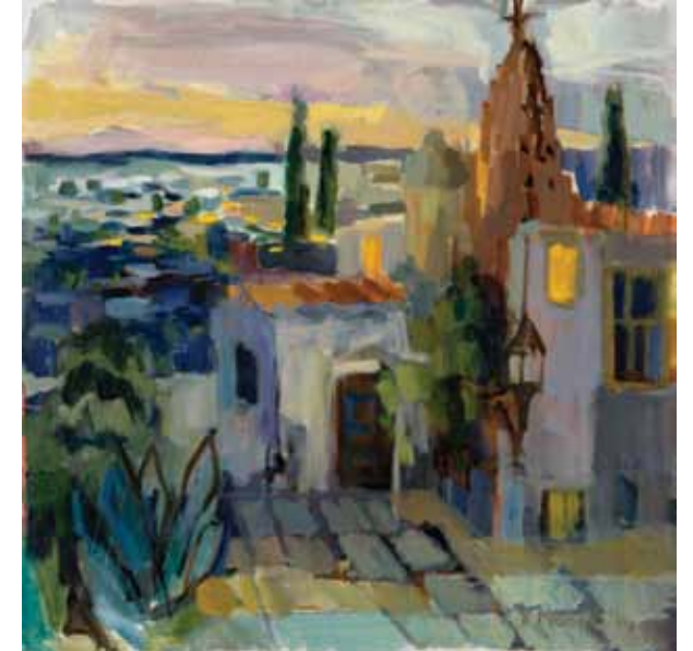
La Noche , oil on canvas, 31 x 31 inches