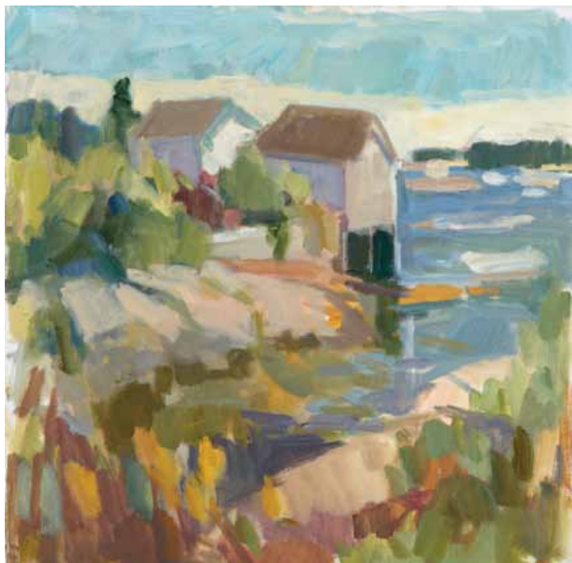
Inlet , oil on canvas, 24 x 24 inches