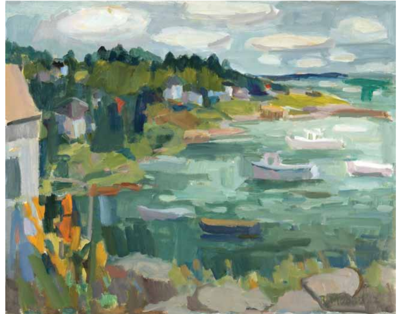
Green Sea , oil on canvas, 30 x 24 inches