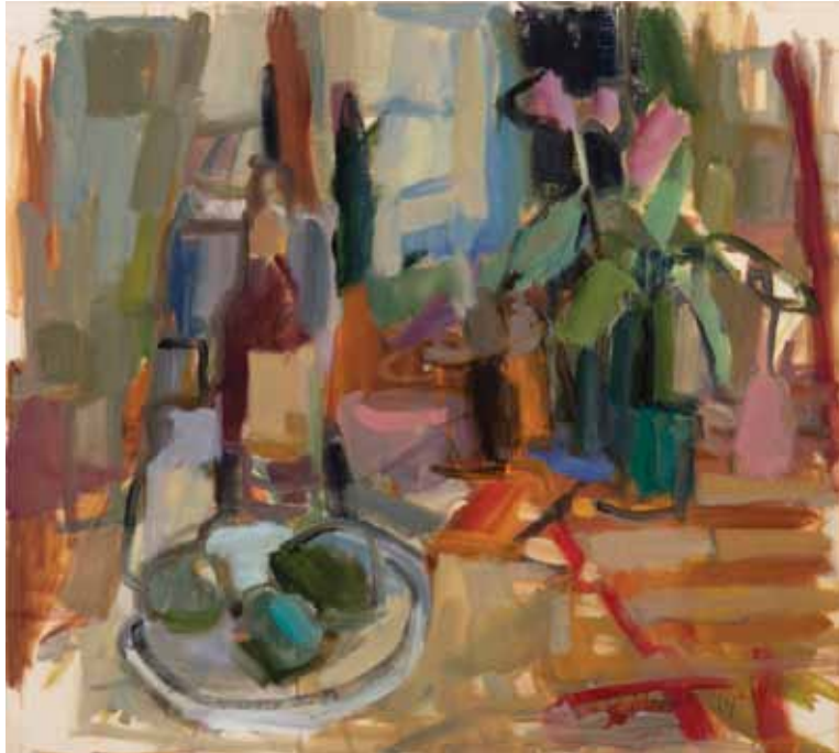
Still Life , oil on paper, 23 x 21 inches