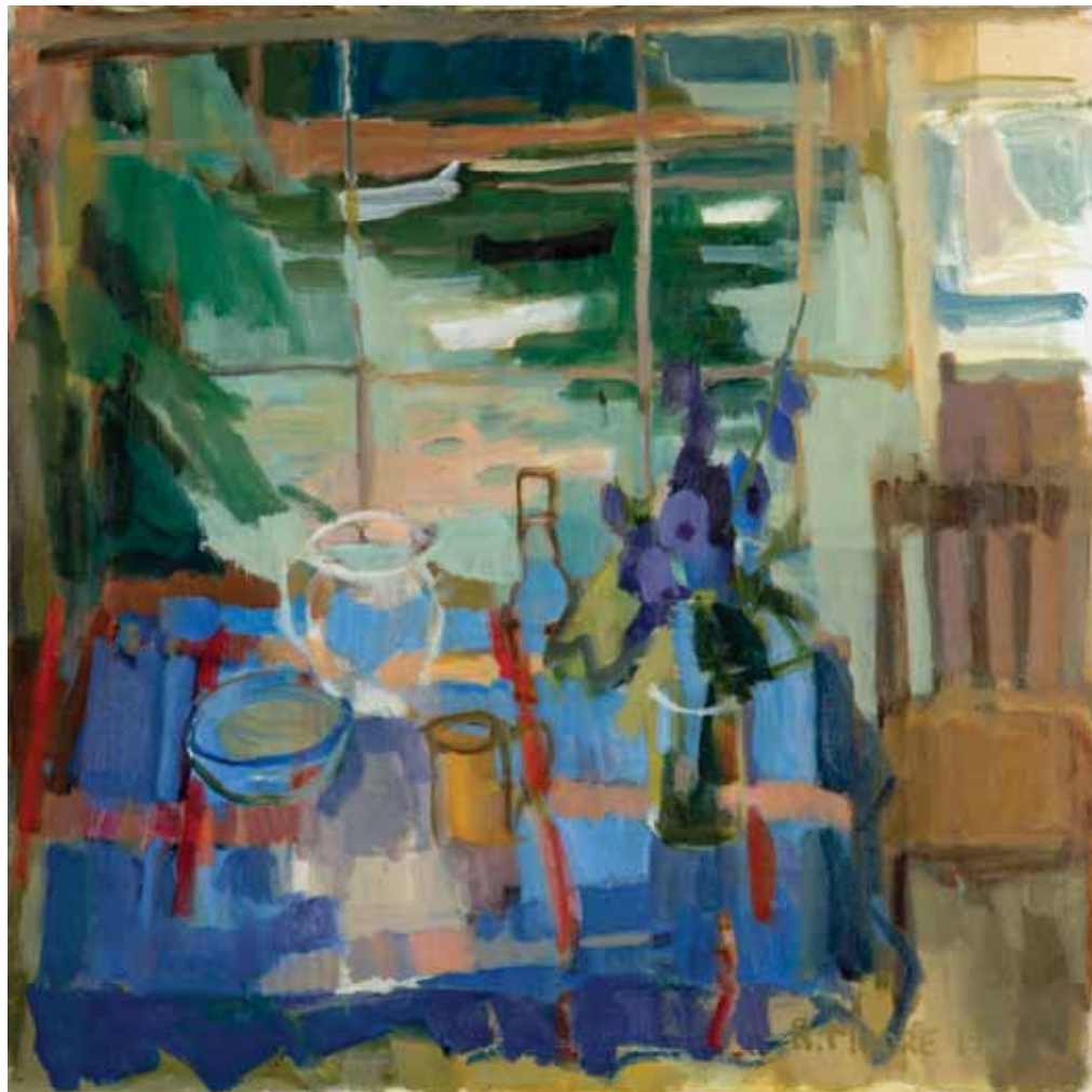
Blue View , oil on canvas, 30 x 30 inches