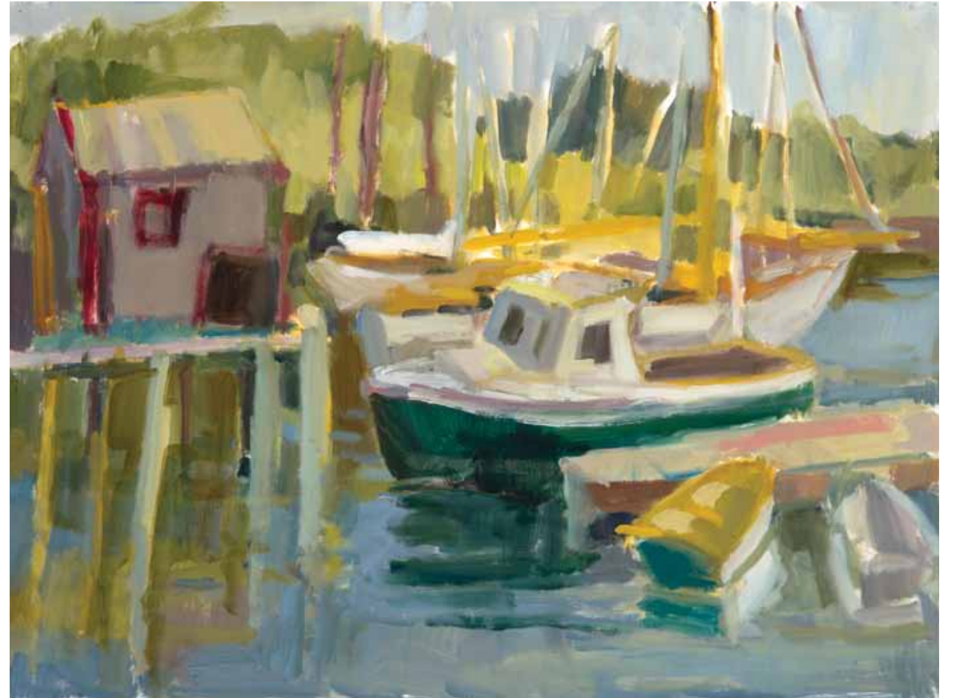
Snugged In , oil on paper, 22 x 30 inches