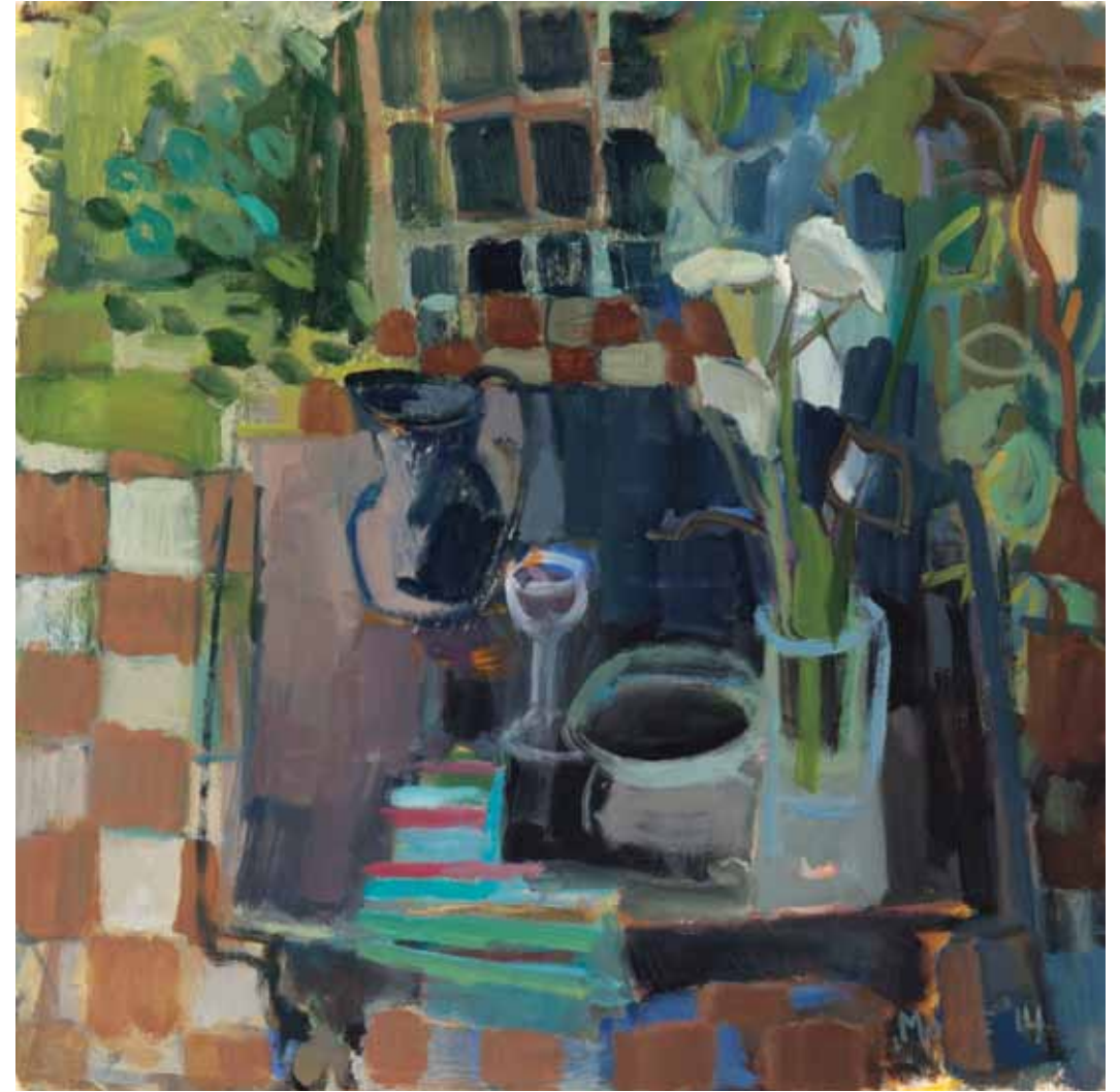
La Mesa Negra , oil on paper, 29 x 29 inches