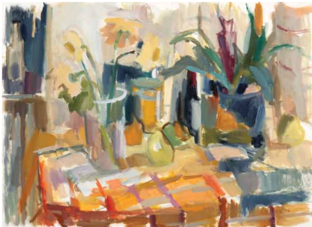
Still Life with Orange Cloth, oil on paper, 22 x 30 inches