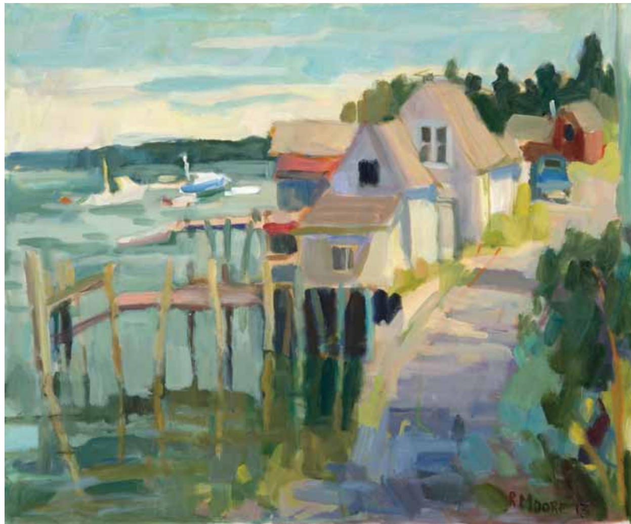
Lobster Sheds, oil on canvas, 30 x 36 inches