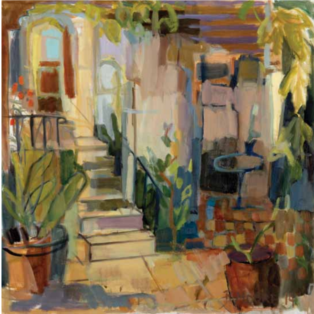
Complications of Mexican Space , oil on canvas, 31 x 31 inches

more the illusion of something happening in the Now. And the carefully composed shapes are given life by the unexpected: the almost spectral white pitcher that seems to float above the table, the touch of orange on a goblet, the portrait beneath a cross. Complications of space indeed. For when else can the unexpected surprise us but in the moment we confront the canvas?