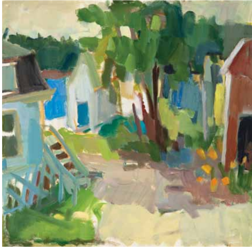
Back Steps , oil on paper, 22.5 x 22.5 inches