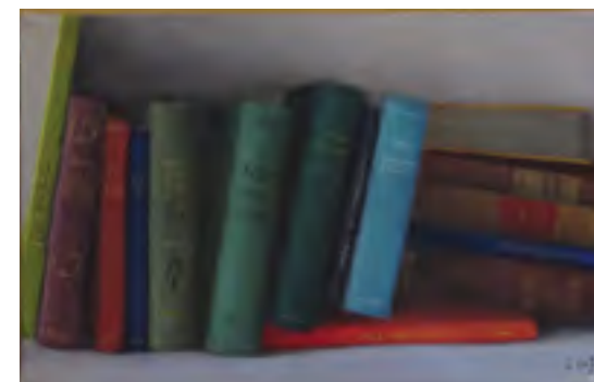
Old Books , oil on canvas, 9 x 14 inches