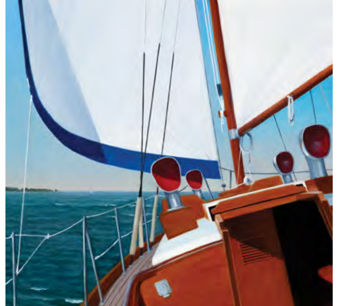
Wing and Wing , oil on canvas, 28 x 30 inches

NEXT PAGE September , oil on canvas, 20 x 50 inches