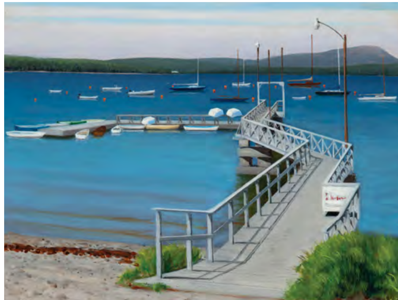
Hancock Landing , oil on canvas, 16 x 21 inches