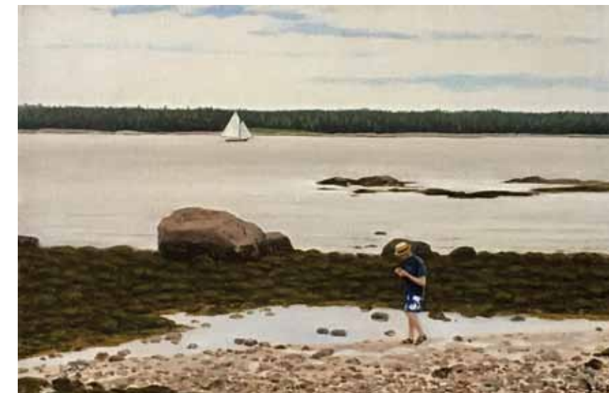
Low Tide , oil on canvas, 12 x 18 inches