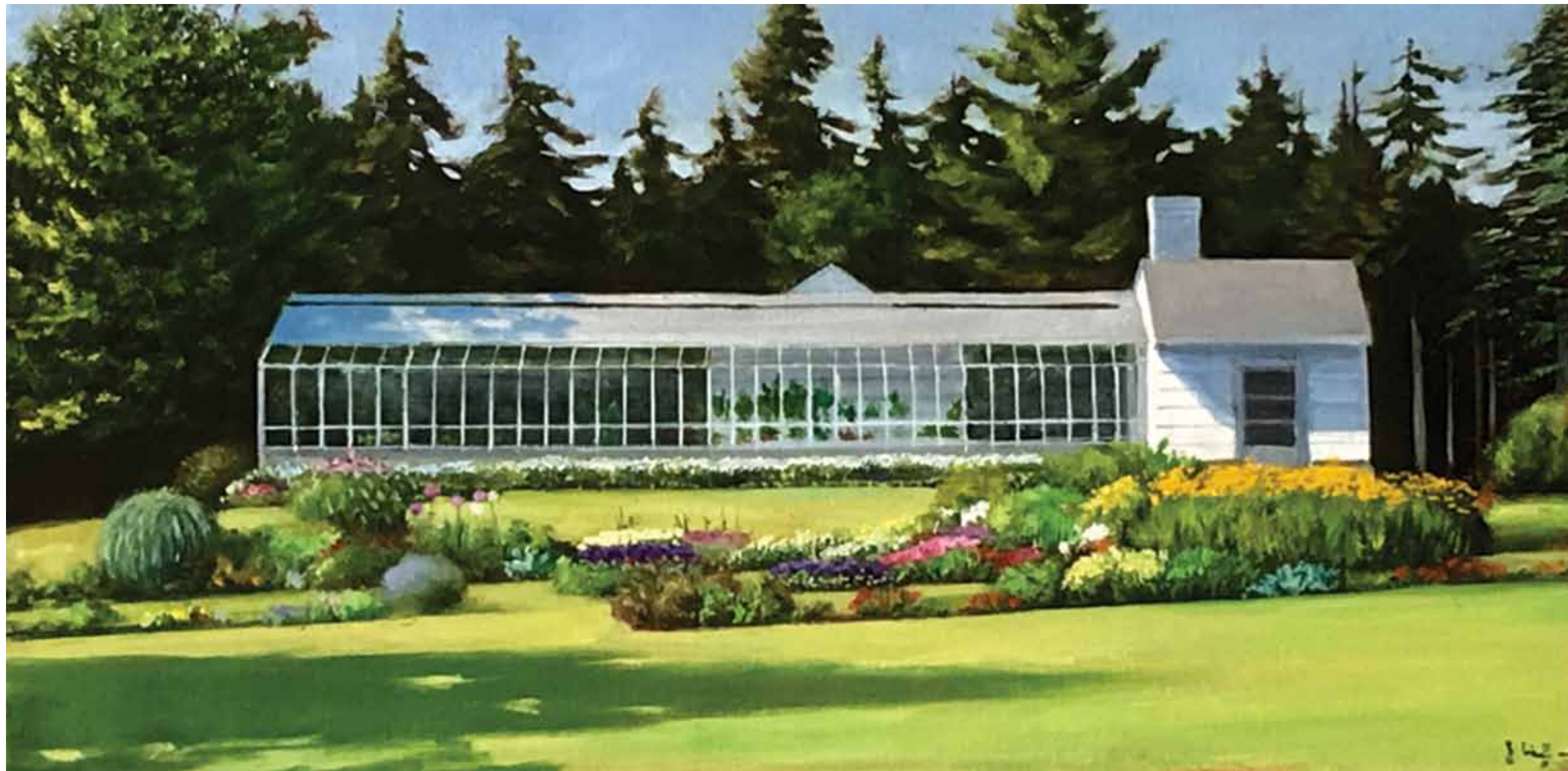
Garden Greenhouse oil on canvas 12 x 24 inches