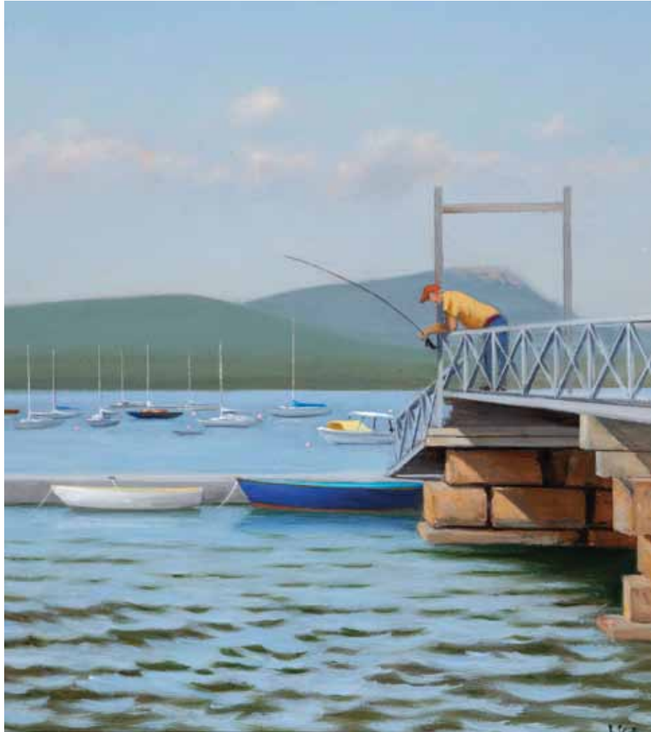
Fishing, Hancock Point oil on canvas 18 x 16 inches