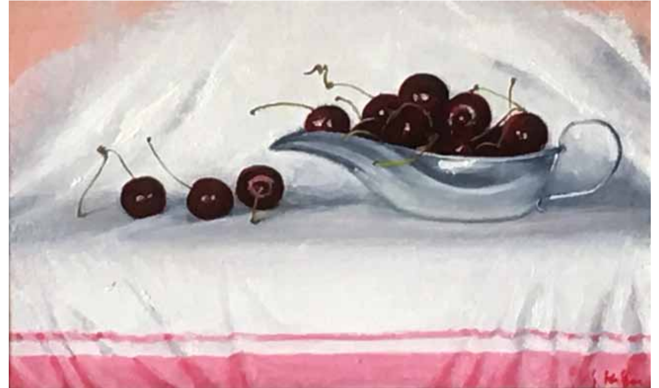
Cherries in a Cruel Cup , oil on canvas, 7 x 12 inches