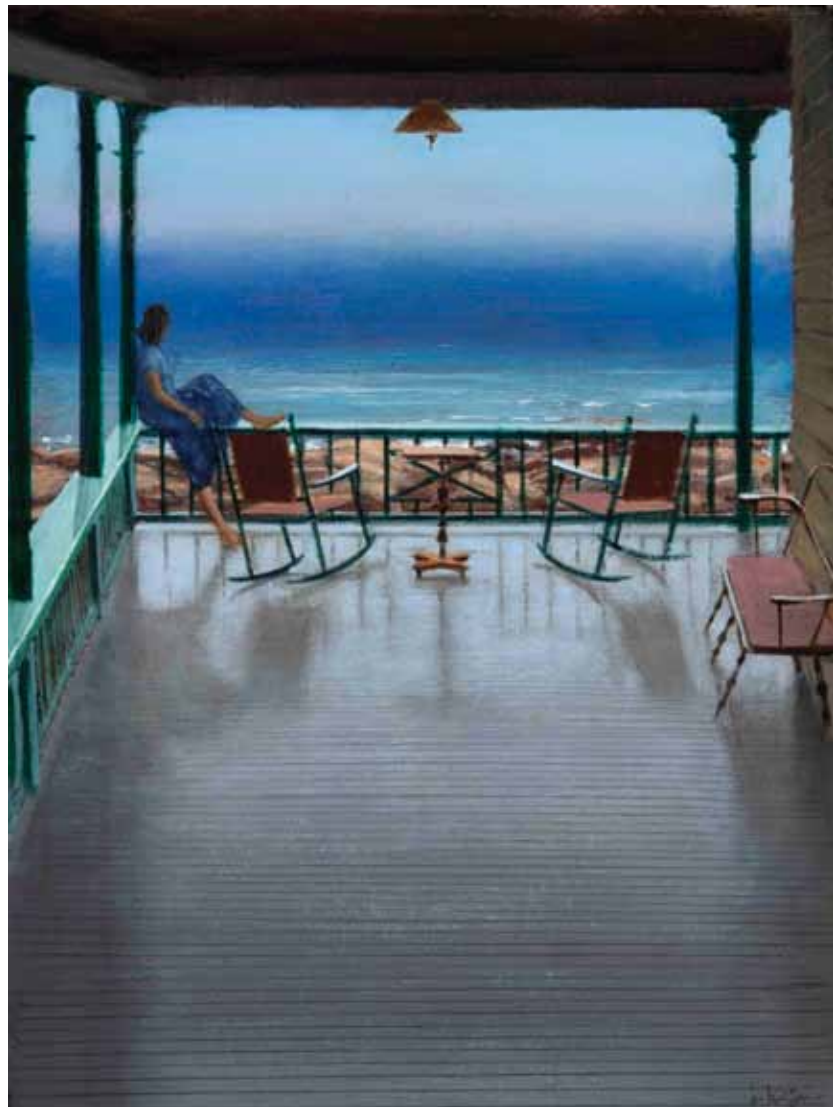
Contemplation oil on canvas 16 x 12 inches