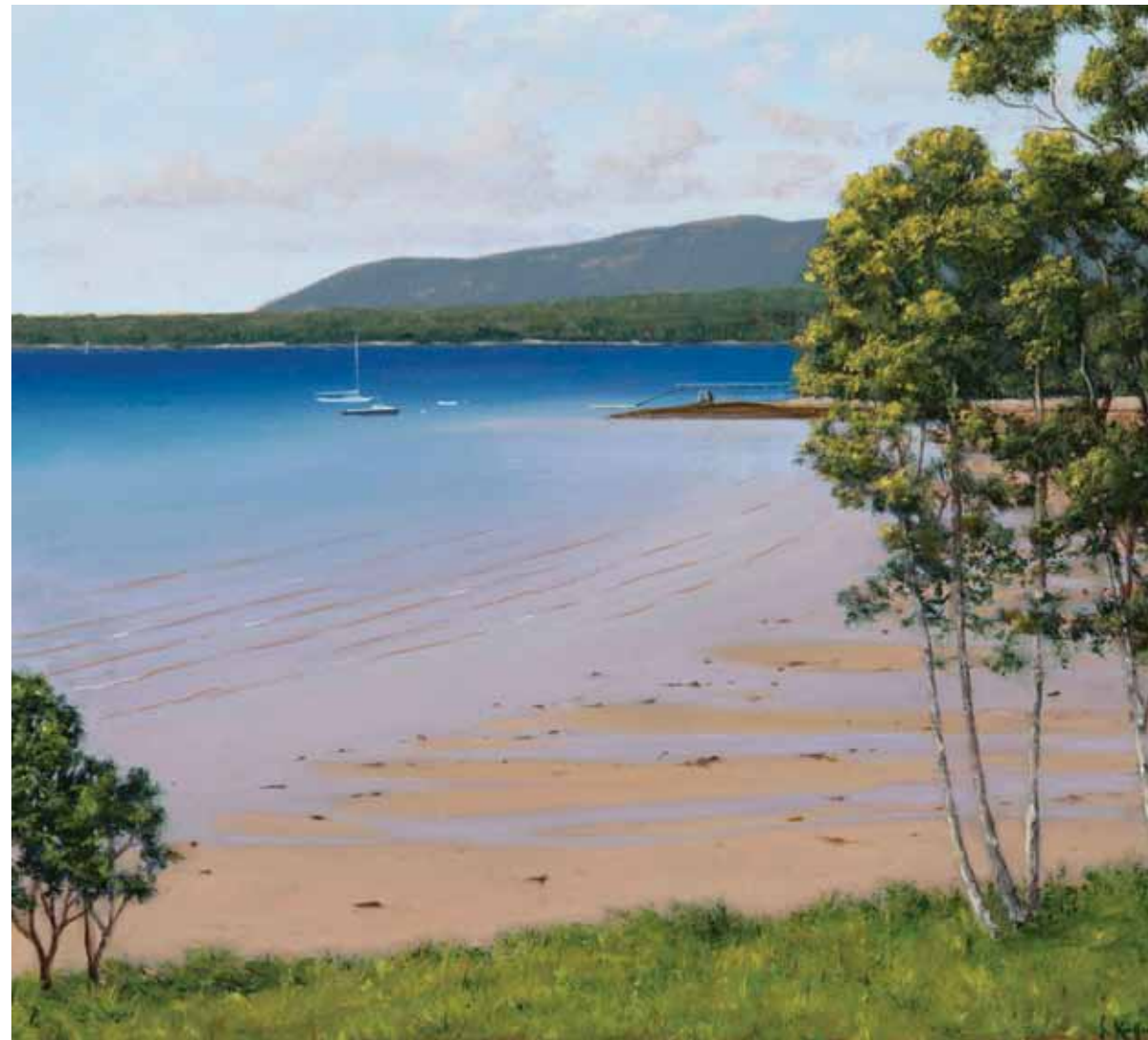
Trickling Tide , oil on canvas, 18 x 20 inches