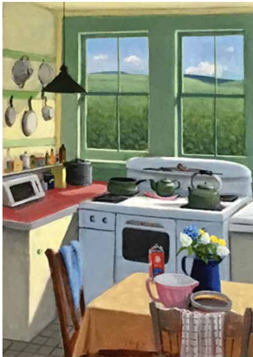
Summer Kitchen oil on canvas 17 x 12 inches