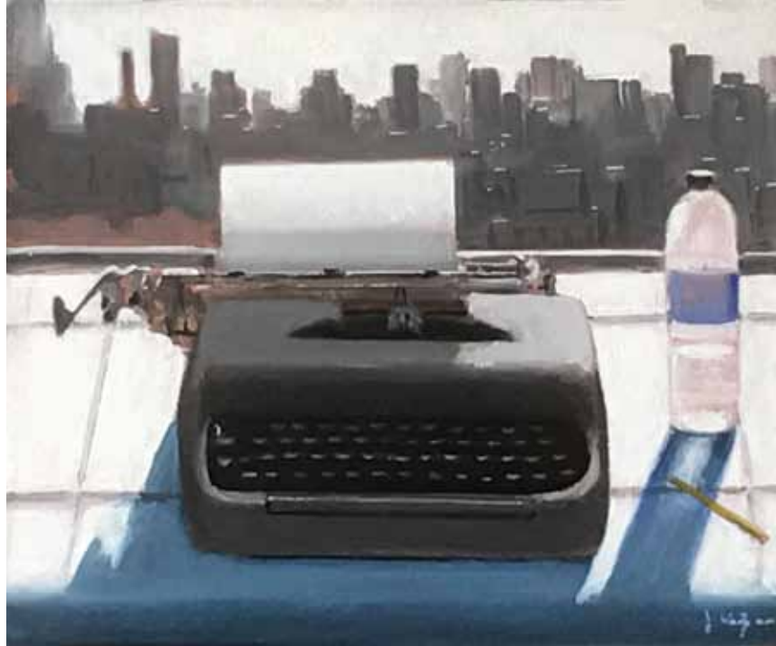
Typewriter, oil on canvas, 10 x 12 inches