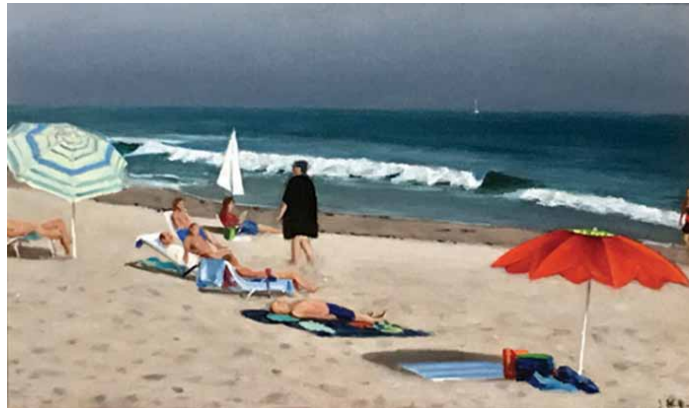
Beachcomber , oil on canvas, 12 x 20 inches