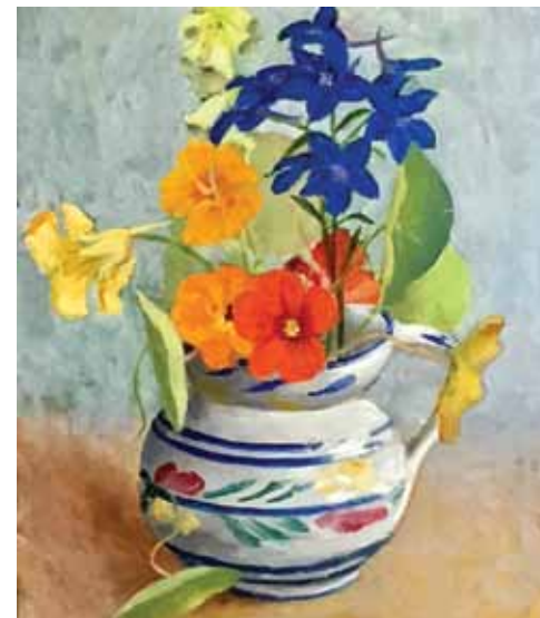
Summer Flowers , oil on panel, 9.75 x 8 inches

COVER Settling Into a Cloud Bank , detail, oil on canvas, 20 x 30 inches