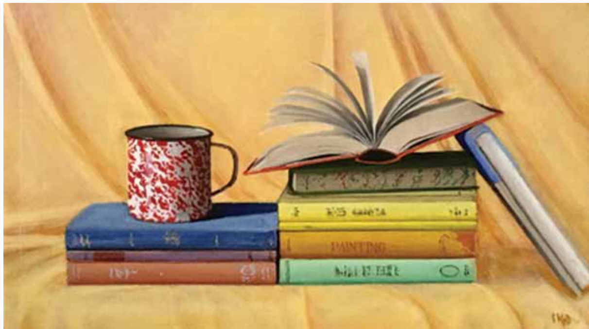
Old Books, oil on canvas, 12 x 21 inches