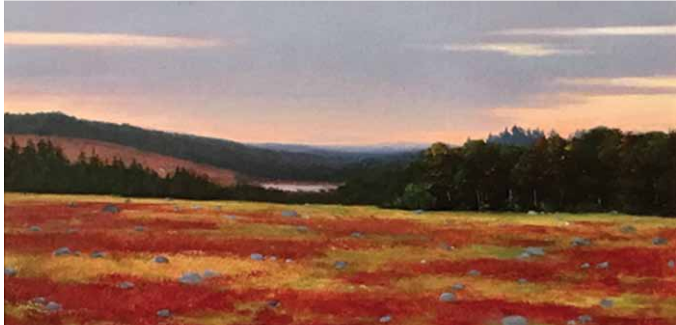
Blueberry Barren, Sedgwick, oil on panel, 10 x 20 inches