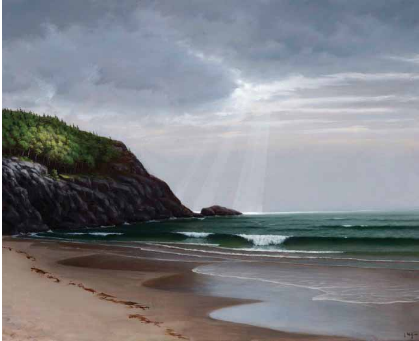
Great Head , oil on canvas, 26 x 32 inches