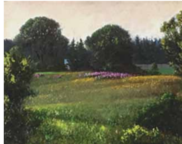
LEFT June Lupines oil on canvas 11 x 14 inches