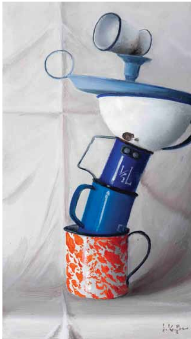
Topsy Cups oil on canvas 14 x 8 inches