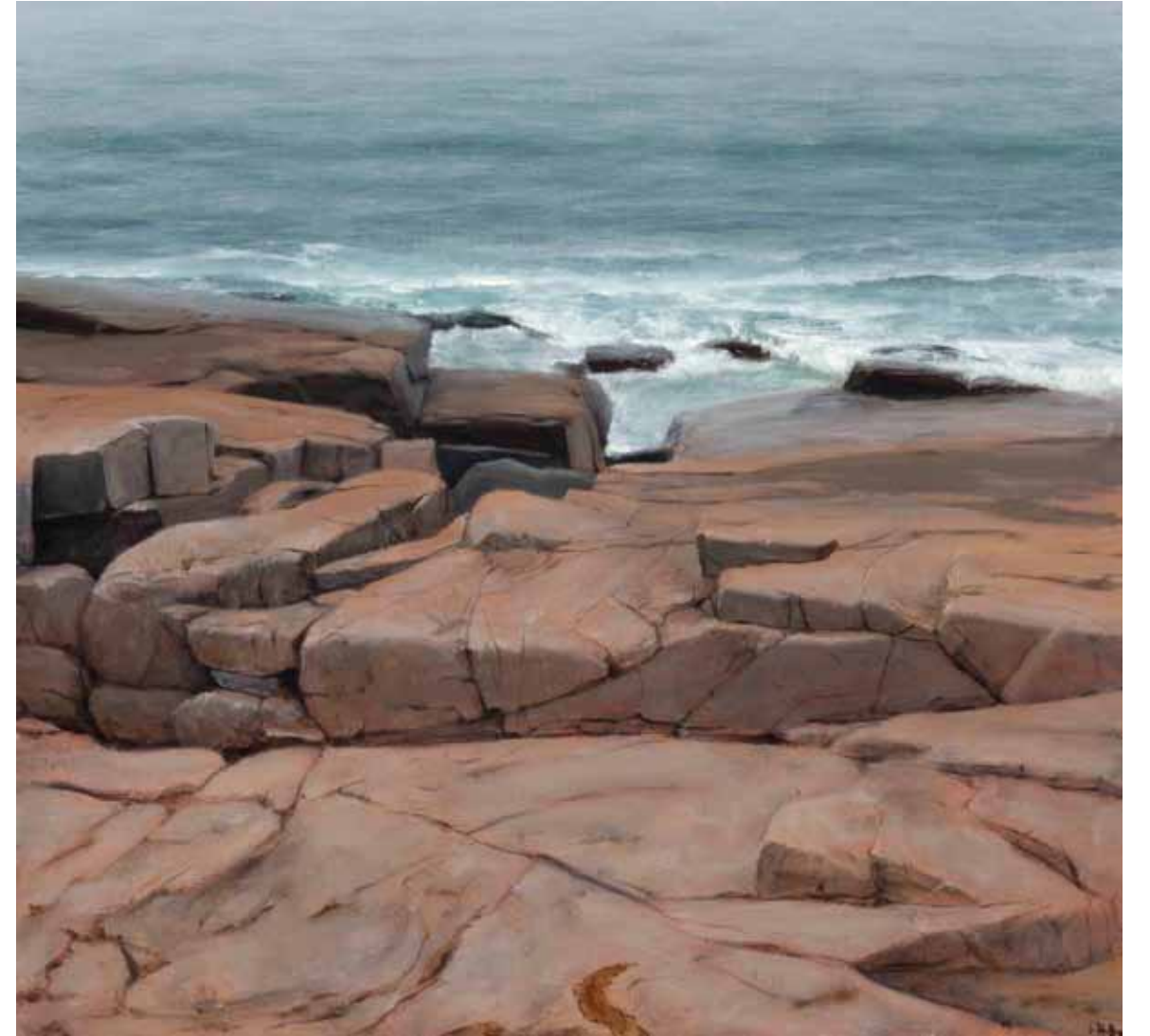
Light Fog at Schoodic Rock , oil on canvas, 28 x 30 inches