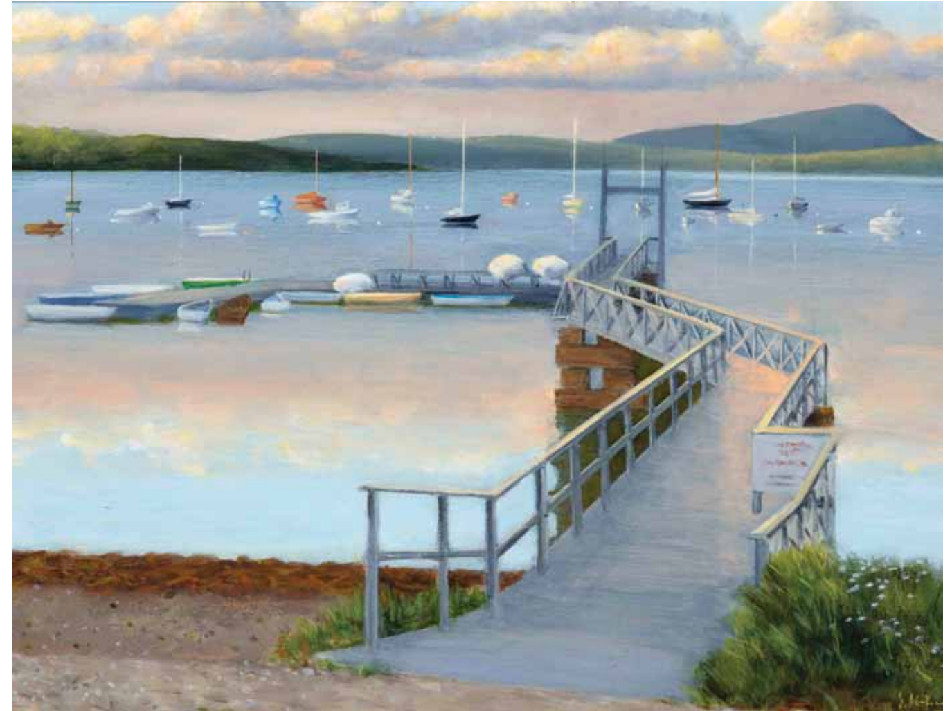
Hancock Pier , oil on canvas, 16 x 21 inches