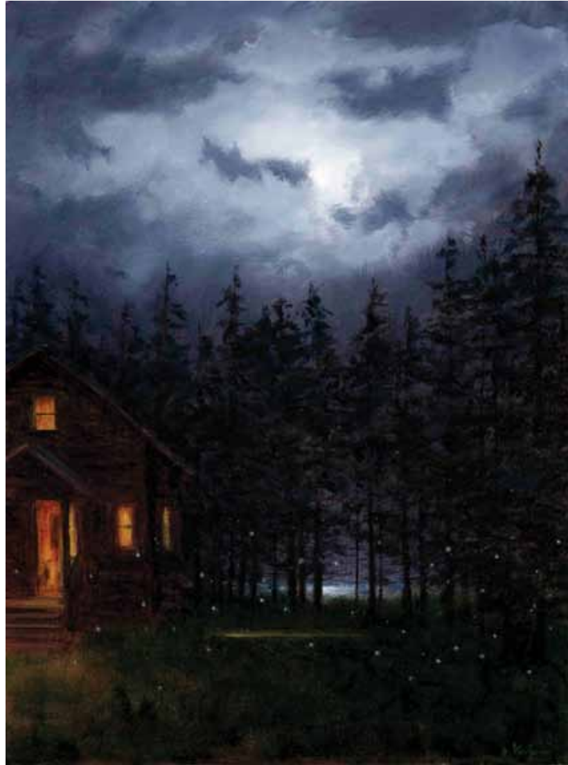
Summer Solstice (Fireflies) oil on canvas 16 x 12 inches