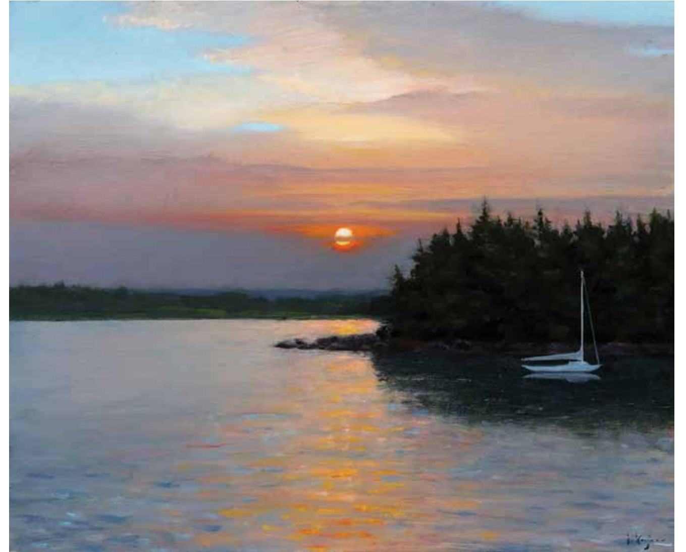
Sunset Near Trenton , oil on canvas, 15 x 18 inches