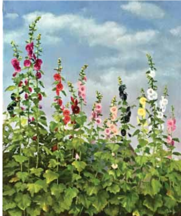
Hollyhocks! , oil on canvas, 18 x 15 inches