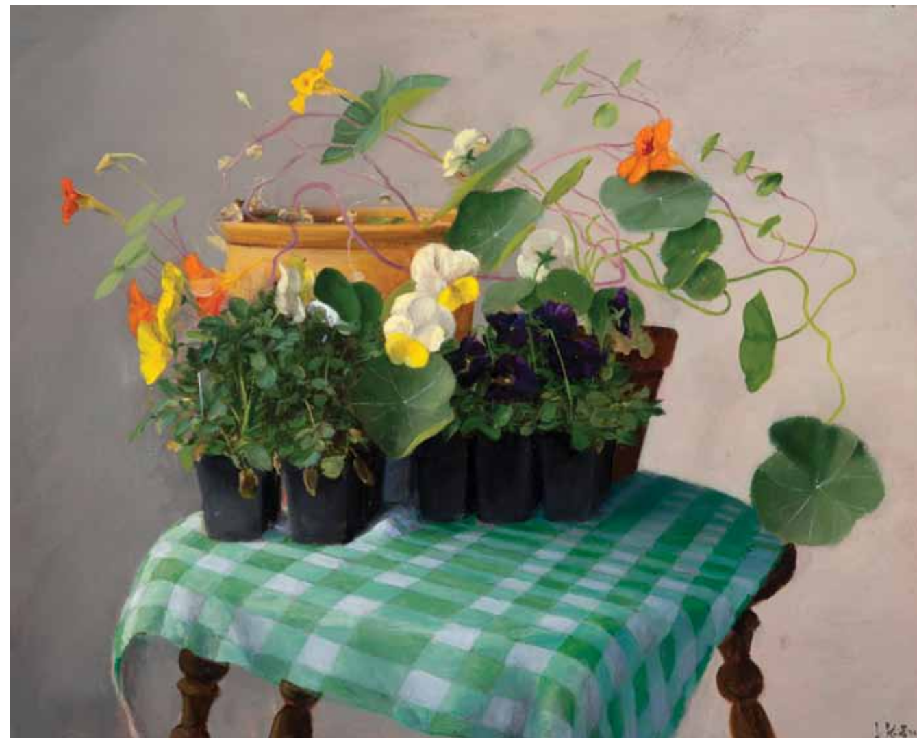
Nasturtiums and Pansies on Green Gingham Cloth, oil on canvas, 16 x 20 inches