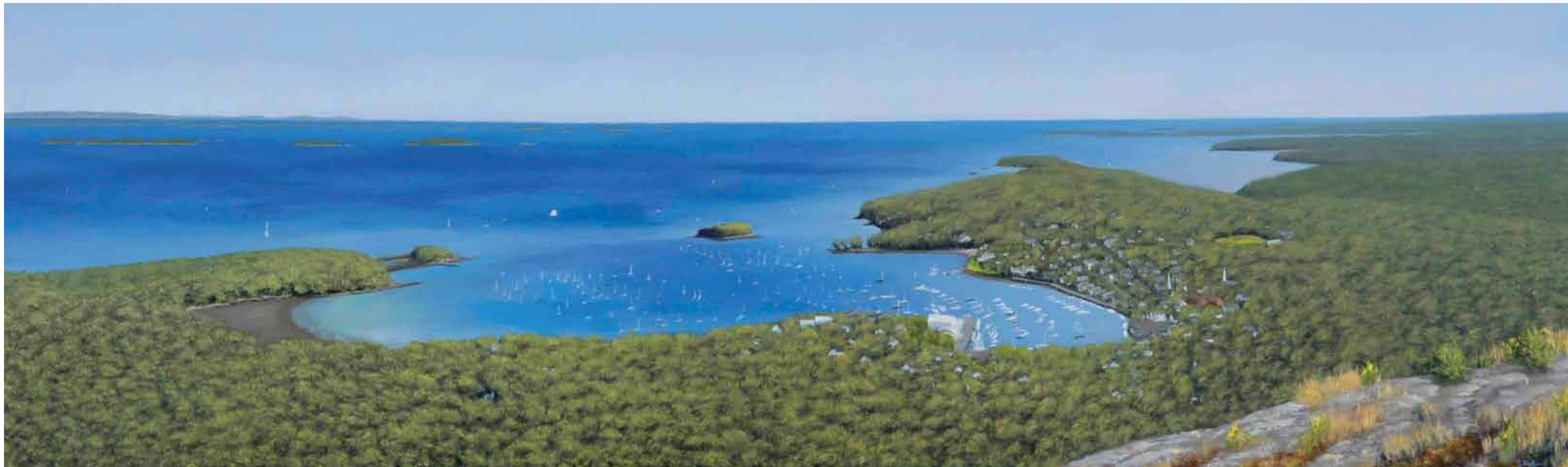
Mount Deset to Monhegan oil on canvas 20 x 66 inches