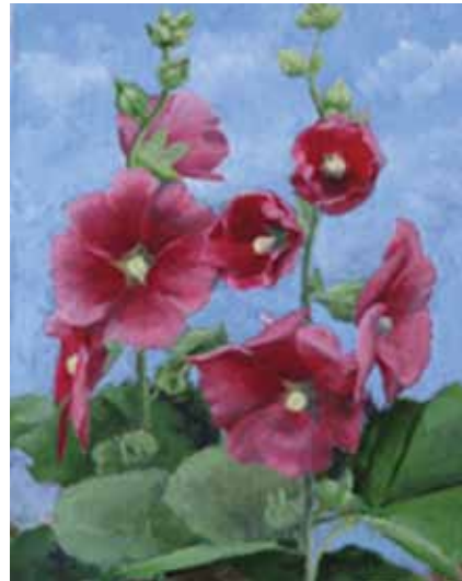
RIGHT Red Hollyhocks oil on canvas 10 x 8 inches