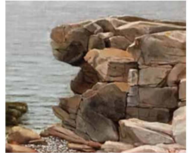
RIGHT Study of Rocks oil on canvas 10 x 12 inches