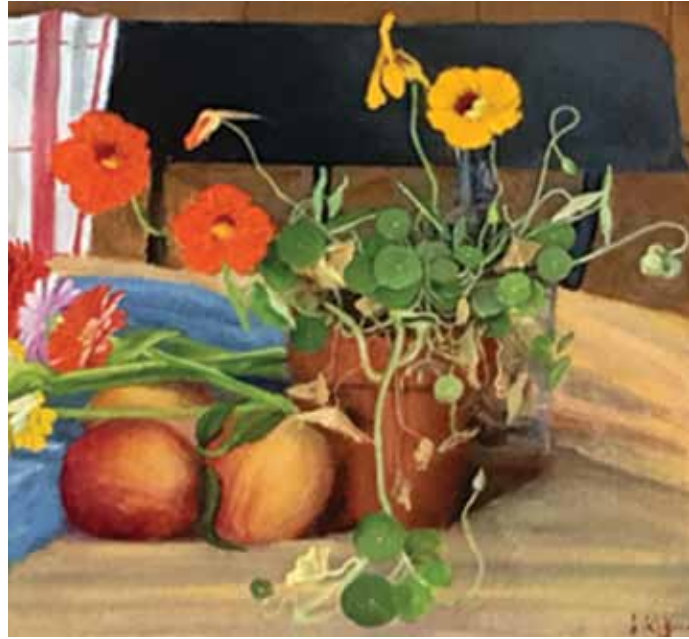
TOP The Fruits of August oil on canvas 11 x 12 inches