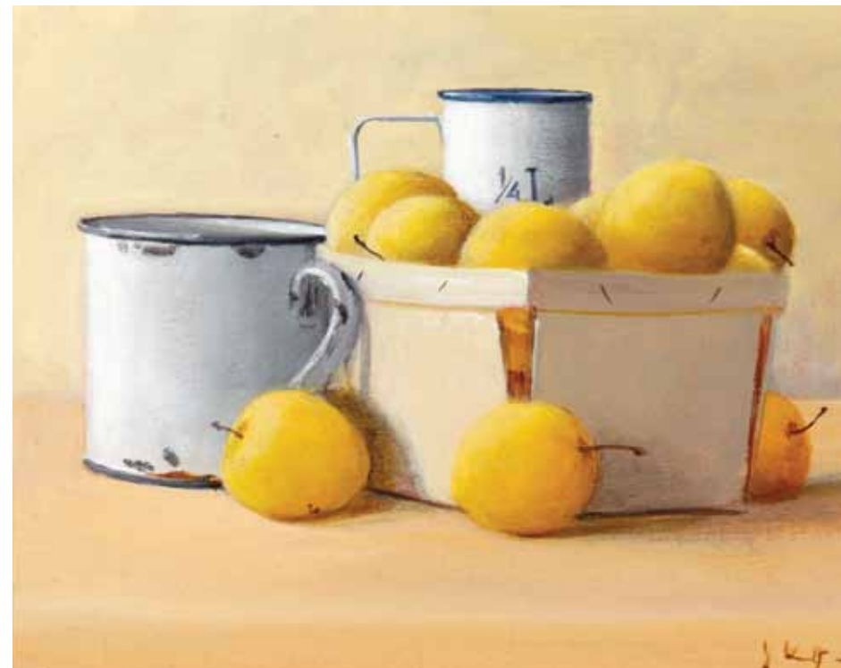
Yellow Plums, White Cups , oil on canvas, 8 x 10 inches