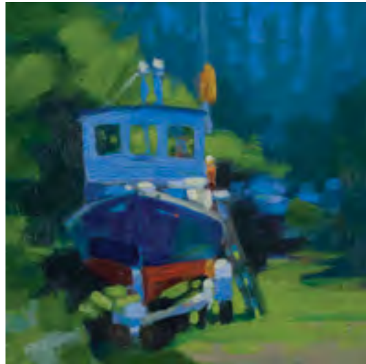
For Sale , oil on canvas, 6 x 6 inches