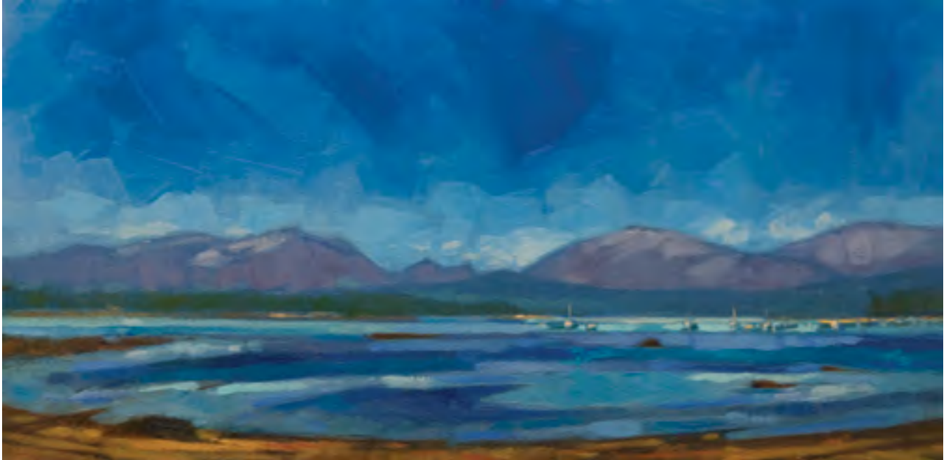
Into the View , oil on canvas, 11.5 x 23 inches