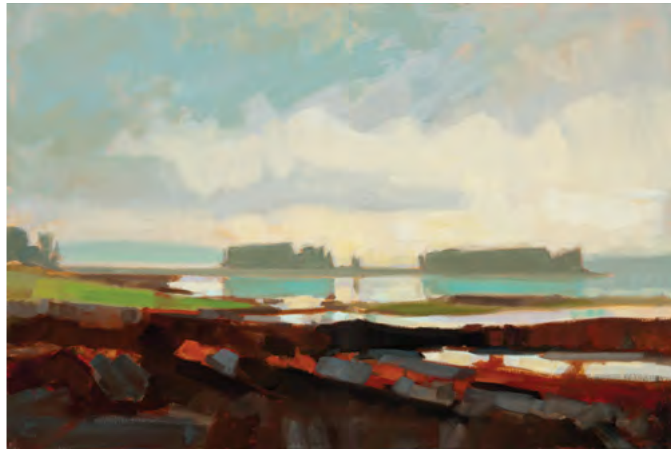
Misty Pool , oil on canvas, 24 x 36 inches