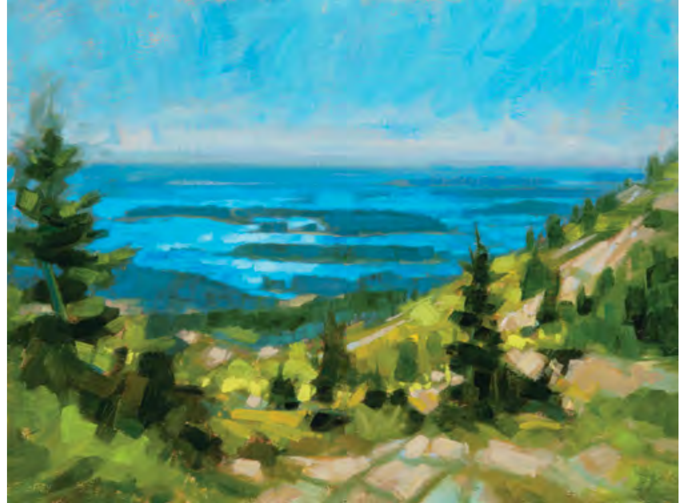
From the Top , oil on canvas, 18 x 24 inches