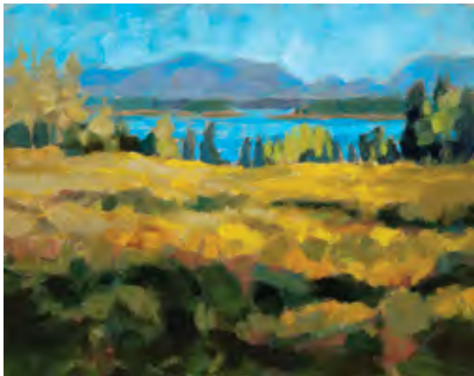
Summer Light, Great Cranberry Island oil on canvas 8 x 10 inches