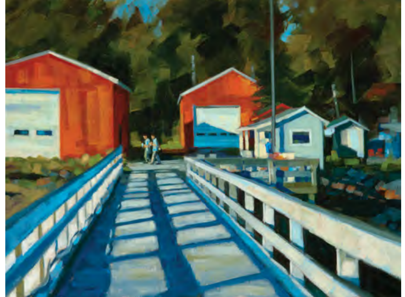
Early to Work , oil on canvas, 30 x 40 inches