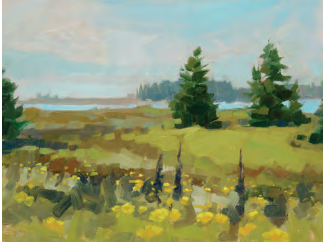
Summer Heat , oil on canvas, 18 x 24 inches