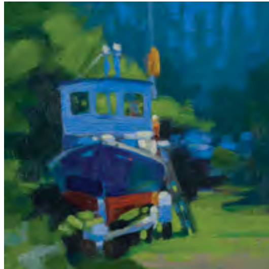
For Sale , oil on canvas, 6 x 6 inches