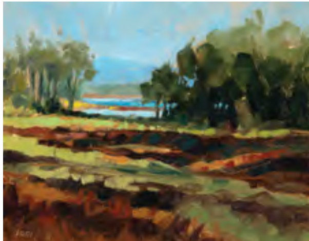
Into the Depths , oil on canvas, 8 x 10 inches

Karin Wilkes Courthouse Gallery Fine Art