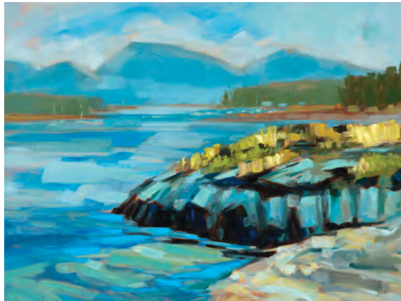
Thrumcap and MDI, oil on canvas, 30 x 40 inches