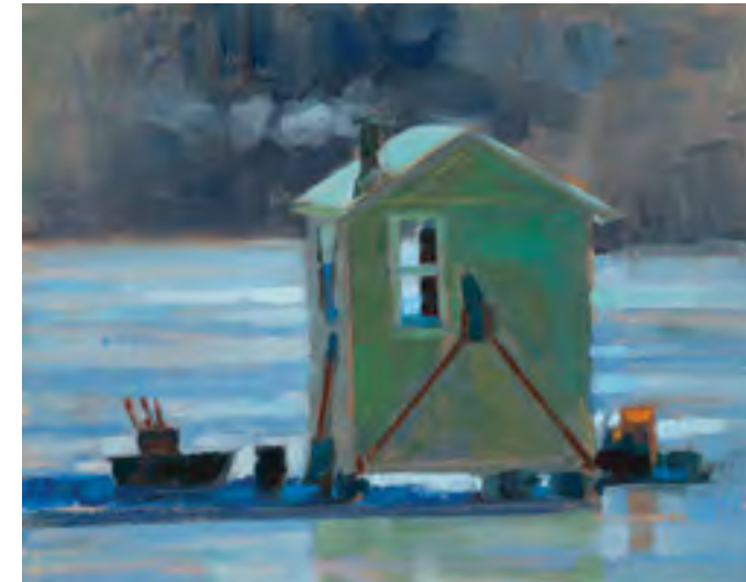
Last Shack Standing , oil on canvas, 8 x 10 inches COVER Waiting for a Crew , oil on canvas, 30 x 40 inches