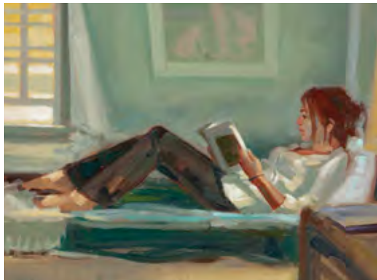
Dreaming of Matisse oil on canvas 12 x 16 inches