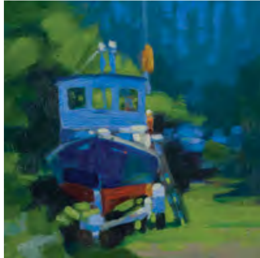
For Sale , oil on canvas, 6 x 6 inches