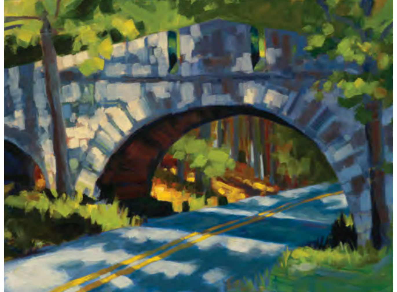
A Way Through , oil on canvas, 18 x 24 inches