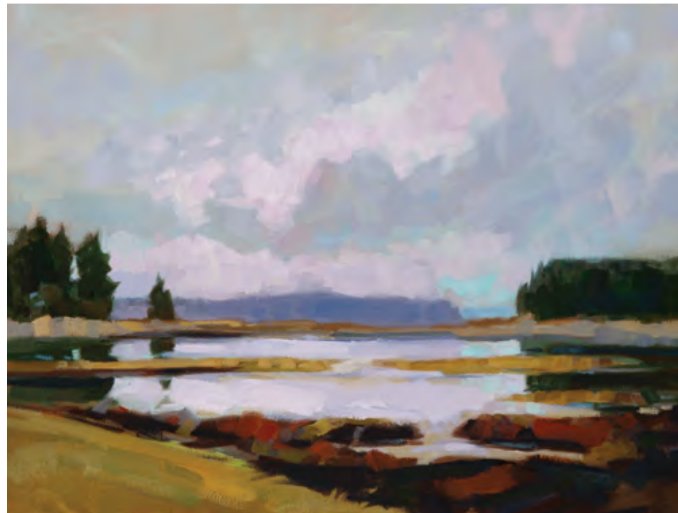
Light Play , oil on canvas, 18 x 24 inches