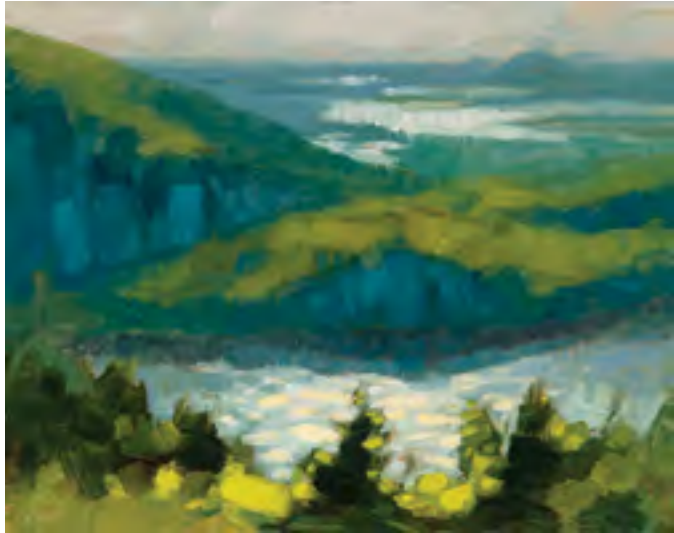
Sparkle oil on canvas 8 x 10 inches