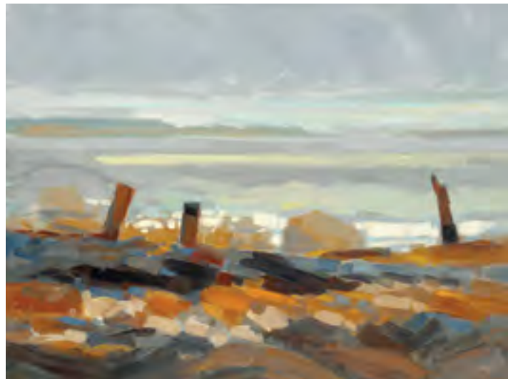
The Pool, Low Tide oil on canvas 18 x 24 inches