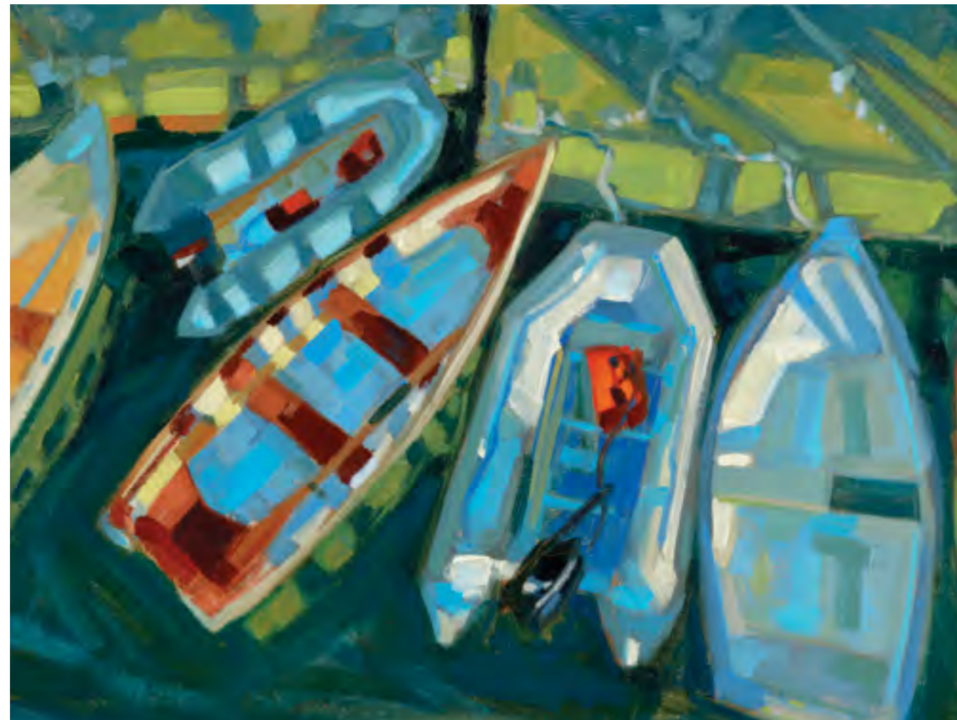
I See a Pattern , oil on canvas, 18 x 24 inches