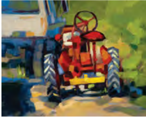
Opposites Attract , oil on canvas, 8 x 10 inches

an exquisitely painted dock. On occasion, Frey has used a heavy hand with contrast, sometimes sacrificing gestalt. But, in Waiting , he nails this balance between tension and harmony perfectly.