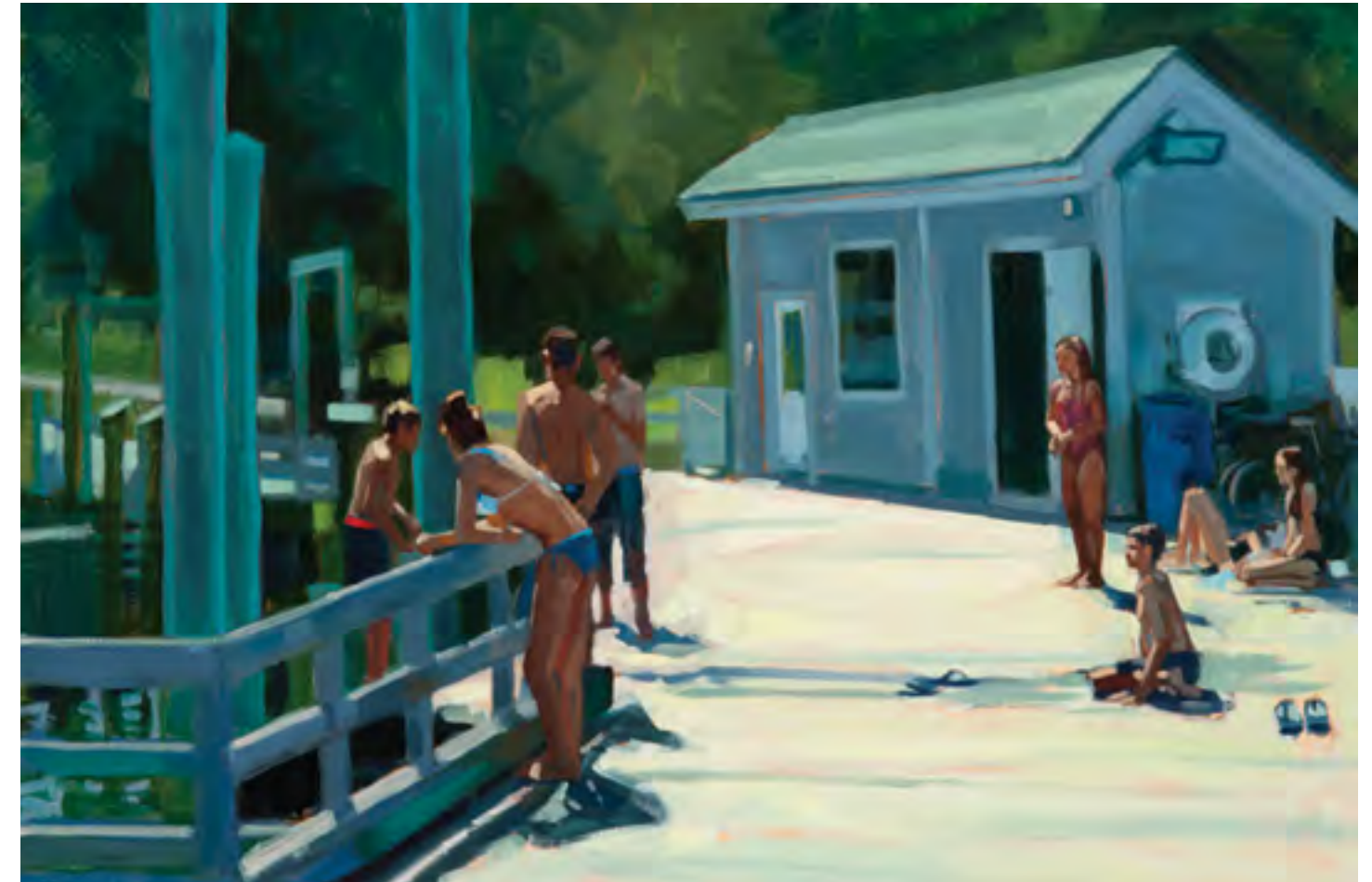
You Can Do It! , oil on canvas, 24 x 36 inches