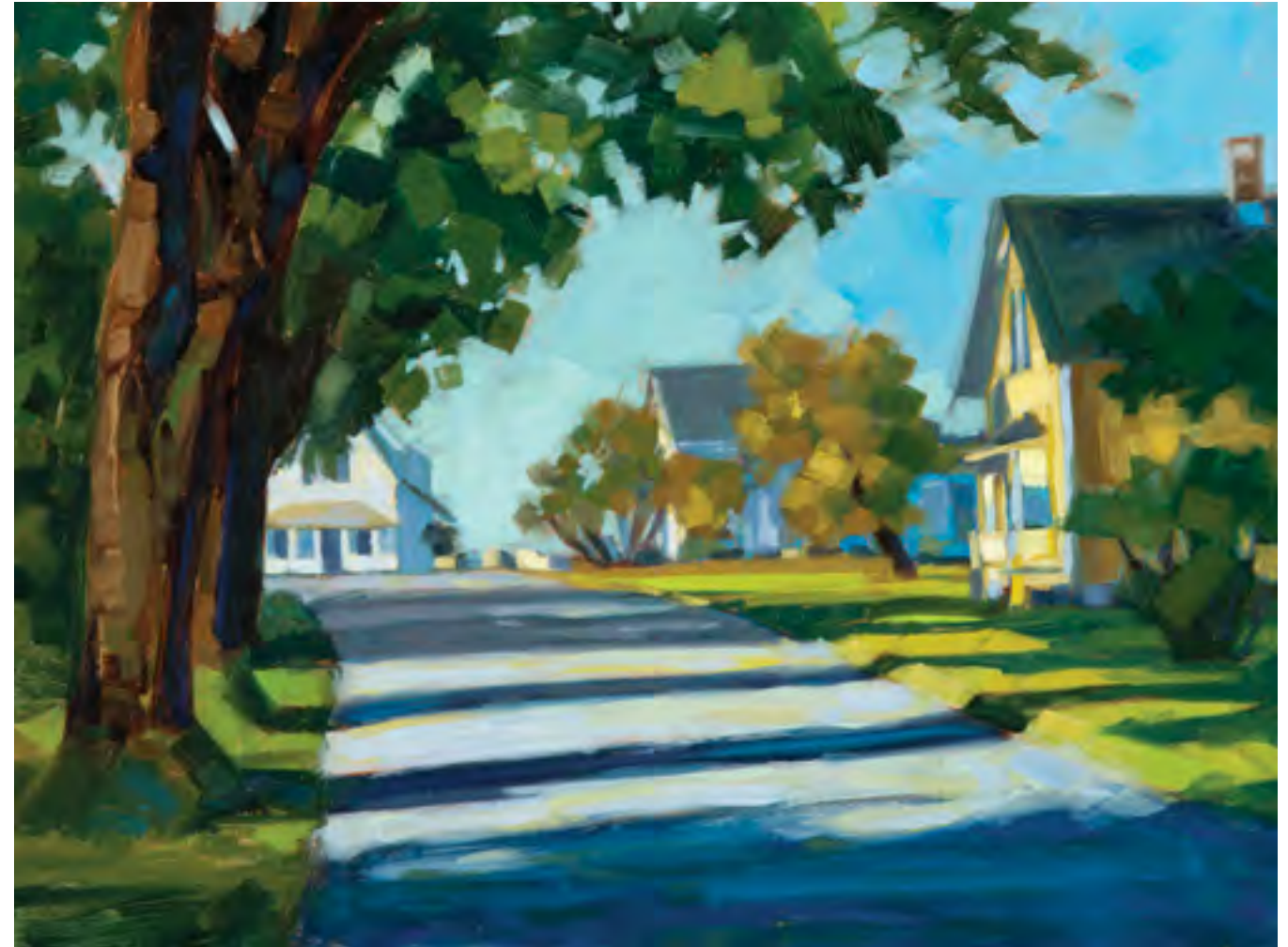
Light Through the Maples , oil on canvas, 18 x 24 inches