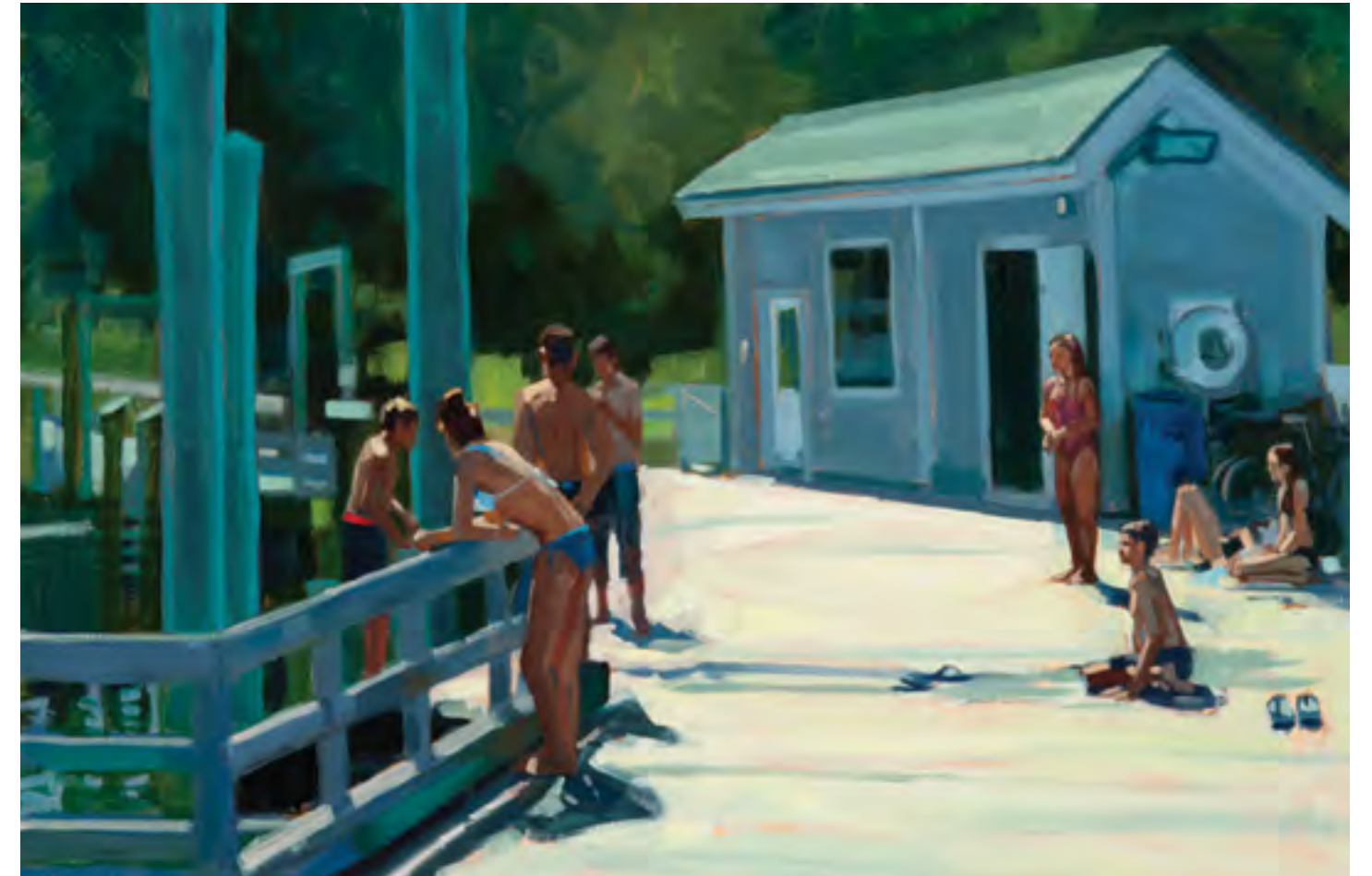
You Can Do It! , oil on canvas, 24 x 36 inches