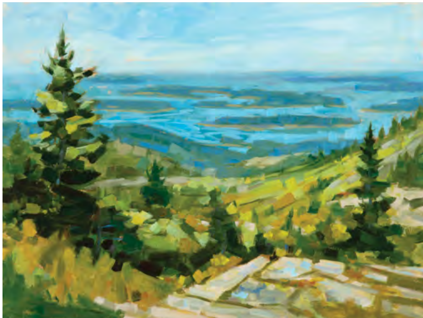
From the Top to the Archipelago, oil on canvas, 30 x 40 inches