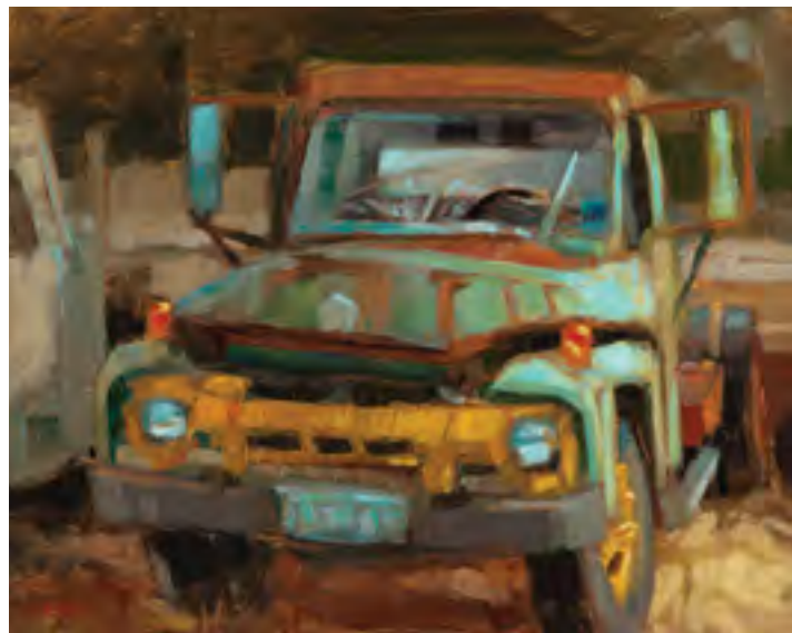
Rusty oil on canvas 8 x 10 inches