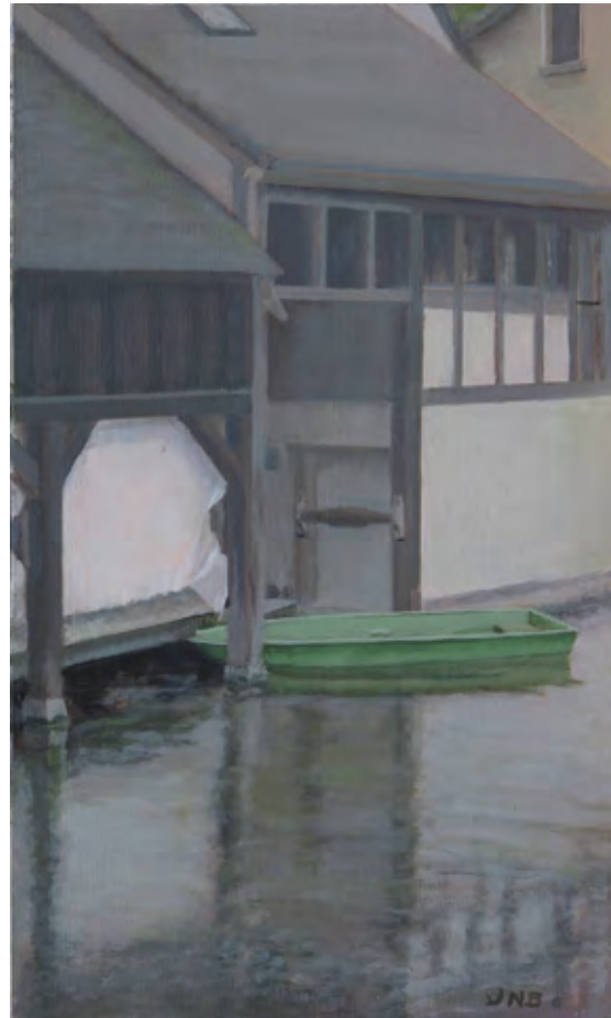
Chartes , 2013, oil on panel, 12 x 7 inches