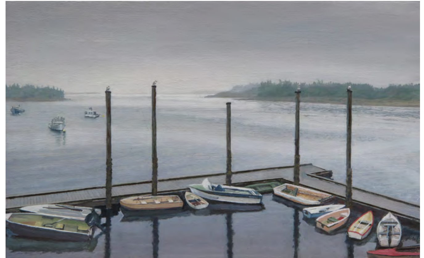
Low Tide Dock , oil on panel, 10 x 17 inches

—Karin Wilkes Courthouse Gallery Fine Art