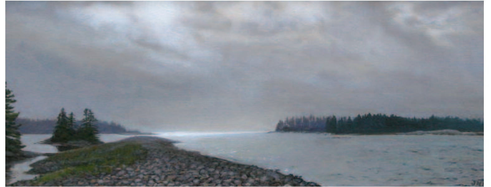
Light at Schoodic, 2009 oil on panel 9.5 x 20.5 inches