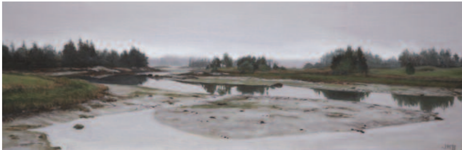
Bass Harbor, 2009 oil on panel 6.5 x 19 inches