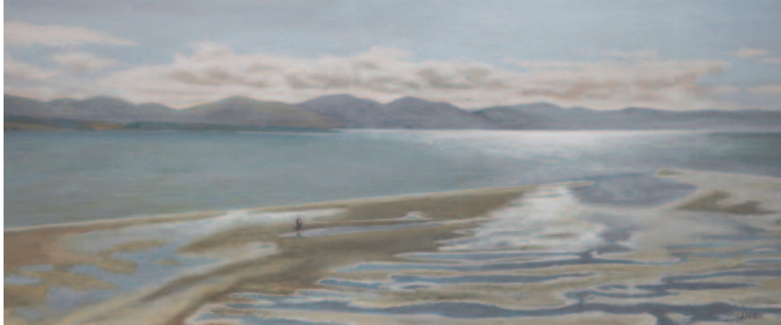
Bruny Island, 2009 oil on panel 8 x 19 inches