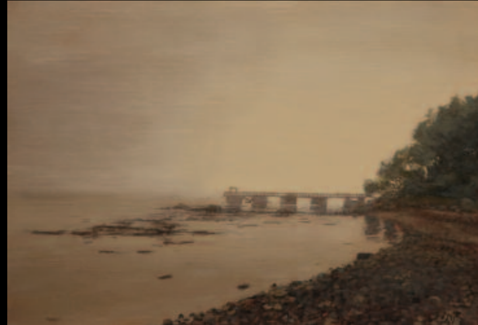
Pier in Fog, 2009, oil on panel, 7.5 x 10.5 inches