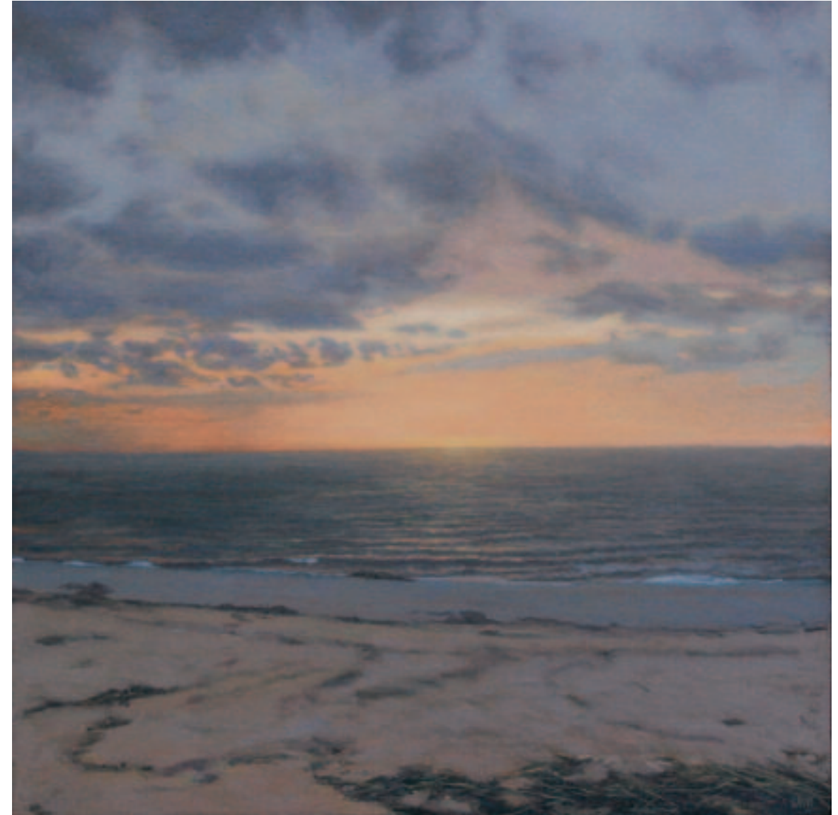
OPPOSITE Bay at Sunset, 2009 oil on canvas 30 x 30 inches