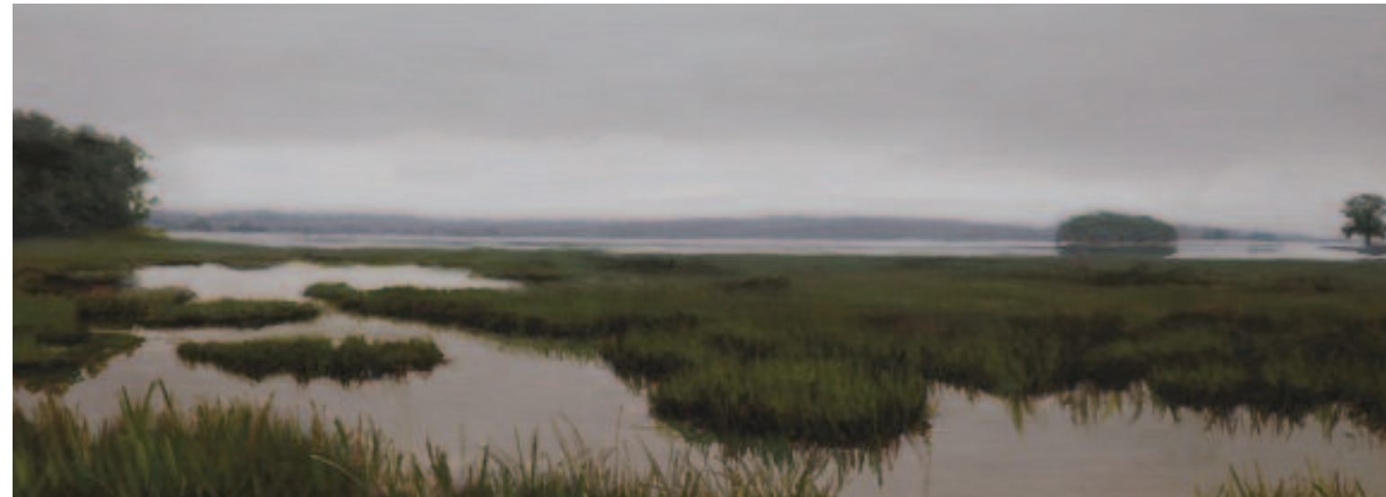
Salt Marsh, 2009 oil on panel 6.5 x 16.5 inches