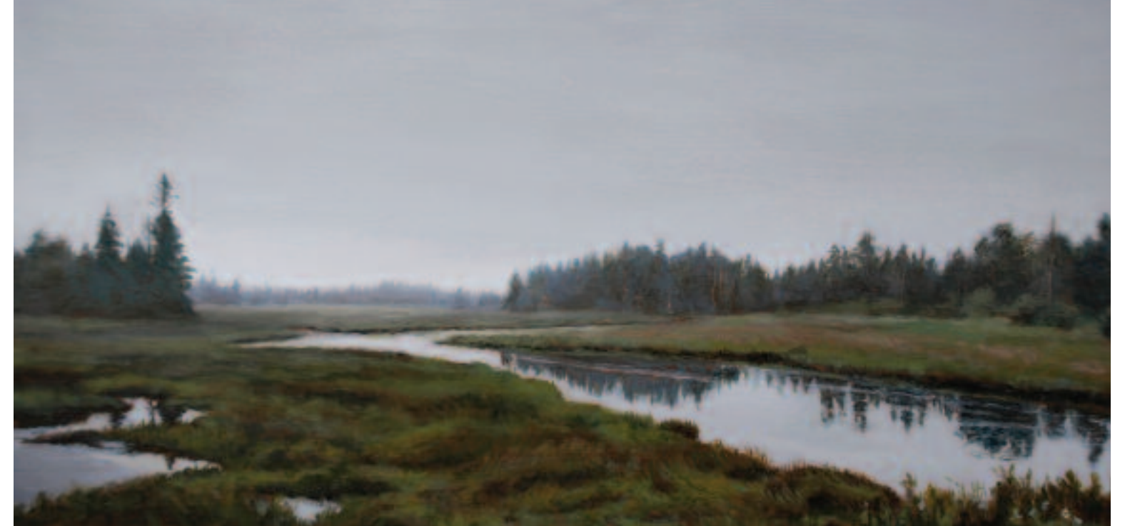
OPPOSITE Back Inlet , 2009 oil on panel 7 x 13.5