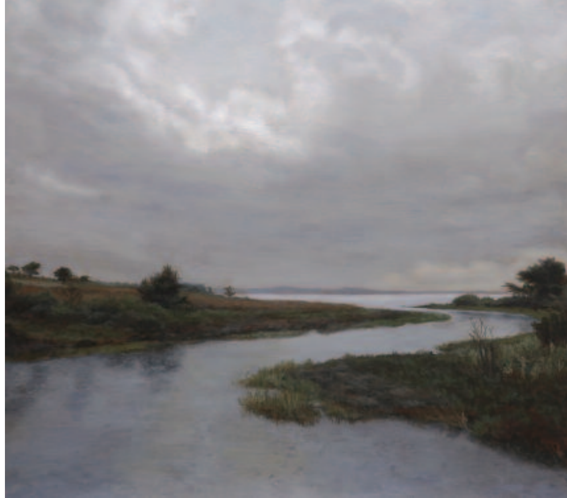
Bass Inlet , 2009 oil on panel 10.5 x 11 inches