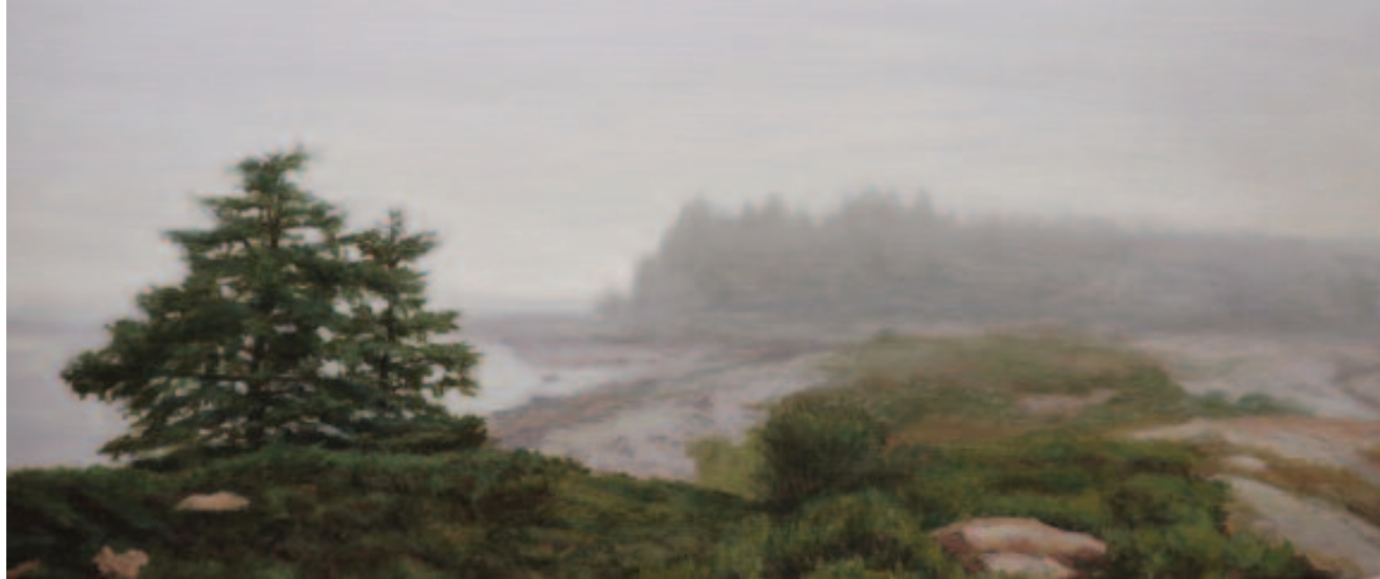
Original Island, 2009 oil on panel 6.5 x 15 inches