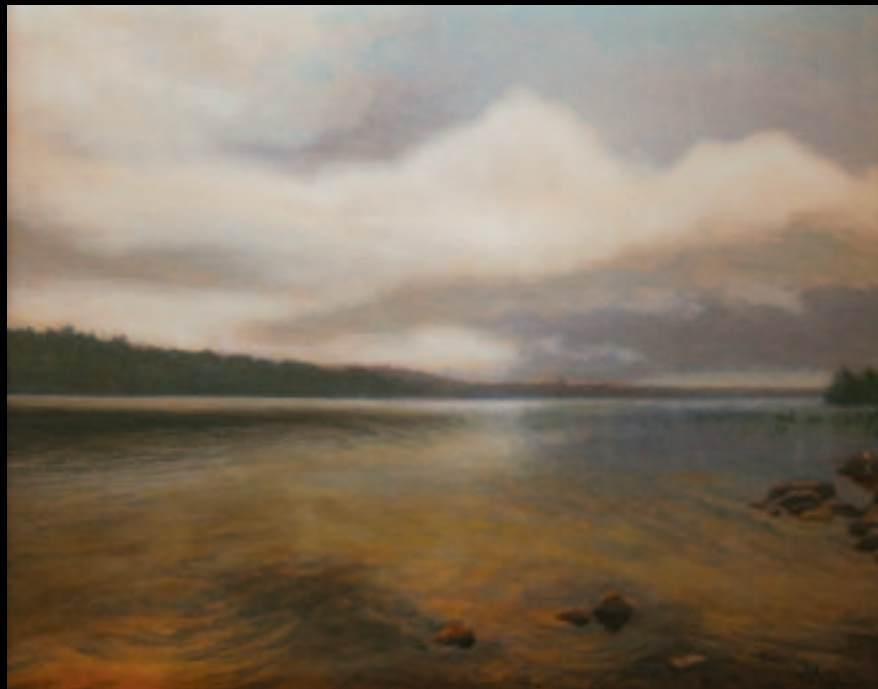
Acadia Lake, 2009 oil on panel 8.5 x 10.5 inches