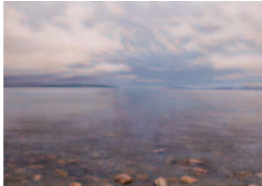
Acadia Point, 2009

Belasco paintings are represented in numerous private collections